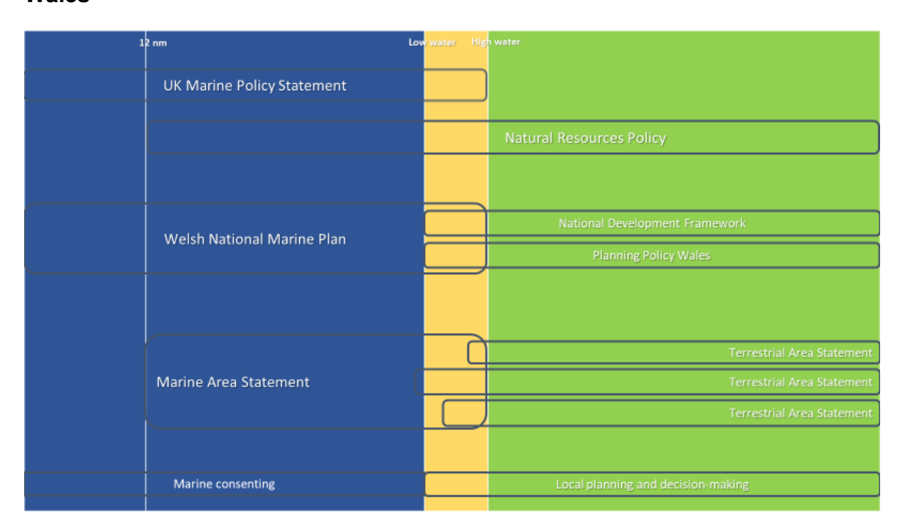
Annex 3: The relationship between planning and management regimes across Wales

The Natural Resources Policy extends across Wales out to 12nm and informs the content of the Welsh National Marine Plan. The NRP confirms the marine plan as a key mechanism to deliver the national priorities in the NRP in the marine area. The marine plan contains many high-level policies relating to the sustainable management of marine natural resources, in addition to some spatial policies for certain sectors/marine resources.