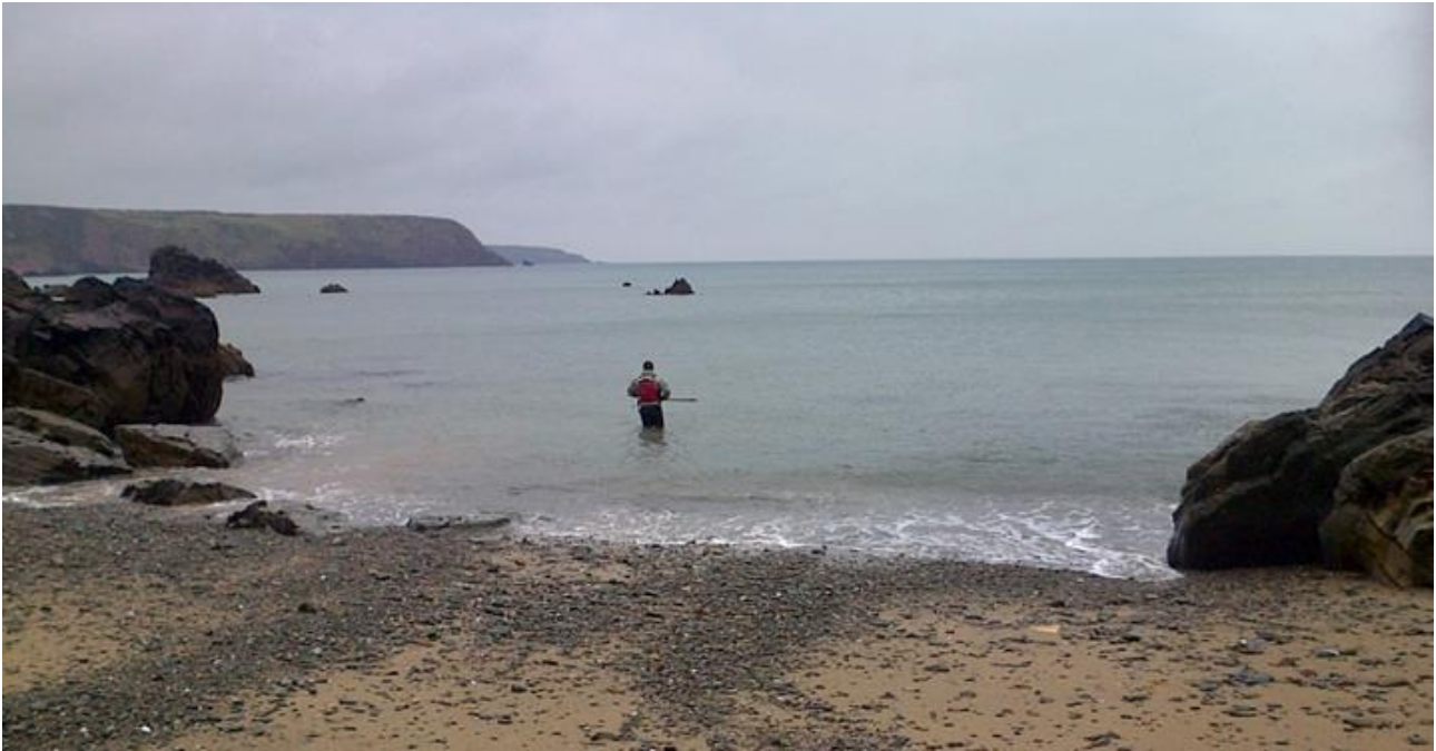
Bathing water sampler at Marloes Sands

In Wales the bathing season runs from 15 th May to 30 th September each year. Monitoring begins from 1 st May as each bathing water has one pre-season sample taken. There may also be a pre-season inspection to identify any issues. Throughout the bathing season, Natural Resources Wales collects water samples at designated bathing sites. The samples are analysed for two types of bacteria, Escherichia coli ( E. coli ) and intestinal enterococci.