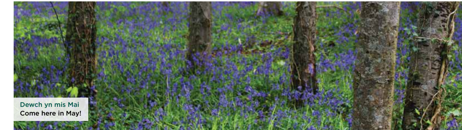
Dewch yn mis Mai Come here in May!

Atgynhyrchir y map hwn o ddeunydd yr Arolwg Ordnans gyda chaniatâd Arolwg Ordnans ar ran Rheolwr Llyfrfa Ei Mawrhydi. © Hawlfraint y Goron a hawliau cronfa ddata 2018 Arolwg Ordnans 100019741. This map is based upon Ordnance Survey material with the permission of Ordnance Survey on behalf of the controller of Her Majesty's Stationery Office © Crown copyright and database rights 2018 Ordnance Survey 100019741.