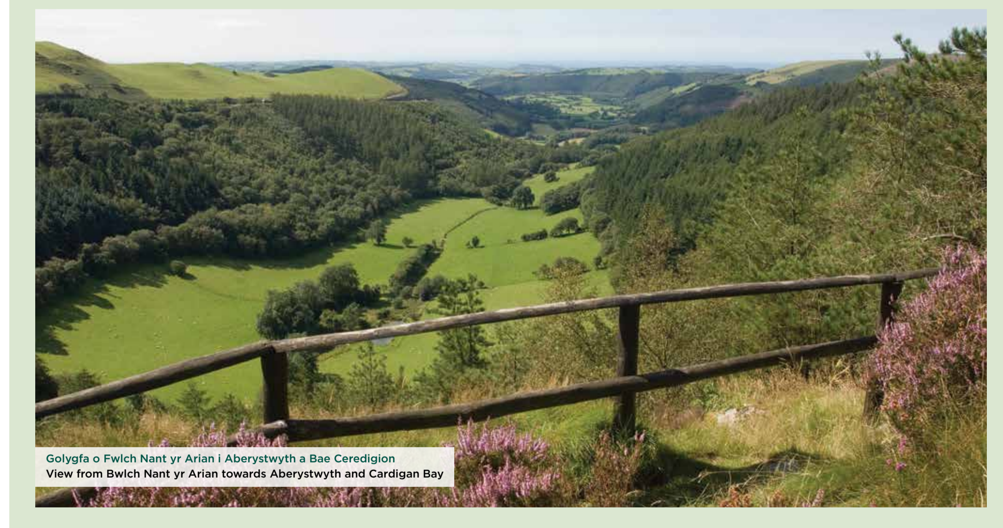
Golygfa o Fwlch Nant yr Arian i Aberystwyth a Bae Ceredigion View from Bwlch Nant yr Arian towards Aberystwyth and Cardigan Bay

The ancient county of Ceredigion is characterised by its stunning coastline, remote upland landscape, wonderful wetlands and deep river valleys. Natural Resources Wales is proud to look after some real gems in this scenically dramatic yet tranquil part of Wales.