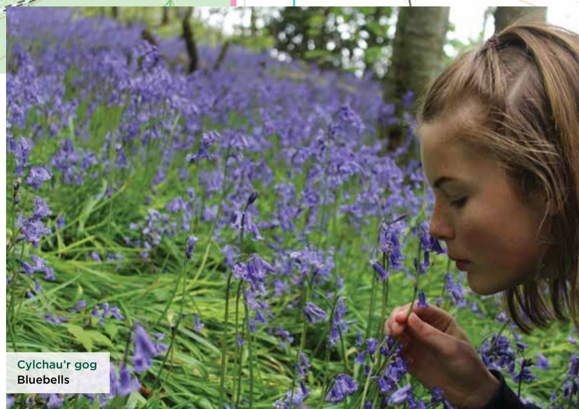
Cylchau'r gog Bluebells

www.cyfoethnaturiol.cymru www.naturalresources.wales 0300 065 3000