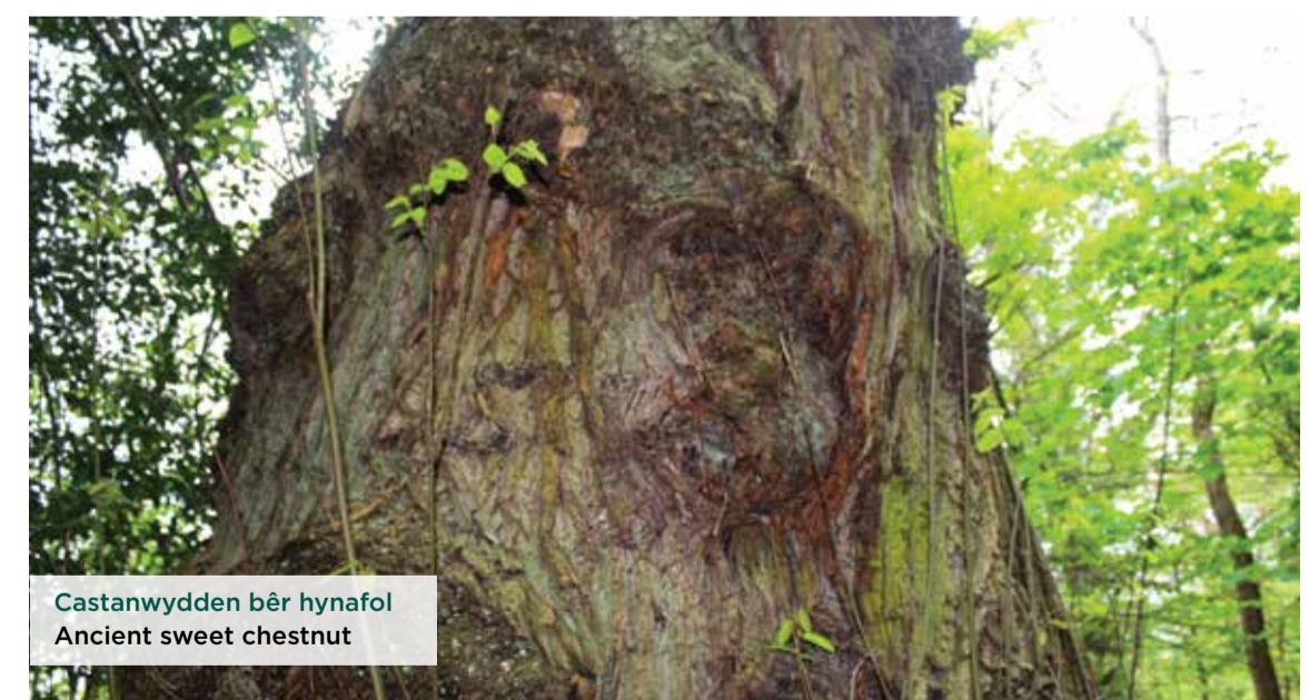
Castanwydden bwr hynafol Ancient sweet chestnut