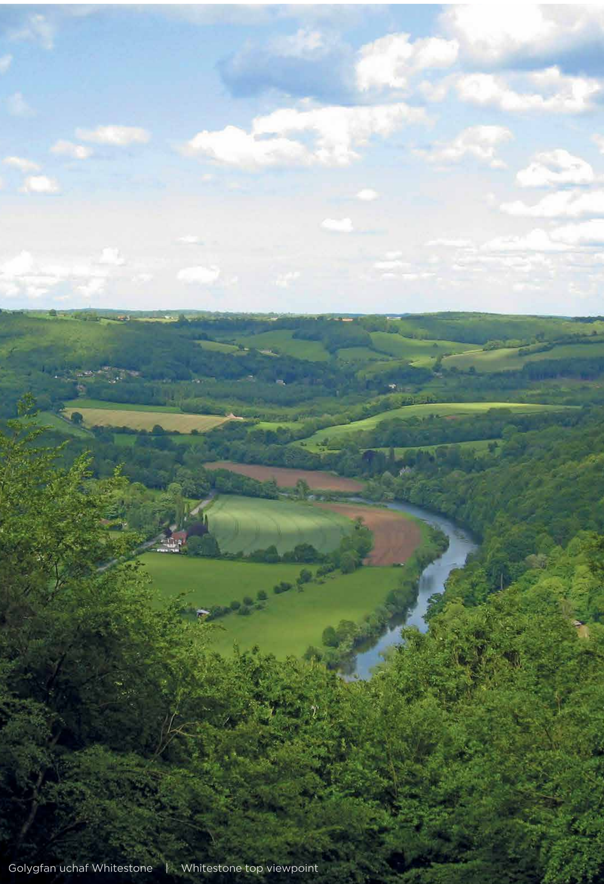
Golygfan uchaf Whitestone | Whitestone top viewpoint