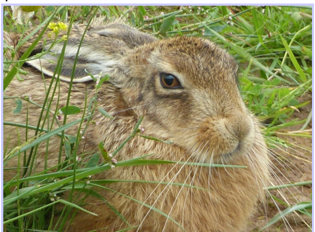
Brown Hare

A major part of the plan is to join these areas using wildlife corridors which will create larger, protected areas for creatures to live and thrive.