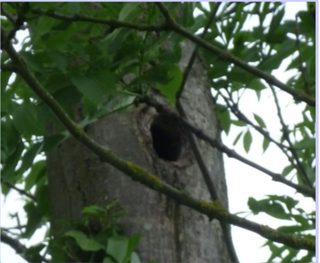
Woodpecker hole roost

Twelve Bechstein's bats were caught in Grafton Wood during survey periods in late May, early June and late August 2012 (four animals in each period), and eight (one male and seven females) were radio-tracked for between six and nine nights each.