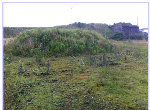
Tata Steel, Port Talbot

The rich industrial heritage of this area, including coal mining and heavy metal smelting, has created a legacy of sites, some of which contain contaminated substrates; this is the case at Pluck Lake, a former copper smelting site. The varied and often stressed ground conditions found on brownfield sites can support unique habitat mosaics such as bare ground, wildflower rich grassland, heathland, lichen heath and scrub – making these habitats a haven for wildlife; especially for invertebrates.