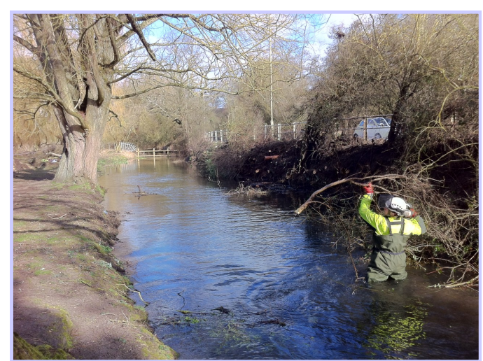
Work begins on one of the projects outlined in the catchment management plan

The Catchment Based Approach involves developing plans specific to each catchment, recognising that each river is unique and faces different challenges and opportunities. Instead of a top down approach, Catchment Management Plans are developed and implemented by a partnership of local people and organisations with an interest or stake in the river. The emphasis is