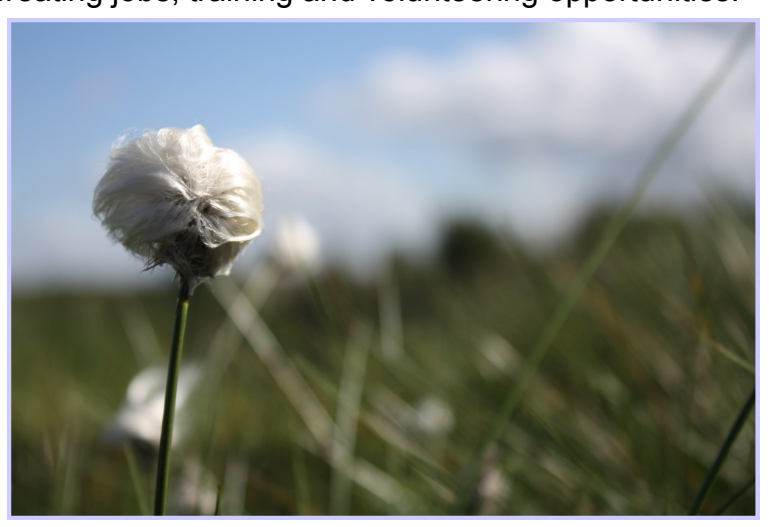
Cotton Grass on Astley Moss

The partnership wants to get local people and businesses involved in the wetlands, eventually creating jobs, training and volunteering opportunities.