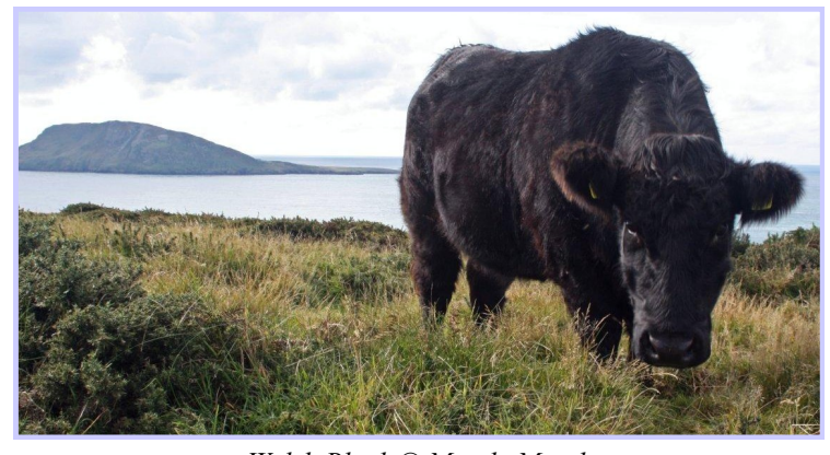
Welsh Black

This management has already helped to spread three-lobed water crowsfoot at Cilan,