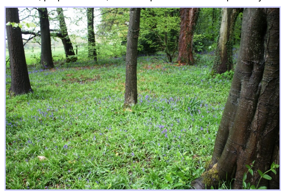
Bluebell Carpets

Bluebells can be blue, purple or white, however pink bluebells are probably the Spanish variety.