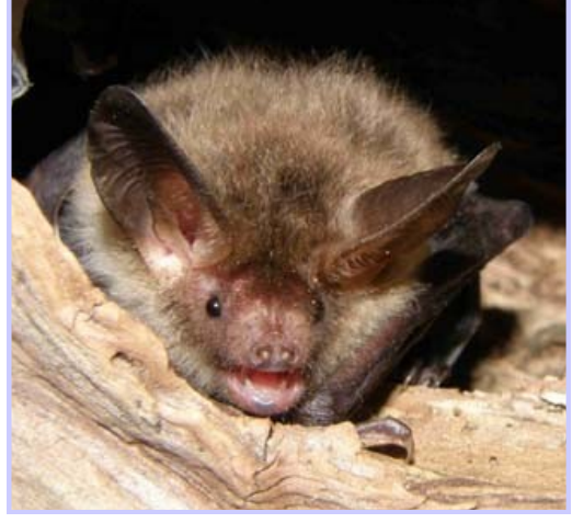
Bechstein Bat

In 2005 the Bechstein's bat population was believed to be just 1500 in England, confined to a handful of sites ranging from Gloucestershire to Sussex. Apart from a record, in 1993, where a single bat was found clinging to the side of a building on a trading estate in Evesham, the bat was unknown in Worcestershire and there was no evidence to suggest a breeding colony.