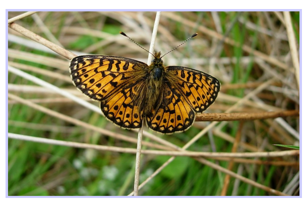
Large Heath Butterfly

More information on the campaign and how to get involved can be found on CSFT's website