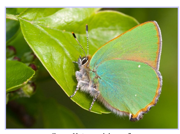
Green Hairstreak butterfly

Following the success of biodiversity projects on British Bluebells, Bats, Bumblebees and Tree Sparrows, CSFT are focusing of peatland and heathland butterflies for 2013, in an attempt to improve the CSF area for Large Heath, Green Hairstreak and Small Pearl Bordered Fritillaries.