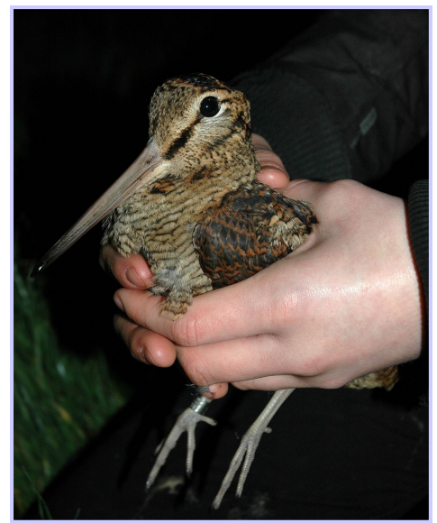
Scientists from the Game & Wildlife Conservation Trust have proved that migrating woodcock from the UK are travelling enormous distances to breed. 'Monkey' who was satellite tagged in Cornwall two years ago has travelled at least 39,000 km in his life-time

But 'Monkey', the current record-holder has a younger contender following in his flight-path. 'Crugith', a female known to be two-years old, who was tagged in Cornwall earlier this spring, has already caught up with the more experienced Monkey in Siberia and is now preparing to breed.