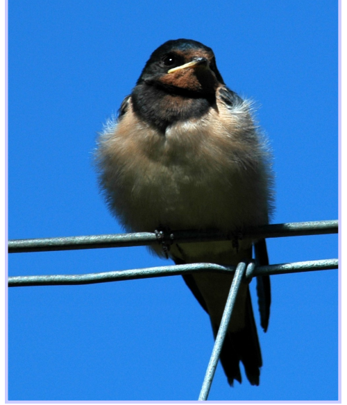
Swallow

has provided clear evidence that spring is arriving earlier. Working with scientific partner the Centre for Ecology and Hydrology, it has been found that in spring, insects are being seen three weeks earlier on average, plant growth is up to two weeks earlier and bird activity is a week earlier.