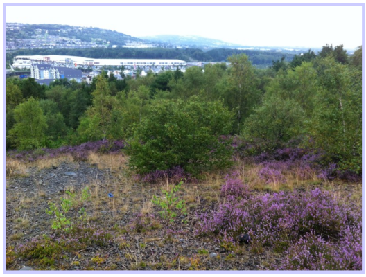
Kilvey Hill, Swansea

Thanks to funding from WREN, a landfill tax grant giving body, Buglife has embarked on its first project in Wales, identifying and improving the biodiversity found on brownfield sites in Swansea and Neath Port Talbot.