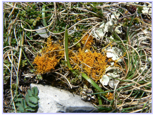
Golden Hair Lichen

One of Llŷn's heathlands is also the only mainland site in the