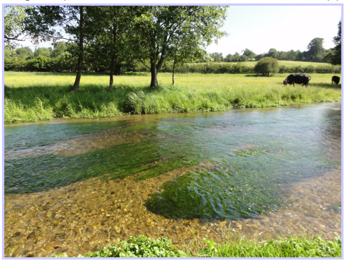
A healthy section of the Mimram

Defra has gathered feedback from each of these pilot catchments, and selected the best examples of good practice into the rollout of a national approach.