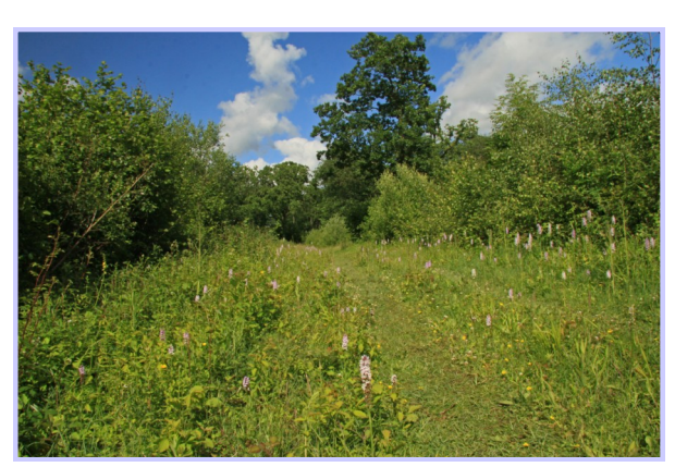
Grafton ride

Compositional habitat analysis revealed a clear preference for dense clutter (areas of active coppice re-growth within woodland) and clutter with open areas (derelict coppice, tree lines and wooded river corridors). More open habitats (clearfell in woodland and arable fields) within home ranges were least preferred. These findings are broadly consistent with those from other studies of Bechstein's bat and will be used to inform