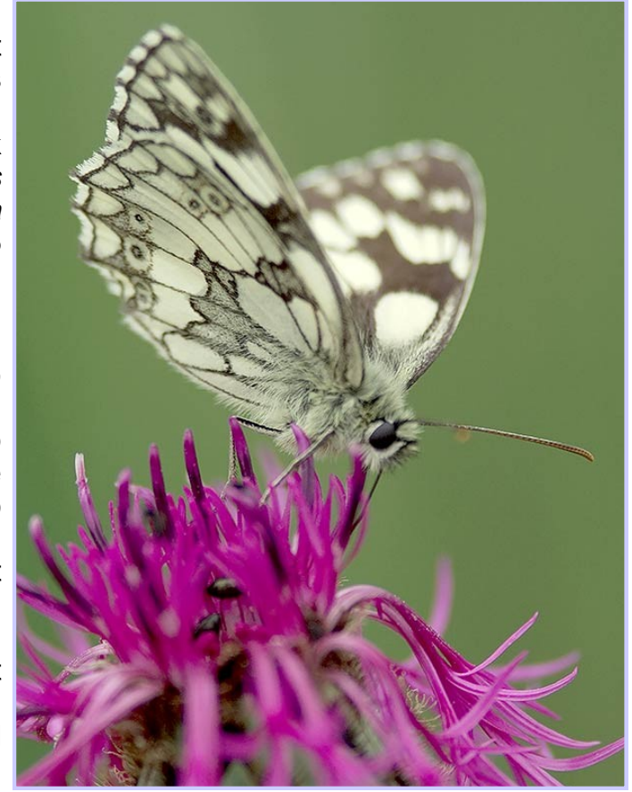
Marbled While Butterfly

Overstocking of grazers can cause a loss of plant and animals species and prevent natural regeneration, through soil compaction and overgrazing. But balanced regimes with appropriate grazing pressure can increase habitat diversity, support important wildlife populations