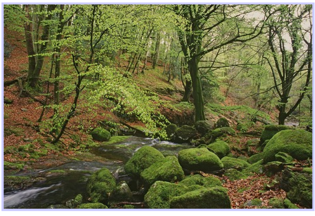
Dendles wood stream