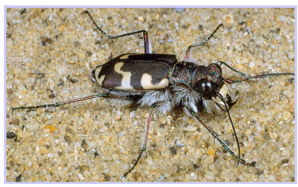
Cicindela Maritima