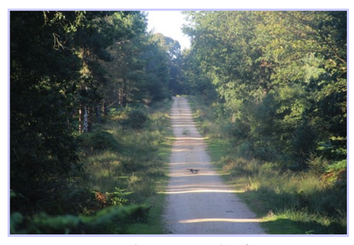
New Forrest

already been searched. Users can then visit the website and locate places where they have submitted their surveys, manage their reports and connect to the community online.