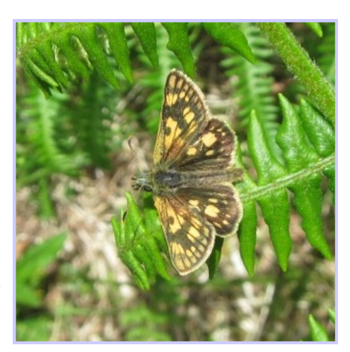
Chequered Skipper

"We targeted suitable habitat in Glen Etive, starting at a fenced off area in Dalness. This looked perfect for Chequered Skippers, having a south-east facing slope covered with scattered trees, purple moor-grass (the larval food plant) and bluebells, which the adults prefer to nectar on.