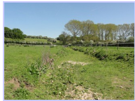
River Beane is dying of thirst

Unless you live near an exceptionally good or bad stretch of river, the chances are your answer might be: 'not perfect, but not terrible'. And, superficially, many of our rivers are doing ok – they aren't visibly polluted or stinking, and are pleasant, green places to visit. However, do a little digging, and it's no secret that most of the UK's rivers are not as healthy as they should be. Although tighter environmental regulations and more enlightened management have seen rivers improve dramatically over the past few decades, they are by no means out of the woods. Ongoing