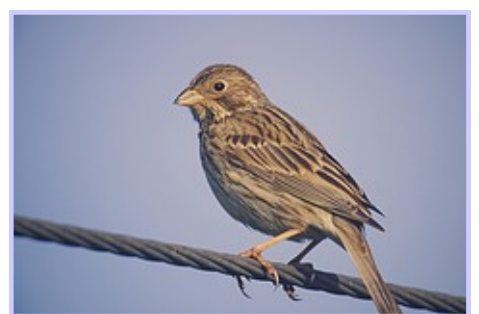
Corn Bunting

This first State of Natural Capital Report is a high-level document setting out the NCC's approach to achieving these goals. It recommends a set of actions that the Committee views as essential if we are to move towards managing our natural capital sustainably and thereby achieve the Government's environmental objectives (primarily as set out in the 2011 Natural Environment White Paper [NEWP]). These are 'to leave the natural environment of England in a better state than it inherited' because a 'healthy, properly functioning natural environment is the foundation of sustained economic growth, prospering communities and personal wellbeing' (NEWP, p.3).