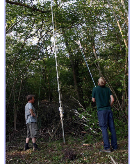
Setting up mist-nets

cavities, six were located outside woodland in features such as woodpecker and rot holes in short-lived trees such as Crack-willow. Roosts were also found in semi-mature Ash trees.