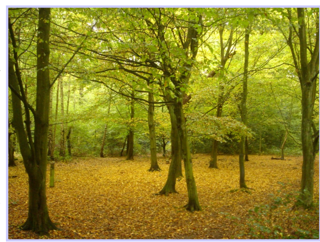
Hainault Forest

This branch of science is more scientifically known as 'phenology', effectively meaning the study of natural timings. Over the past thirty years phenology