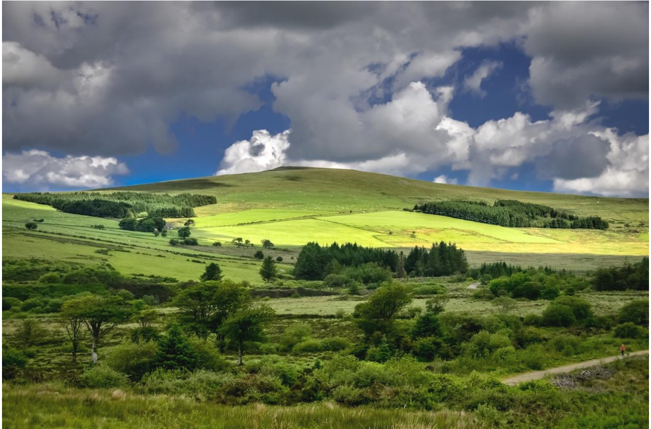
High summer pastures catch the sun near Rosebush, on the southern slopes of the Preseli Hills