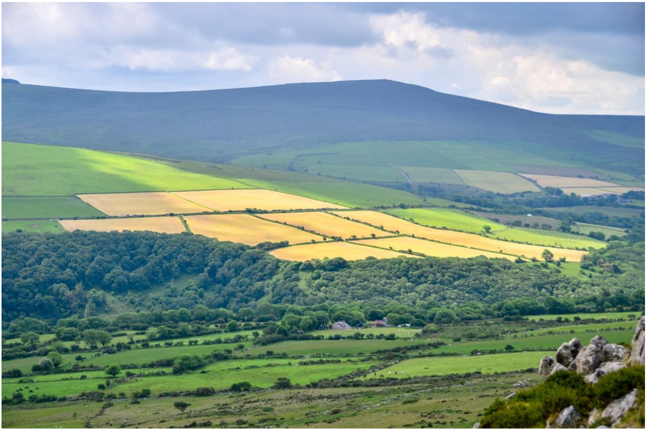
Hay time on the northern slopes of Foel Eryr, seen from Mynydd Carningli