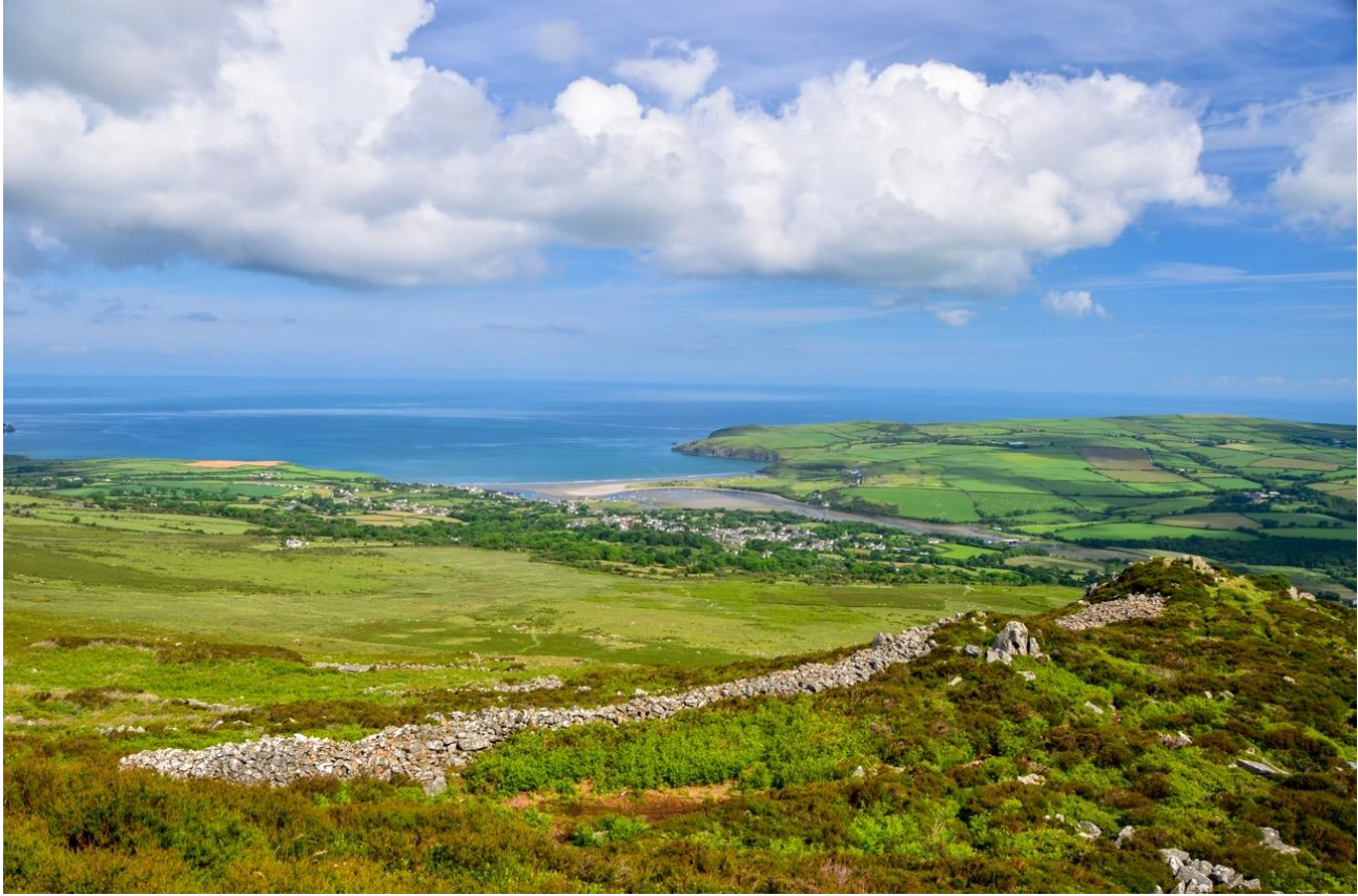
Elevated and looking to Newport with Cardigan Bay beyond. Seen from Mynydd Carningli