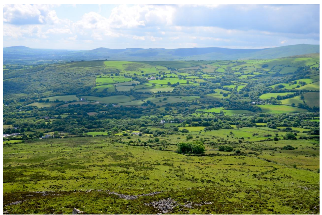
Northern slopes of Preseli Hills showing the detailed patchwork of small fields, woodlands and heath. Seen from the summit of Mynydd Carningli