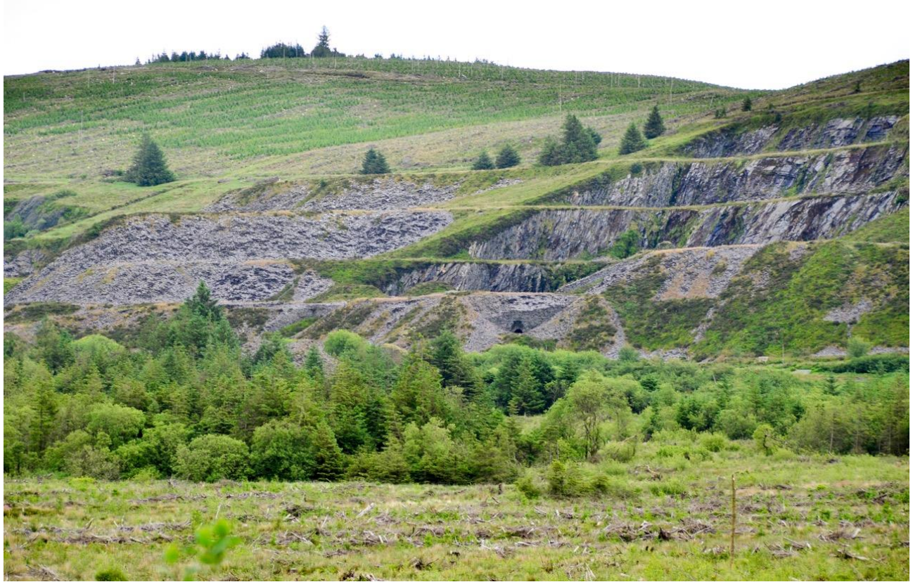
Rosebush - remains of old slate quarries and new coniferous plantation