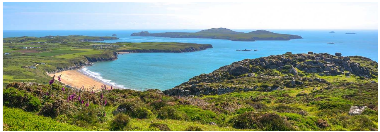
Whitesands Bay and Ramsey Island from Carn Llidi