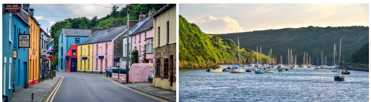
Solva, the village (illustrating the popular tradition of colour-rendering) and the natural harbour of Solva