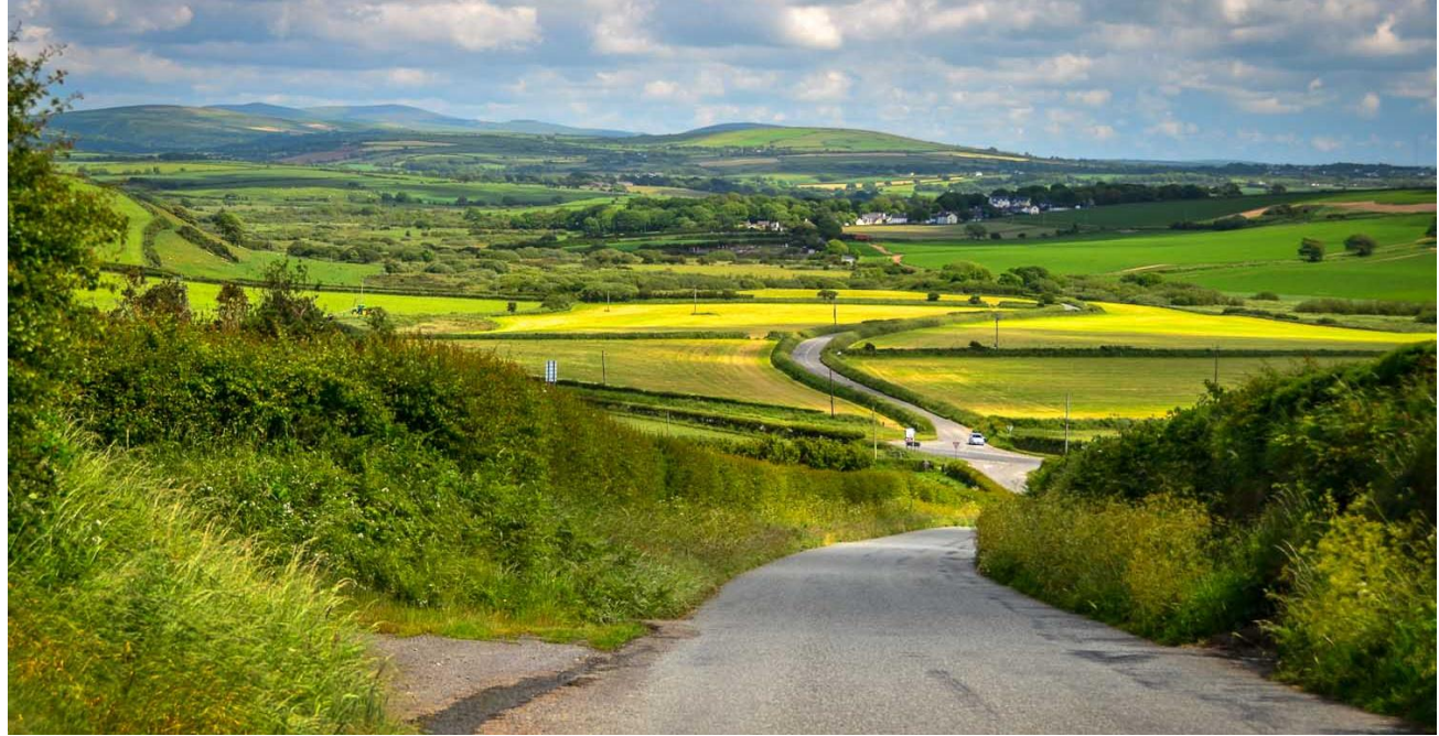
Gentle agricultural landscape near Mathry, with the rising Preseli Hills in the distance.