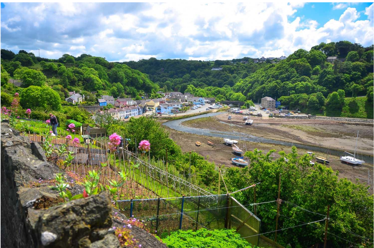
Fishguard harbour, set in the sheltered estuary of the River Gwaun. The main town lies up the hill to the right, and is the largest settlement in the area.