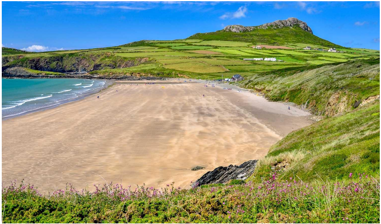
Whitesands Bay and Carn Llidi