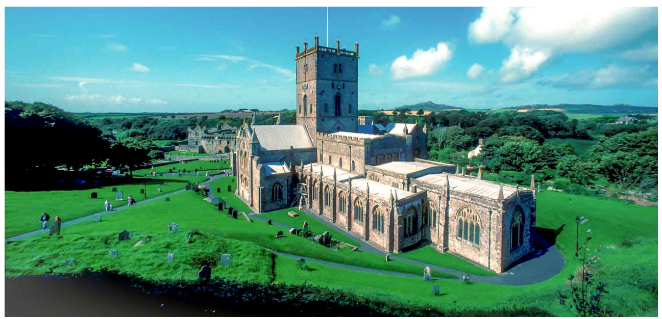
St David's cathederal © Richard Kelly

Skomer Island is nationally recognised as a landscape of outstanding historic interest, displaying extensive relict remains of Prehistoric settlement and farming. The survival of field boundaries, which lie in a regular square or rectangular pattern, are of particular interest – thought to delineate Neolithic divisions between arable and pastoral land. Other features relating to ancient settlement are found throughout the coastal landscape including Bronze Age round barrows and enclosed hut circles. Iron Age promontory and hill-forts overlook the sea.