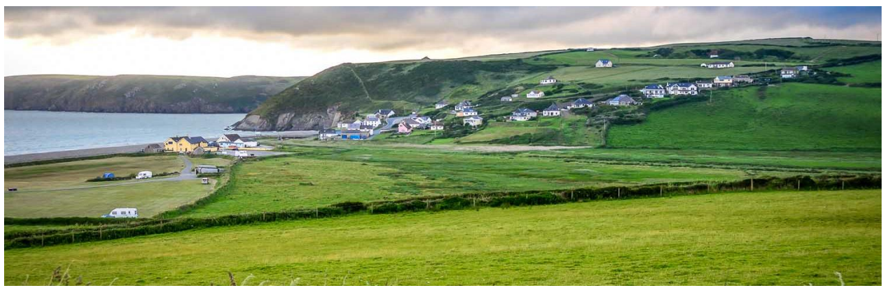
Newgale