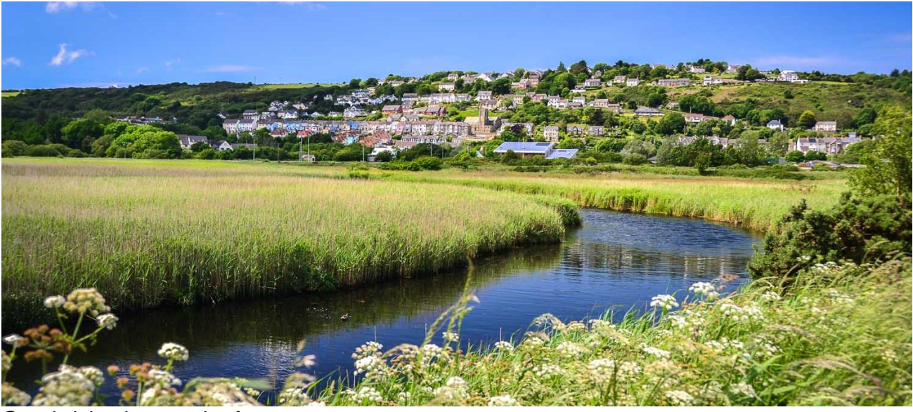
Goodwick, close to the ferry port.