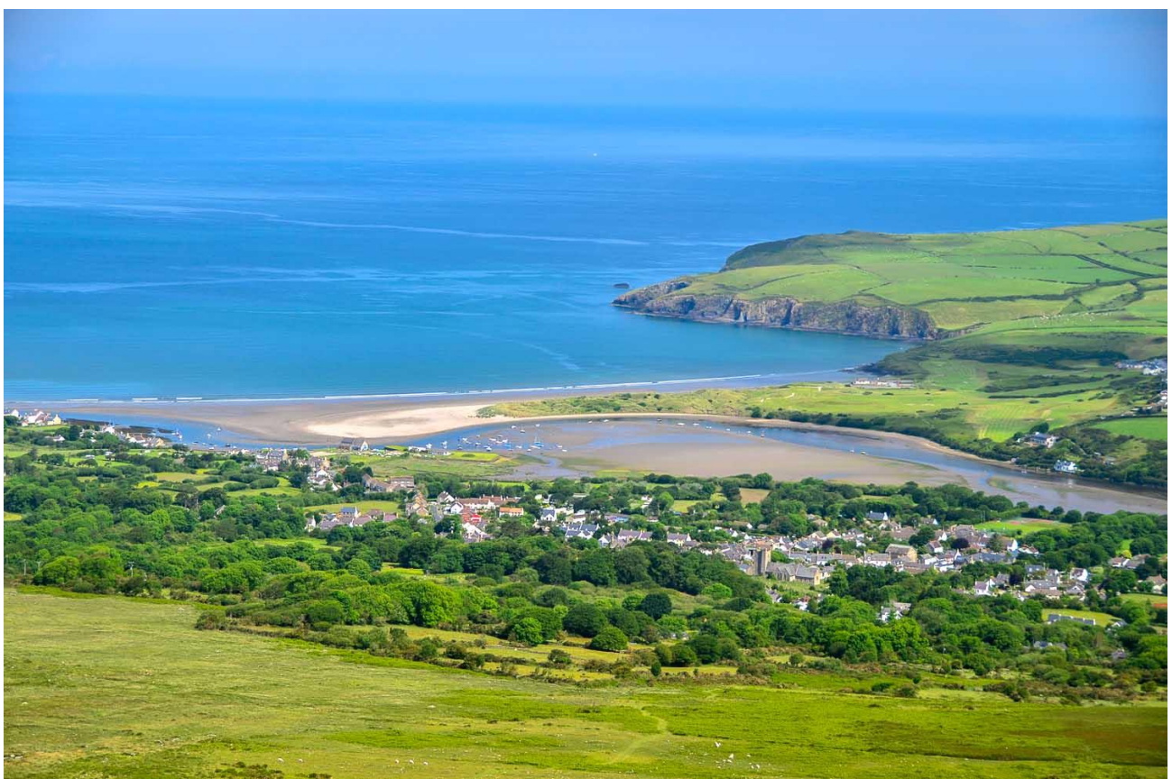
Newport, sandwiched between the sheltered estuary of the River Nevern and the rising Preseli Hills.