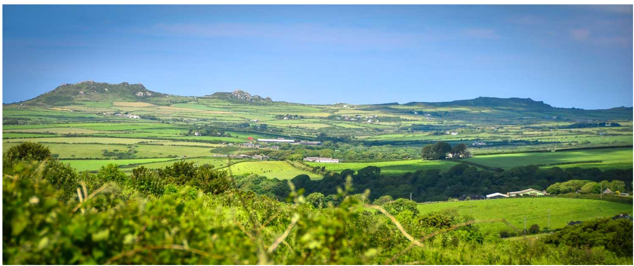
The ridges and tors of the coastal area near Strumble Head