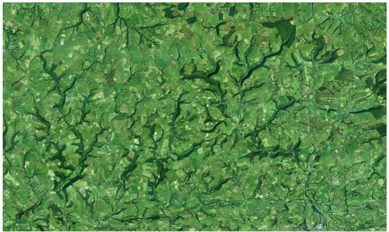
The distinctive pattern of many incised streams in narrow wooded valleys.