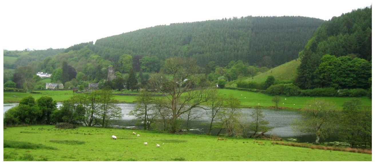
Woodland and pools near Talley.