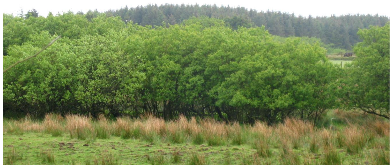
Rush Pasture and carr near Brynalwan OLUC