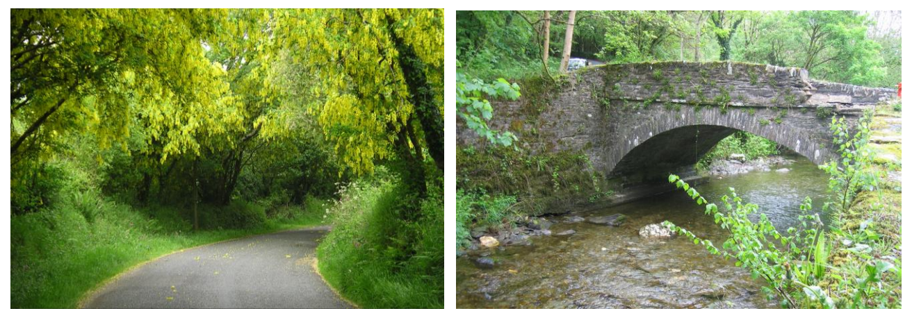
(Left) The unusual and distinctive abundance of laburnum in hedgerows. In early summer, this local peculiarity becomes apparent, when they burst into vivid yellow flower, and the lanes are adrift with fallen blossom. (Right) Stone bridge near Capel Iwan