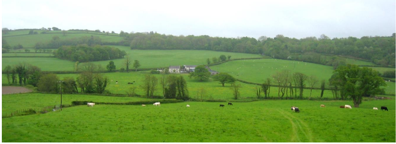
View east from near Talley

West of the Carmathen-Lampeter road, where the Cambrian Mountains have dropped away, this part of the area covers a wider stretch of land between the two major vales of the Teifi and the Taf. Here the water courses have cut deep into the plateau, flowing both north and south, giving a particularly distinctive pattern of ridges dropping gradually southward and northward from a central line of higher points. To both north and south, this area merges with the adjacent areas of the Teifi Valley and Pembrokeshire. When viewed from distant higher land, the plateau can be seen to gradually rise, with the Blaenwaun windfarm being the only obvious landmark. The deep steep winding wooded valleys are quiet and enclosed, with very limited views, full of detail. Small villages and farms are tucked into the lower slopes at bridging points, backed by dark woodland and bright meadows, forming picturesque groups of buildings, often loosing the sun early in the day. Others are perched on the rims of the valleys, clustered around ancient inconspicuous churches. Only the Gwili valley, with the winding Carmarthen-Newcastle Emlyn road and the preserved steam railway, has much noise and movement through it. Most of the roads run straight along the ridges, between sparse wind-bitten hedges, through a fairly uniform, wide-spreading landscape of regular fields of pasture and crops. Small lanes branch off to zigzag sharply down to cross the valleys.