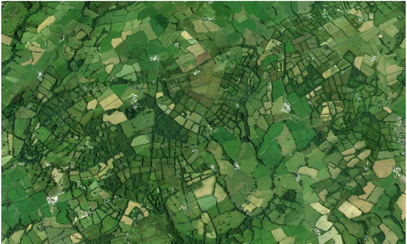
Mixed fieldscapes near Salem (north of Llandeilo) where clusters of small fields have thicker much hedgerows.