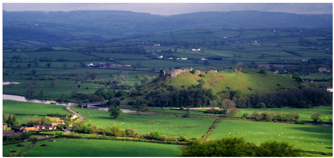
Dryslwyn Castle

Although it is under some pressure, particularly from in-migration, the Welsh language is still strong throughout Carmarthenshire, including the Tywi Valley, in both urban and rural areas.