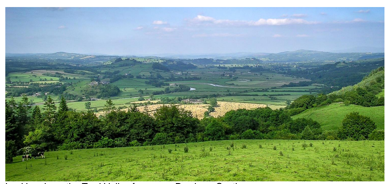
Looking down the Tywi Valley from near Dryslwyn Castle

Above Llandovery the main valley is similar but of a smaller scale, carrying the smaller Afon Bran, while the Tywi joins the main valley coming from its source in the high uplands of the Cambrian Mountains.