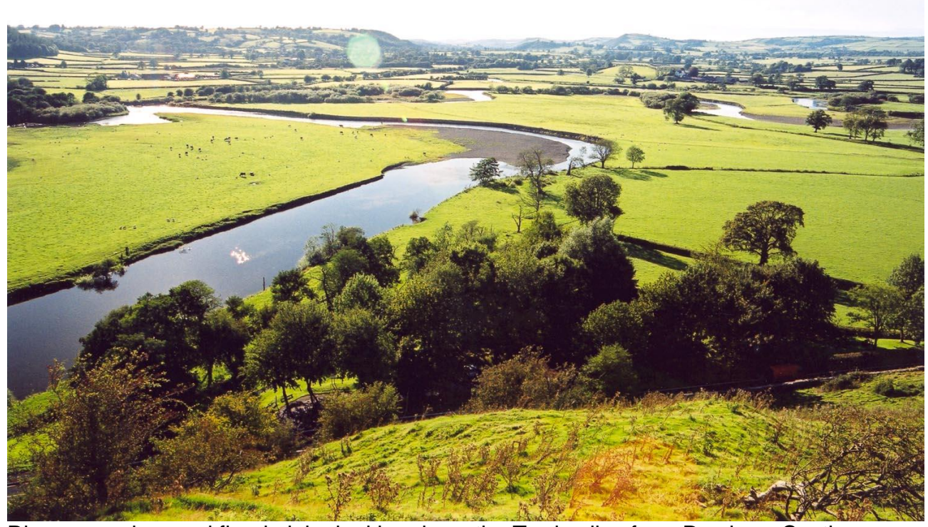
River meanders and flood plain, looking down the Tywi valley from Dryslwyn Castle