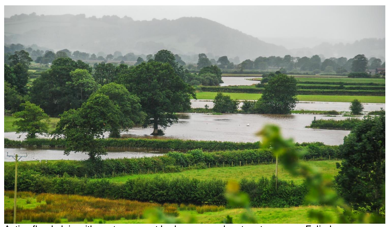
Active flood plain with pastures, neat hedgerows and mature trees near Felindre