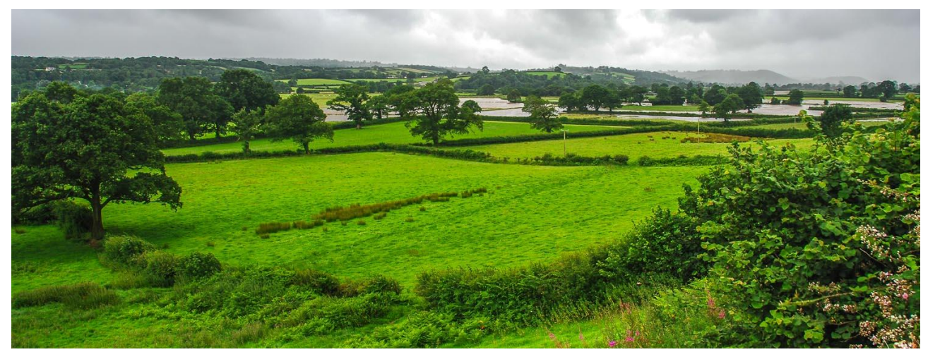
Flood plain (in partial flood) between Llanegwad and Felindre