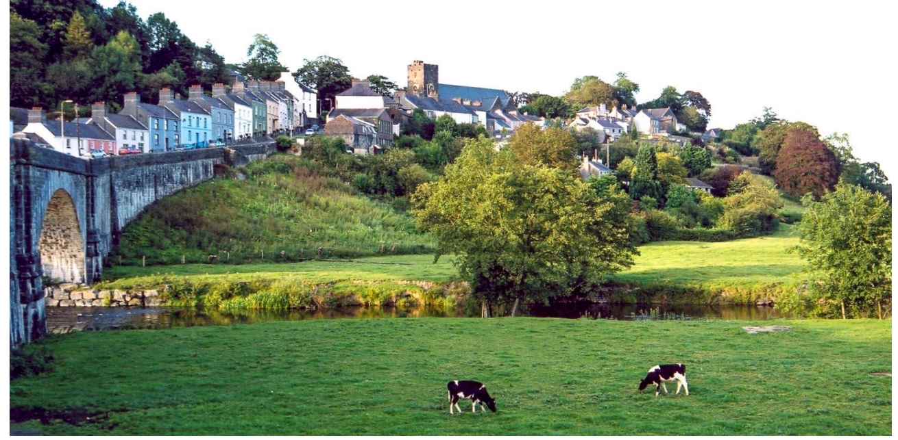
Llandeilo and bridge