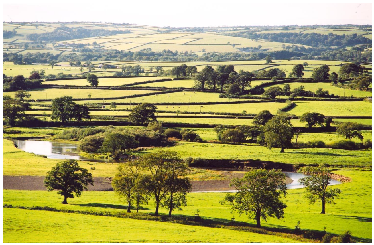
Field pattern looking down the Tywi valley from Dryslwyn Castle