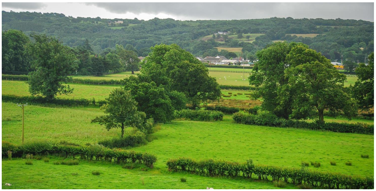
Wooded hillsides and open valley bottom near Llanarthney