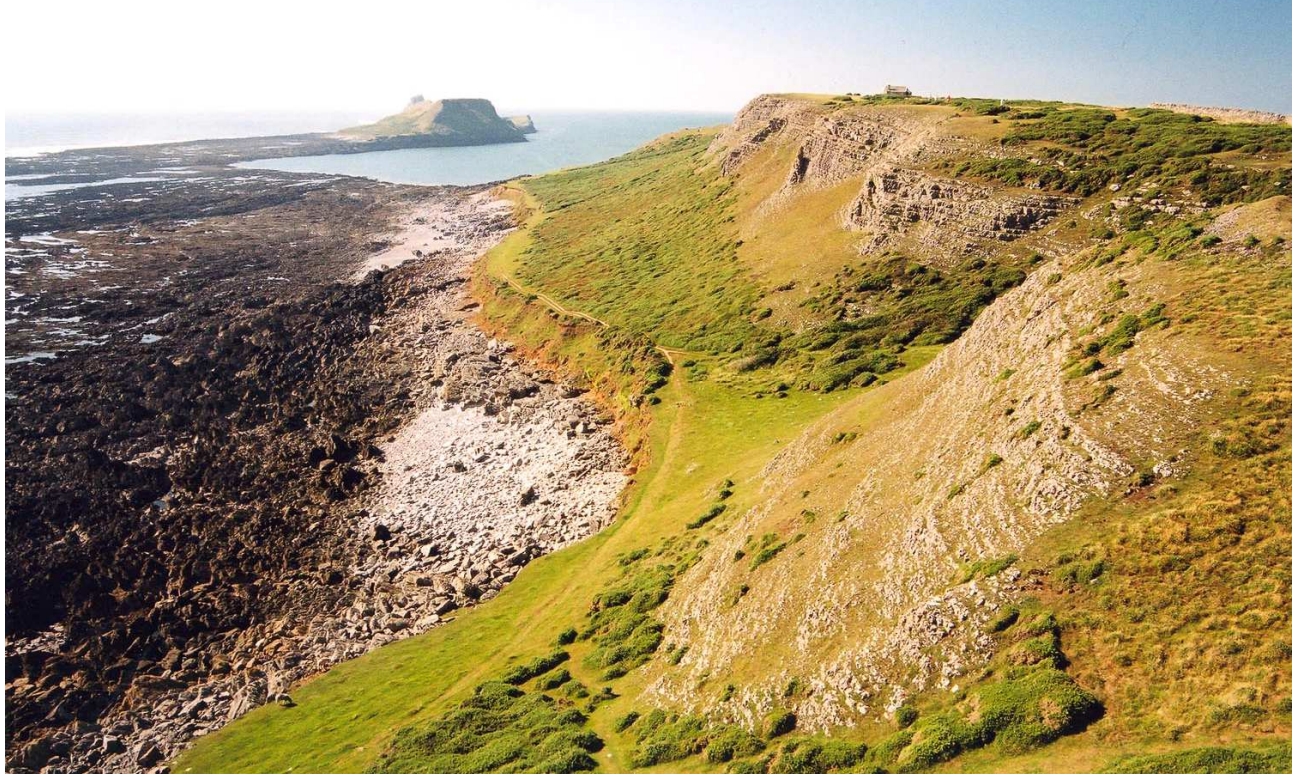
Worms head, limestone cliffs and raised beach.

This combination of exceptional scenic qualities led to the Gower becoming Britain's first AONB in 1956. In addition, its coastline is designated as a Heritage Coast. The sense of place is one of a relaxed society in an unspoilt and well-protected landscape. However its popularity with visitors can result in congestion along the roads and narrow lanes during peak season. On occasions this erodes the peaceful and remote qualities of the area, while the extensive static caravan and chalet parks at Llangennith, Wern-halog, Kennexstone, Llanddewi, Horton and Port Eynon and Caswell Bay, and the numerous summer camping sites, add visible distractions that increase awareness of busyness. Swansea Airport, the main A 4118, Sketty to Port Eynon road and golf courses at Fairwoood, Langland, Clyne and Pennard, are further modern features impinging on the area's otherwise historic ambience, while night-time light pollution from Swansea affects the eastern edge of the area.