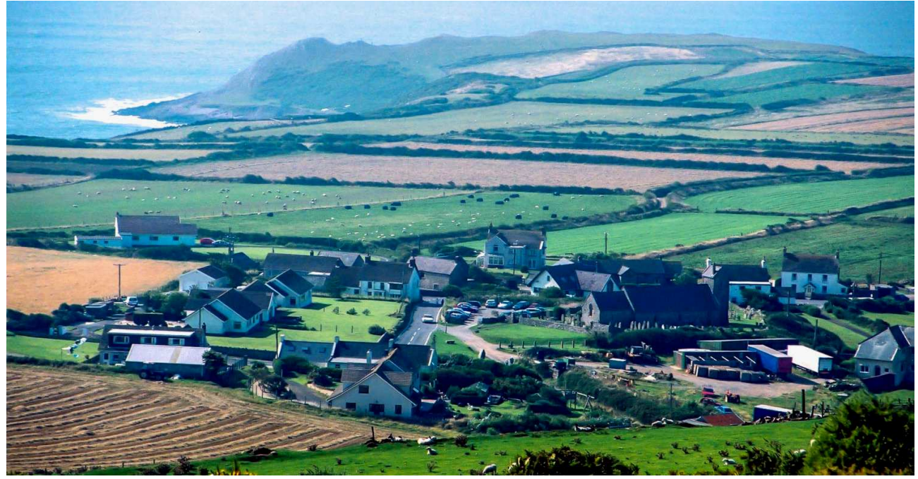
Rhossili, centred around the old church