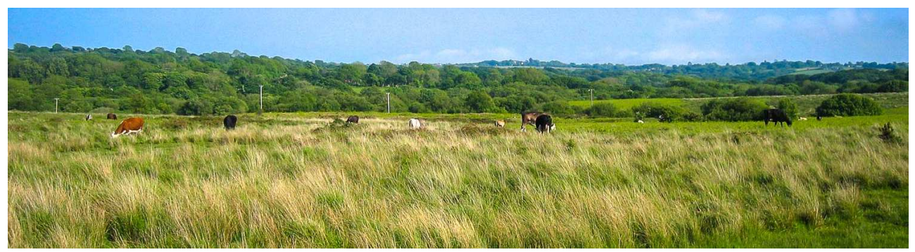
Cattle grazing, Fairwood Common