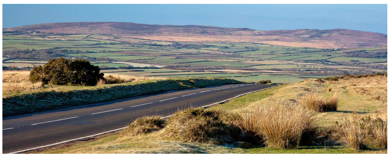
Sweeping open fields between Cefn Bryn (Reynoldston) and Rhossili Down open hills