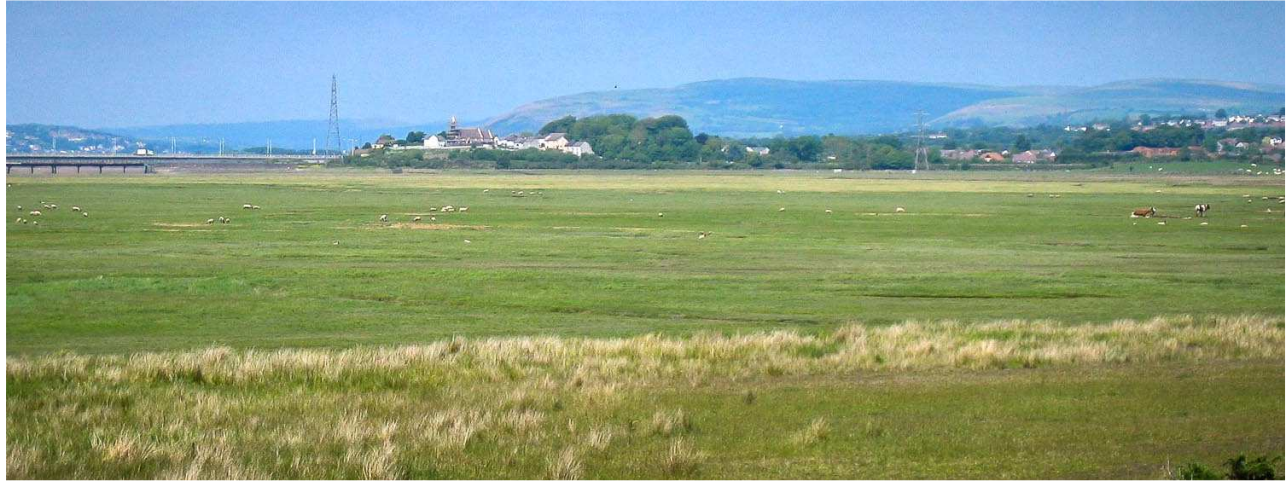
Salt marsh near Pen-clawdd