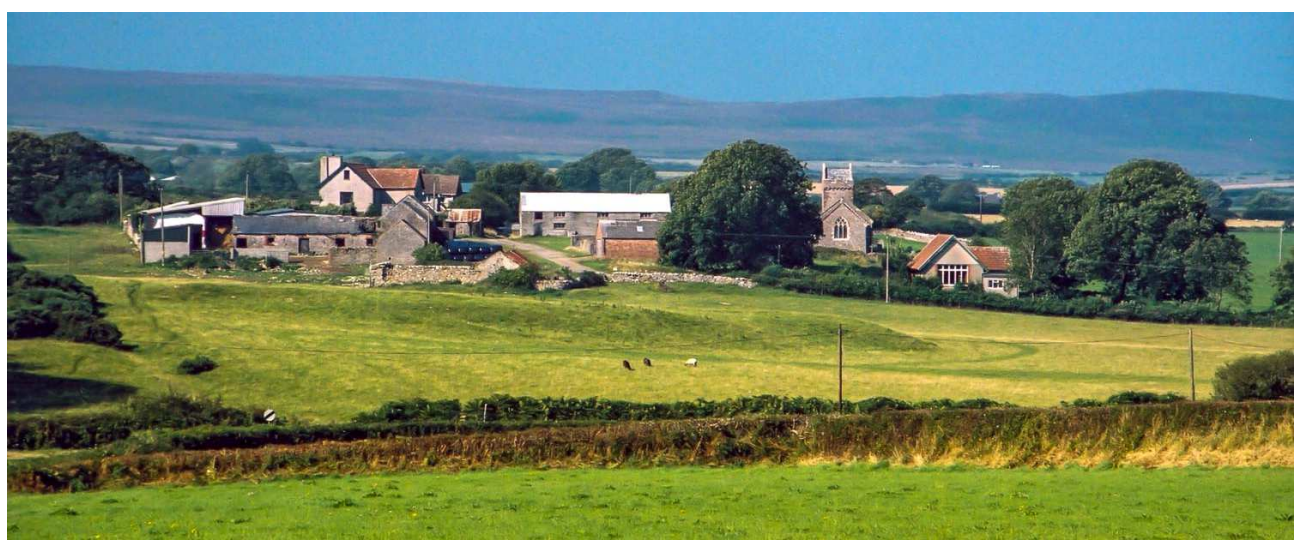
Llanddewi with Rhossili Down in the background.