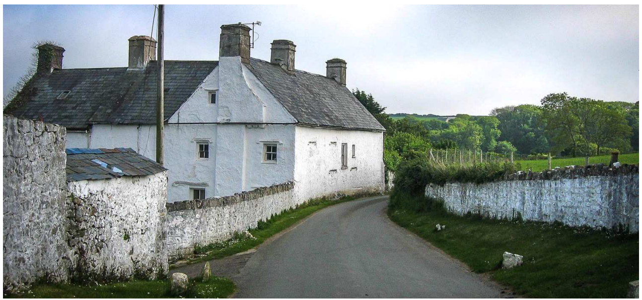
White-washed cottage near Penrice

Industry, apart from agriculture, has also declined. Limestone quarrying ceased in the C19th, while coal mining lingered on into the early part of the 20th century. However, the abiding traditional cultural image associated with north Gower is the still-active cockle gathering off Penclawdd in the Burry (Loughor) estuary.