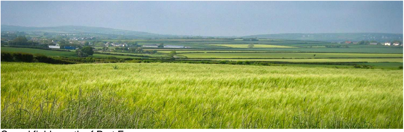
Cereal fields north of Port Eynon