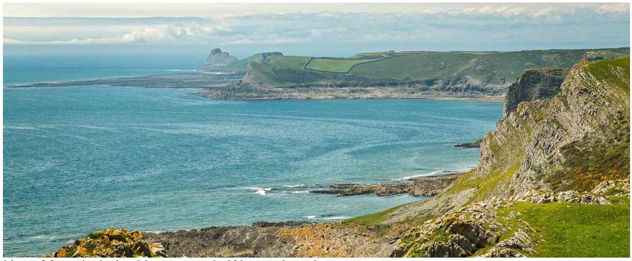
Near Mewslade looking towards Worms head.