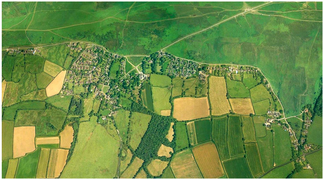
Reynoldston, showing the close relationship of the village to Cefn Bryn 'down'.