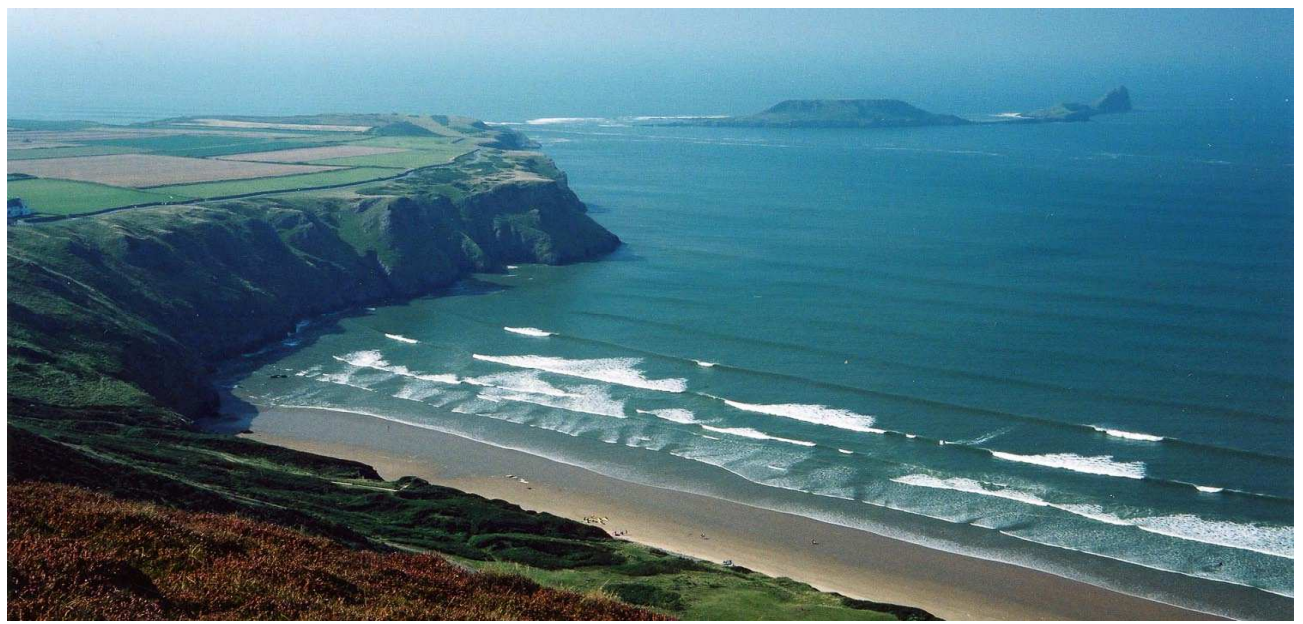
Rhossili Bay from Rhossili Down