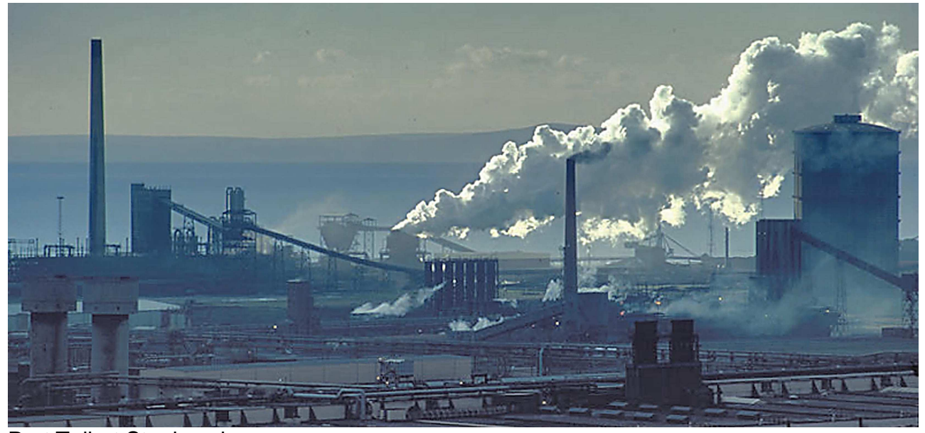
Port Talbot Steel works