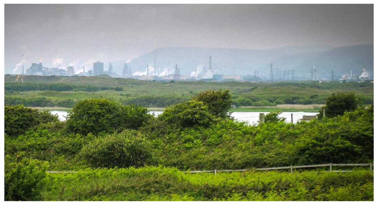
Extensive heavy industry in the Port Talbot area, with contrasting extensive dunes, ponds and heath at Kenfig Burrows.