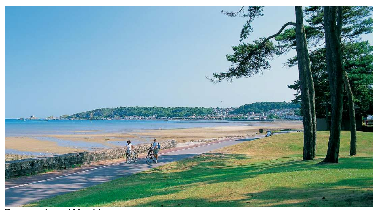
Promenade and Mumbles.