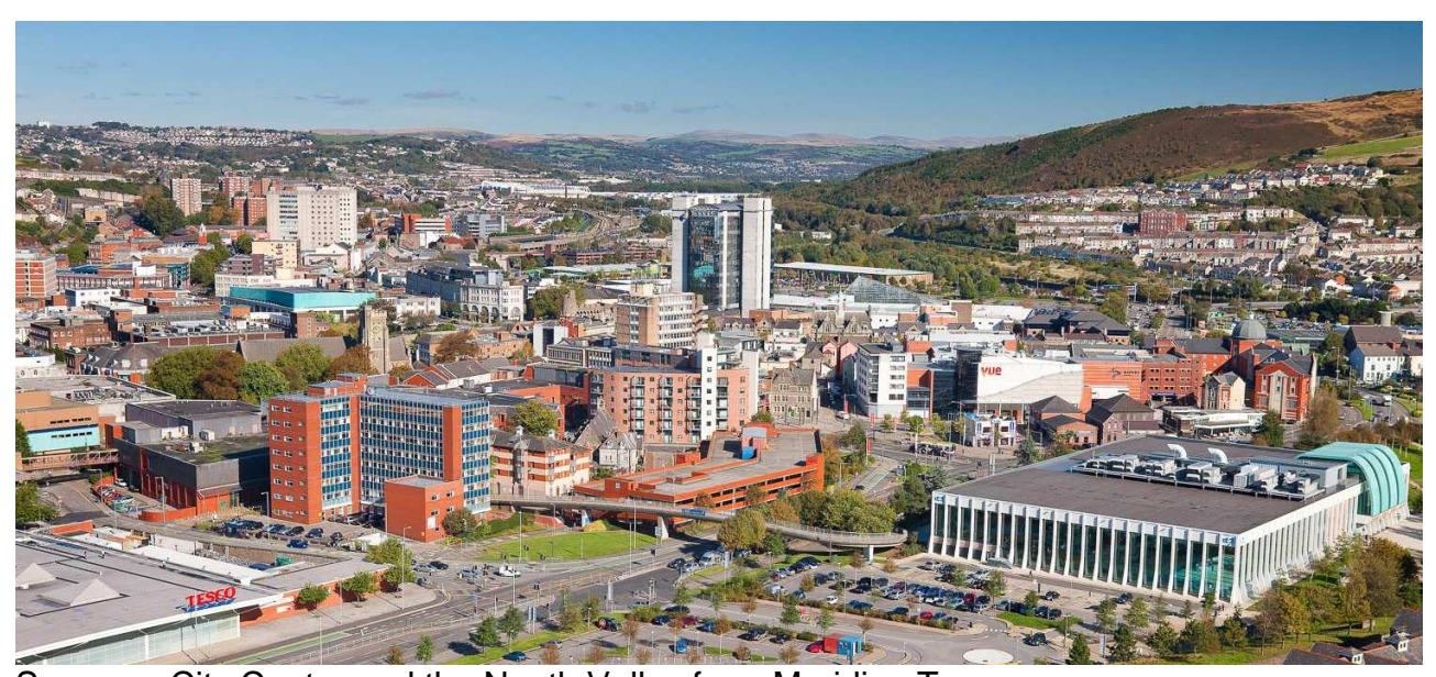
Swansea City Centre and the Neath Valley from Meridian Tower