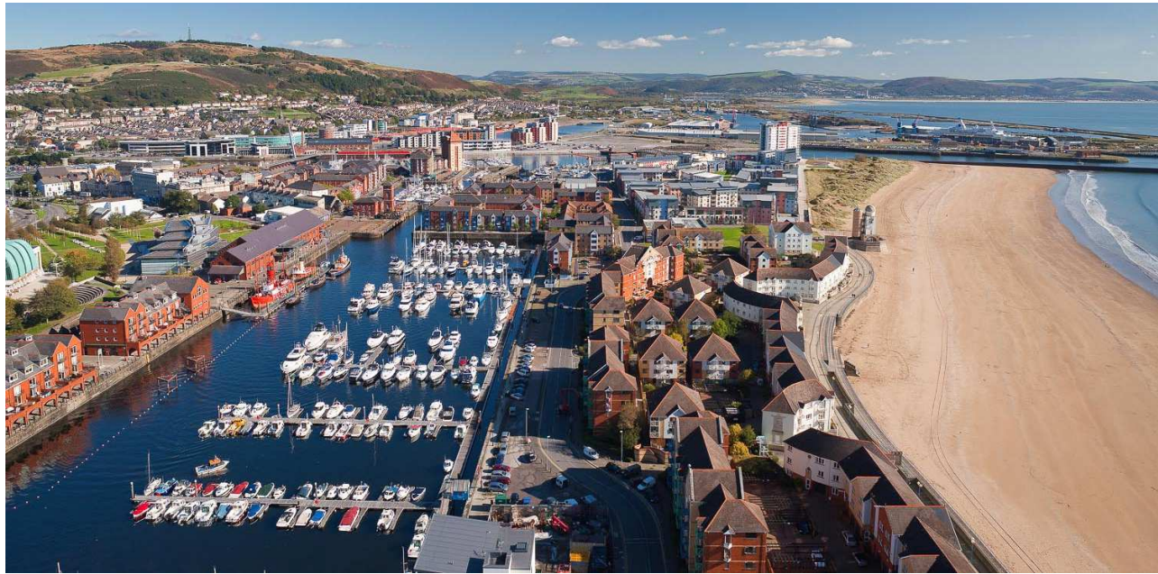
Regenerated Swansea Docks, from Meridian Quay Tower in the Maritime Quarter.

Swansea retains an important architectural interest with the University campus, Italianate Civic Centre and commercial core which exhibits the classical civic form associated with the post-war rebuilding. Many large modern developments rely on attracting visitors, so great emphasis has been placed on their appearance together with the regeneration of their surroundings. The extensive promenade at Swansea forms a recreational focus, with the eye of many attracted towards the Mumbles headland and its pier, from which a wide panorama can be gained, looking back across the entire bay.