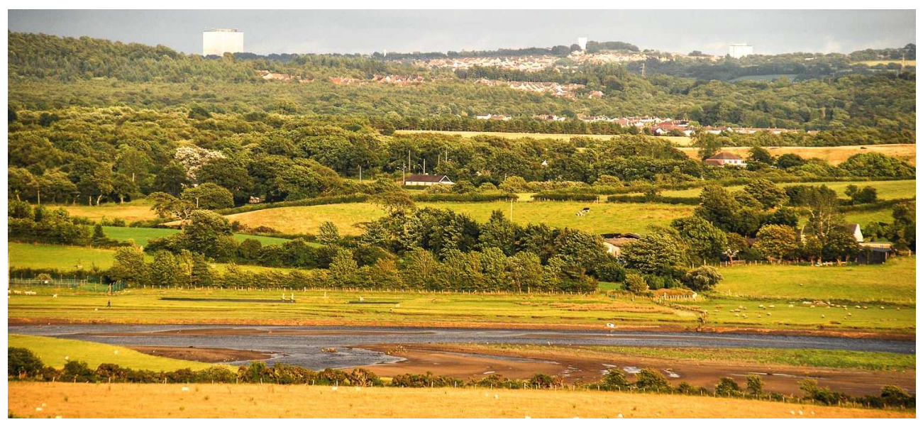
From Llangennech (Llanelli) overlooking the River Loughor towards Swansea