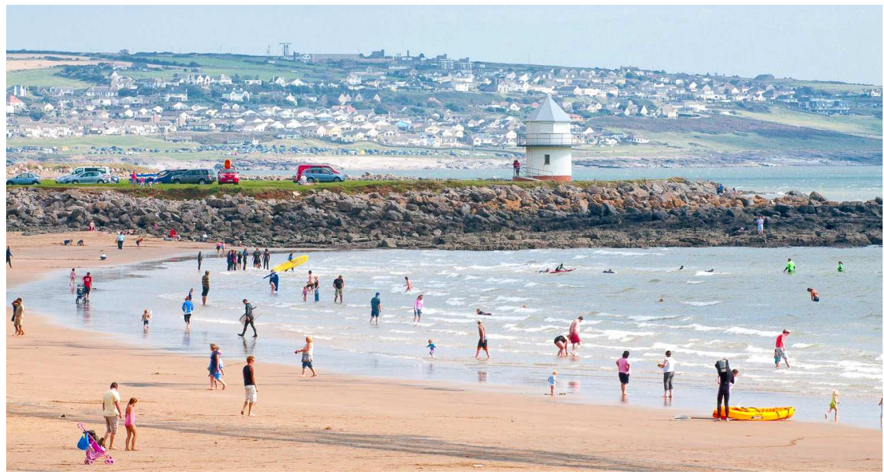
Porthcawl beach