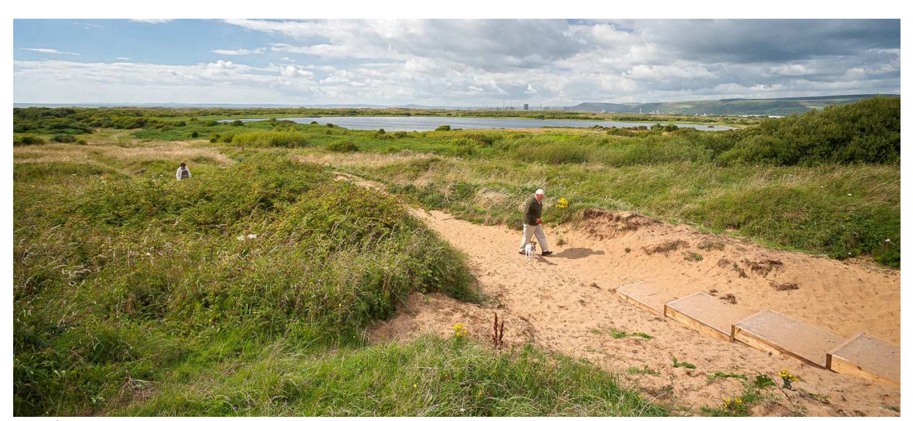
Kenfig Pool and dunes