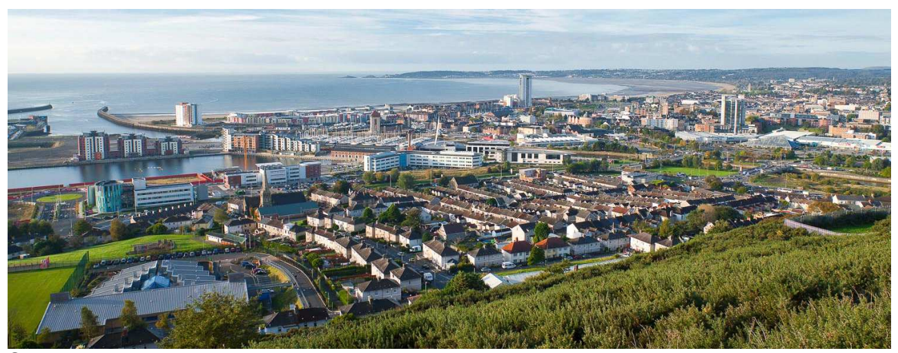
Swansea city, docks and bay, with the distant Mumbles headland.