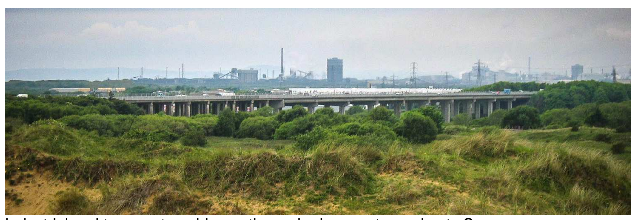
Industrial and transport corridor on the peri-urban eastern edge to Swansea. @LUC