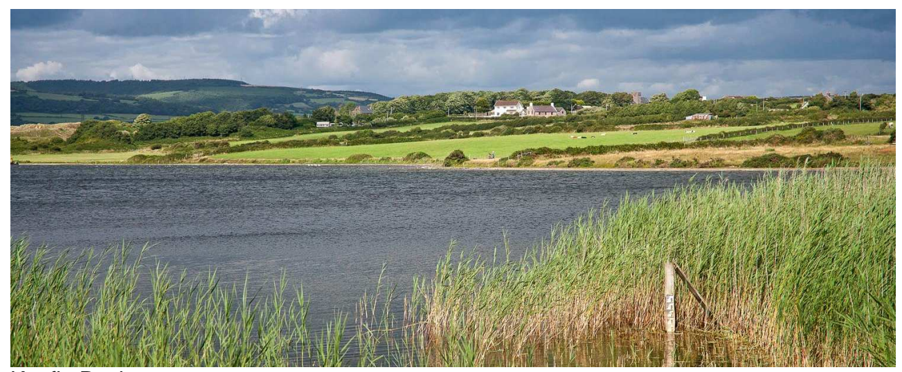
Kenfig Pool