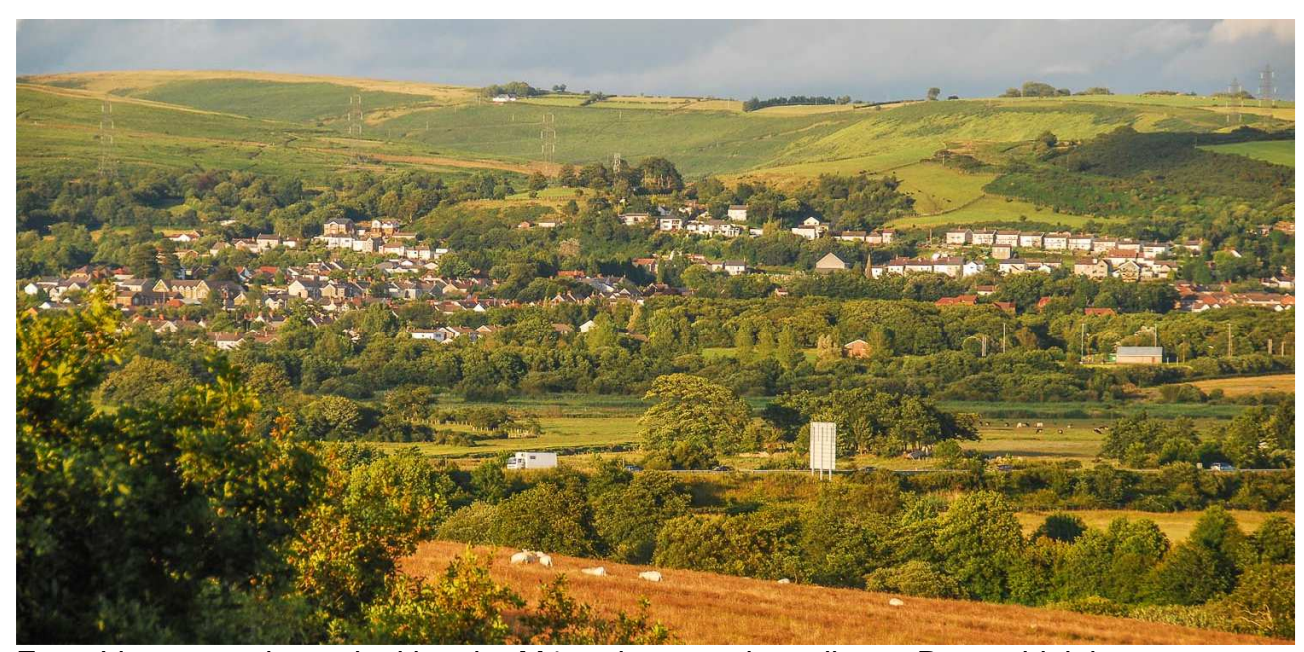
From Llangennech overlooking the M4 and across the valley to Pontarddulais