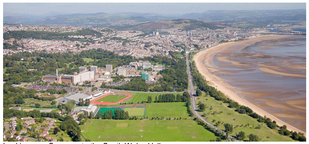
Looking over Swansea to the South Wales Valleys