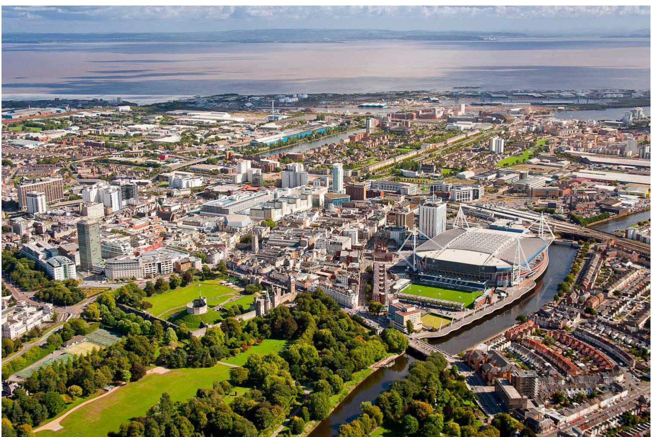
Cardiff, Wales's largest city and principle administrative centre for Wales, showing the city centre areas, the castle and it's parklands, the River Taff, Millennium Stadium and Severn Estuary in the background.

The open rural land between the urban areas is under pressure but is surprisingly tranquil in parts away from the transport corridors. It provides a welcome relief from the bustle of a dynamic part of Wales.