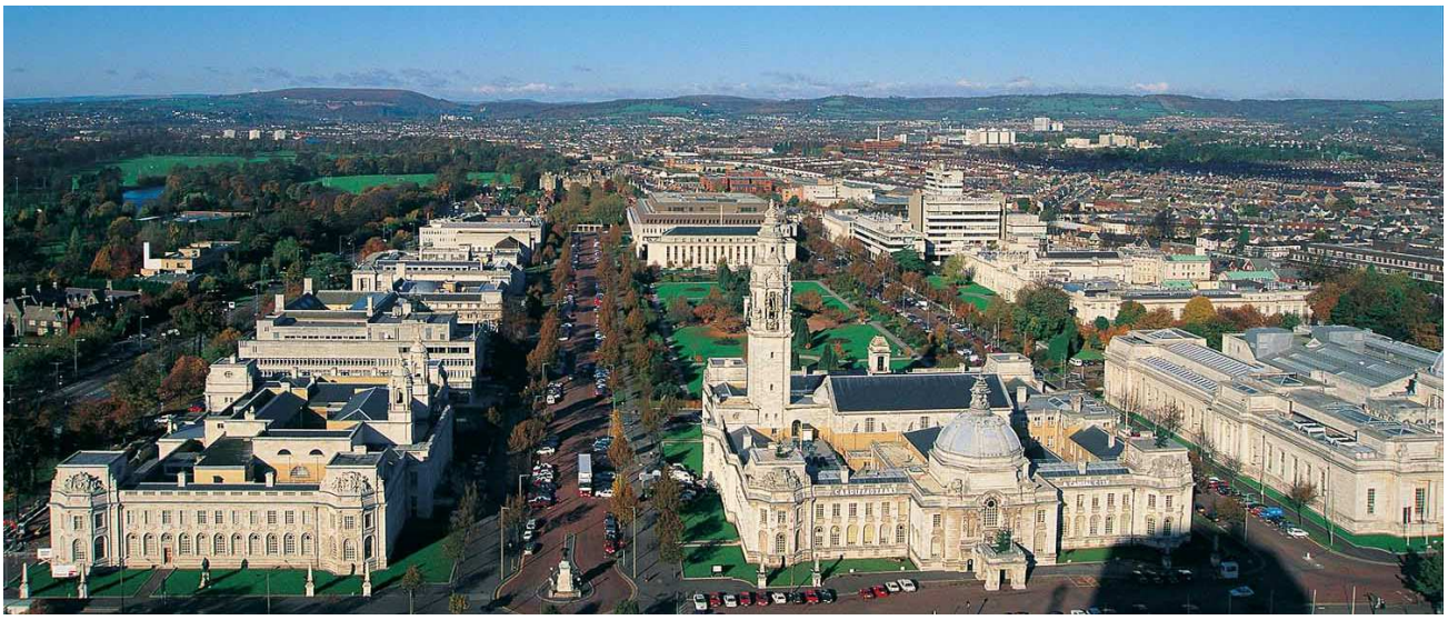
Cardiff – the old civic quarter, with wide planned layouts well-dressed stone buildings. A wider suburban area extends beyond.