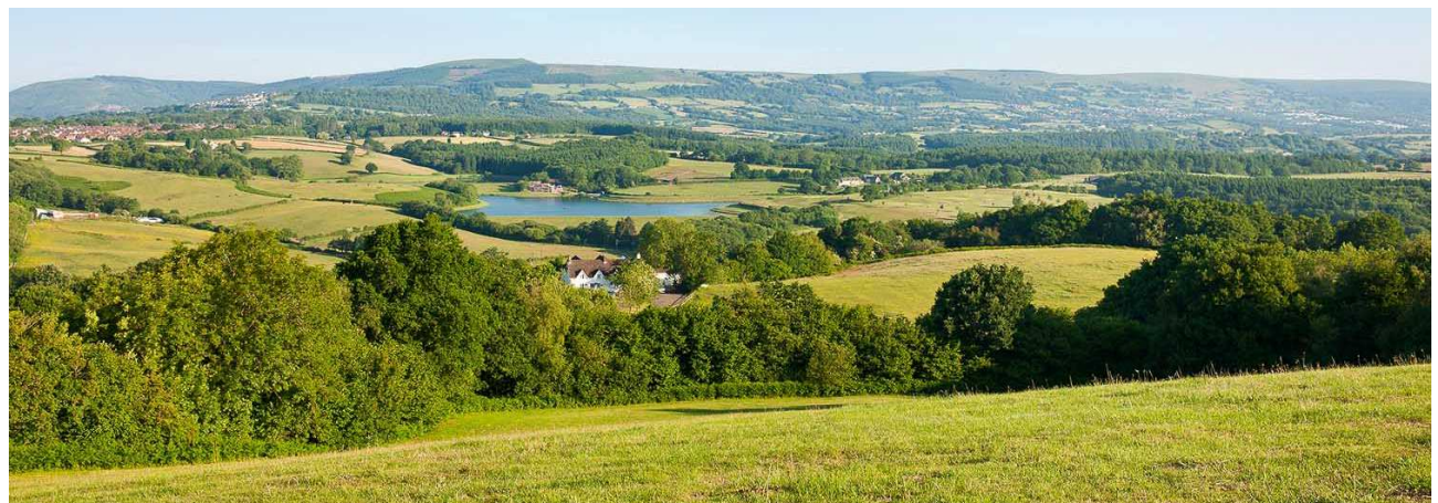
'Little Switzerland' from the Ridgeway view point. This appealing countryside forms the setting to Newport, with the rising uplands of the South Wales Valleys character area in the distance to the north-west, showing the hill of Twmbarlwm.