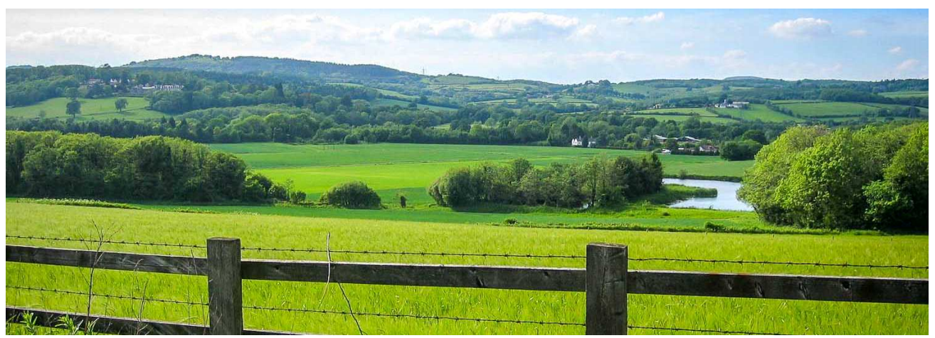
The rural landscape between Cardiff and Newport at Lower Machen, showing the Rhymney River.