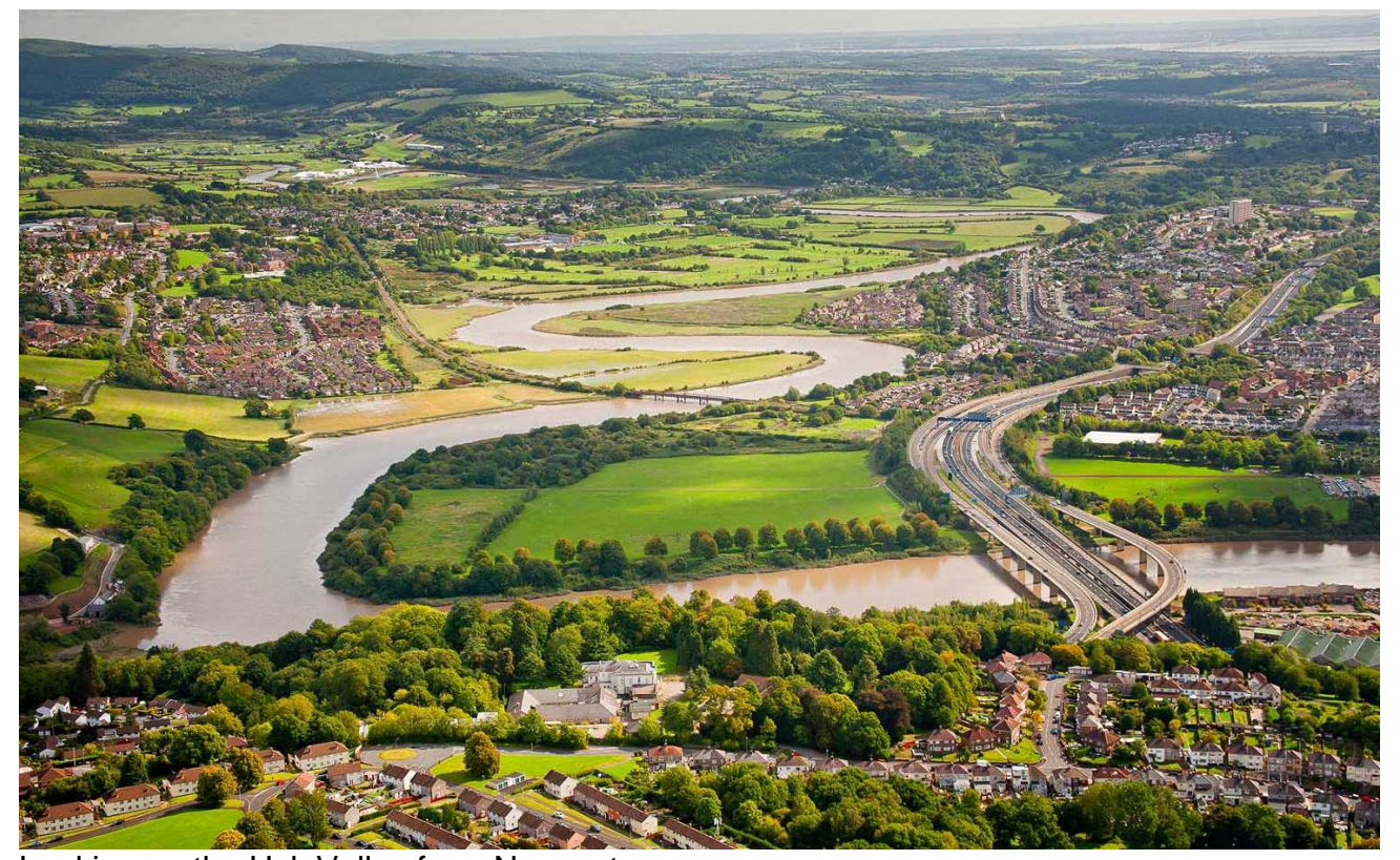
Looking up the Usk Valley from Newport.