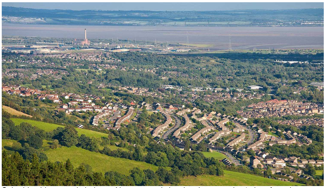
Suburbia, this example being at Newport, and showing the extensive 'urban forest'.