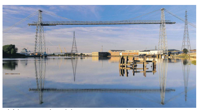
Built landmarks - Cardiff's formar docklands and Newport's old transporter bridge.