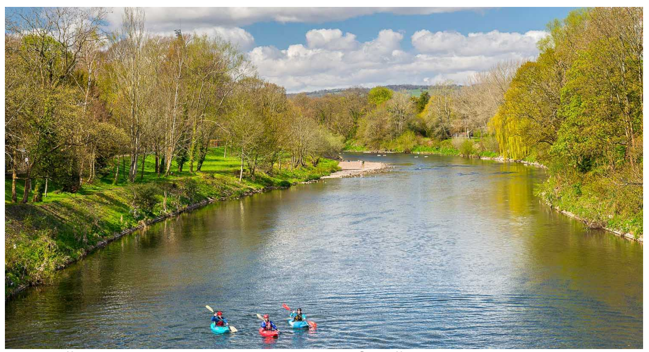
River Taff, a green, river corridor, running through Cardiff.