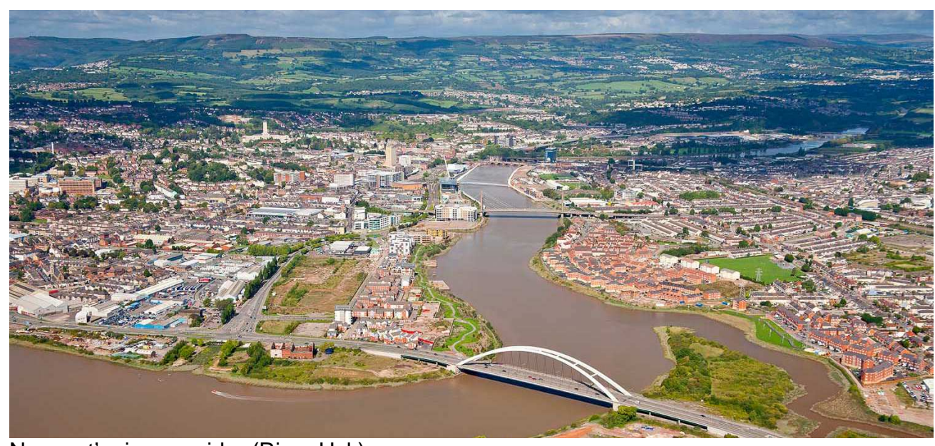
Newport's river corridor (River Usk)