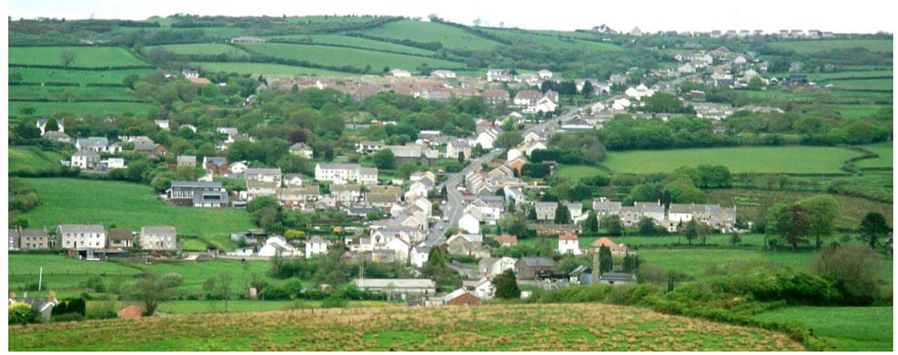
Pontyrates linear settlement amidst a lowland rolling landscape