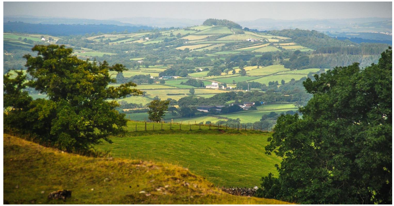
Fieldscapes between the Black Mountain (viewing point) and the Tywi Valley (distance)