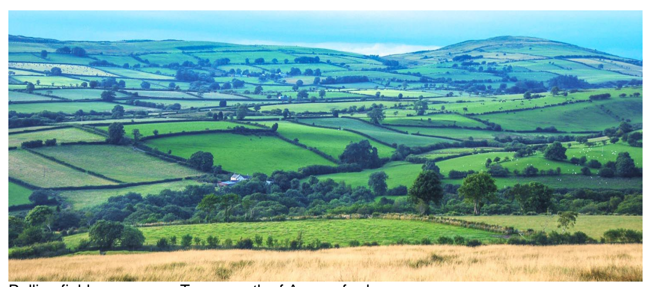
Rolling fieldscapes near Trapp, north of Ammanford