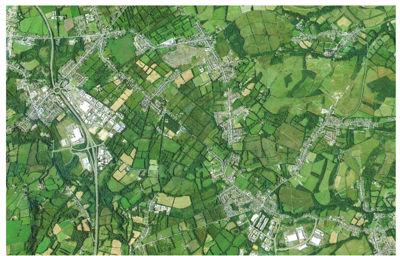
Cross Hands (left, with A48 road) and Penygroes (top) showing patterns of ribbon settlement amidst small-scale fieldscapes with lush, thick hedgerows. Note also the newer, simpler, reclaimed opencast quarrying landscapes on the right hand side.