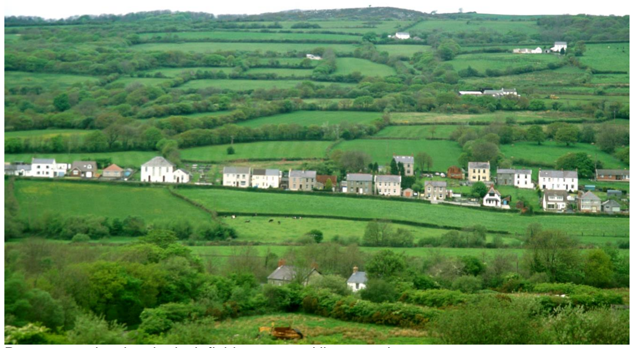
Pontyrates, showing the lush fieldscapes and linear settlement.