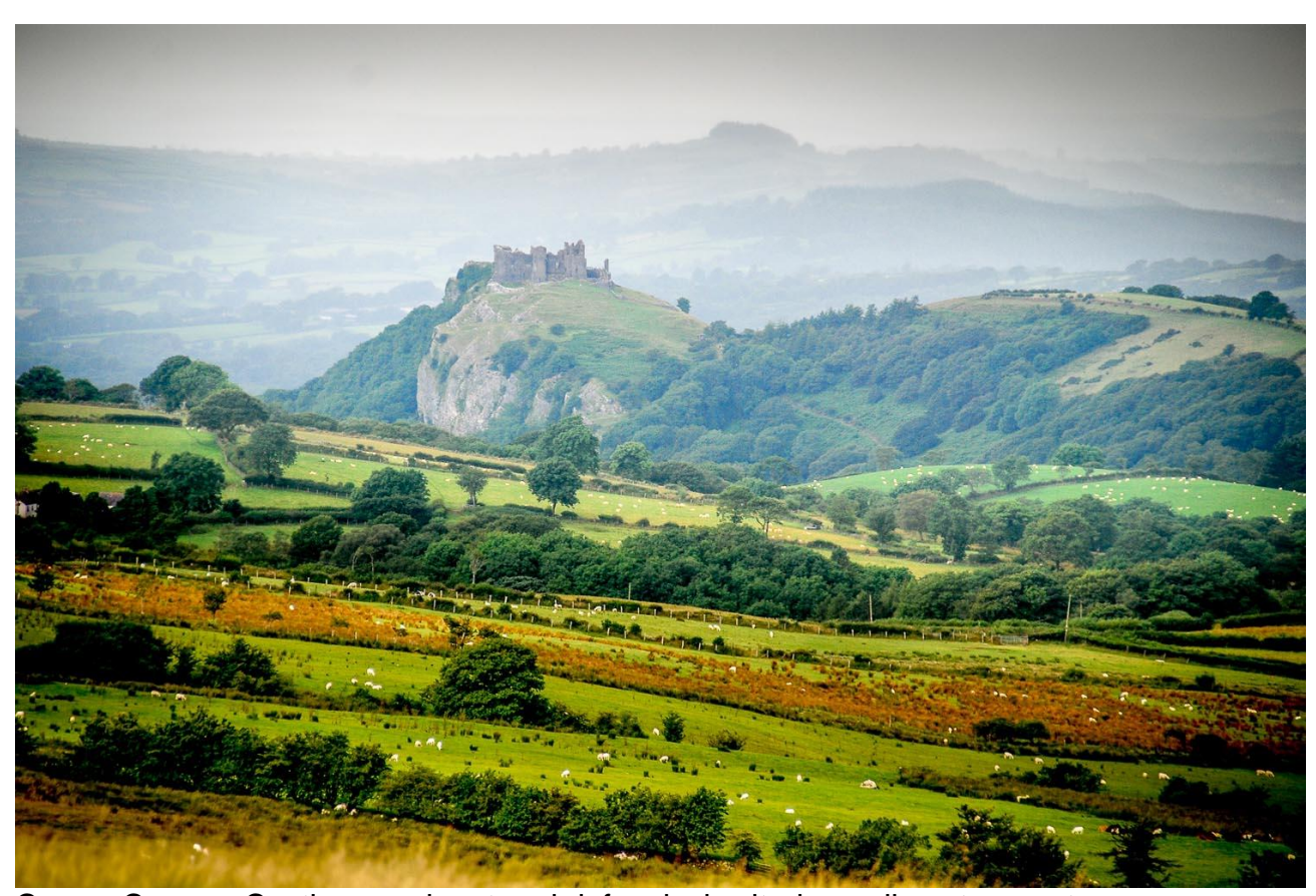
Carreg Cennen Castle, prominent and defensively sited on a limestone outcrop