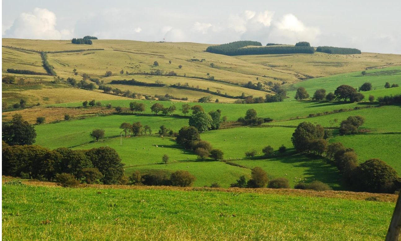
The Epynt plateau slopes gently down on the southern side. Here the division between upland open and lowland enclosed landscapes is subtle, although it is clear here to see the distinction being expressed by the limit of improved pasture. © John Briggs

The southern-most parts of Epynt form a gentle, enclosed, rural, agricultural landscape. Field enclosures extend up most if not all of the valley sides in these areas and the wilder, open areas on their tops or to the north are hard to appreciate from valley bottoms. This view is north of the small village of Upper Chapel © John Briggs