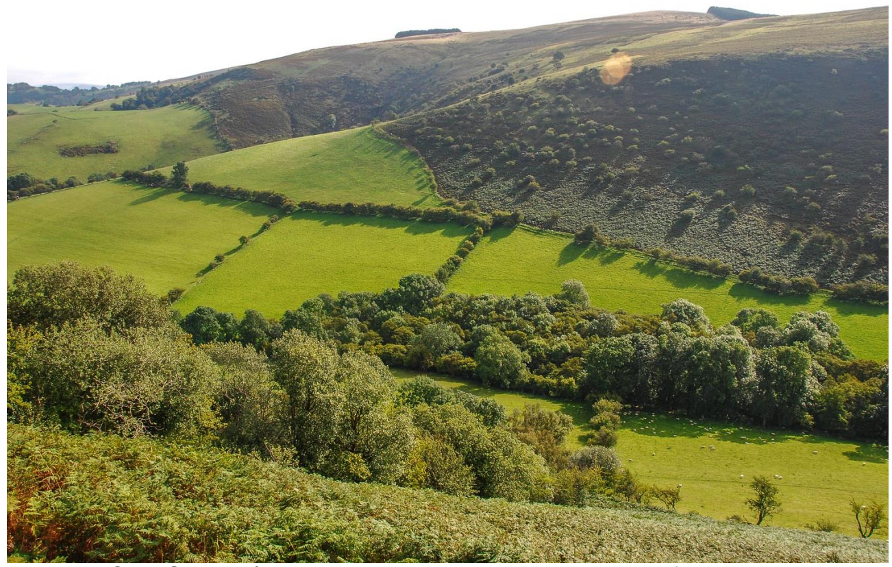
A detail in Cwm Graig-ddû showing the steep northern escarpment of Epynt and a clear division between improved, enclosed lowland pastures and open, unimproved upland moor and heath.