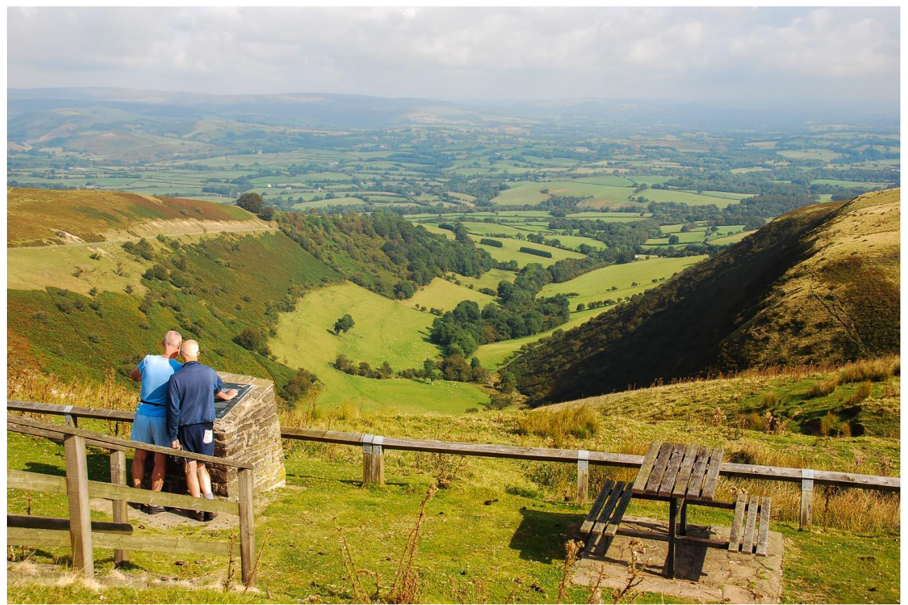
Viewpoint from the highest point on the B5419 road, looking north, down Cwm Graig-ddû. The Heart of Wales lowlands spreads across the middle distance, with the Cambrian Mountains rising to the left.