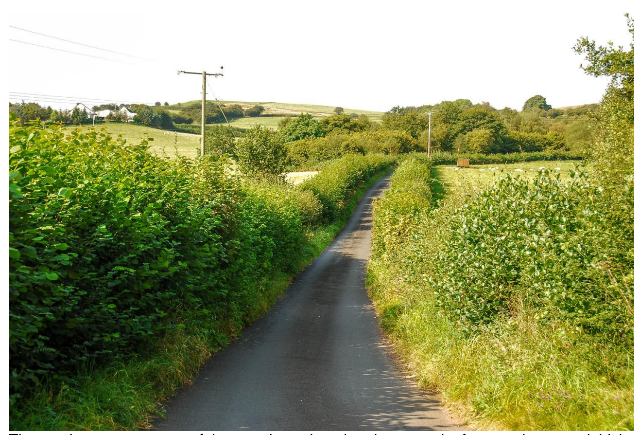
The southern-most extent of the area is enclosed and a network of narrow lanes and thick hedgerows enclose and shelter the pastoral landscape. This lane is near Upper Chapel. John Briggs

The area as a whole largely retains a strong sense of tranquillity and remoteness with its low population density and lack of artificial lighting retaining dark night skies throughout. The high summits afford extensive views across the area and beyond, and notably north from the highest land, across the adjacent lowland Heart of Wales landscape.