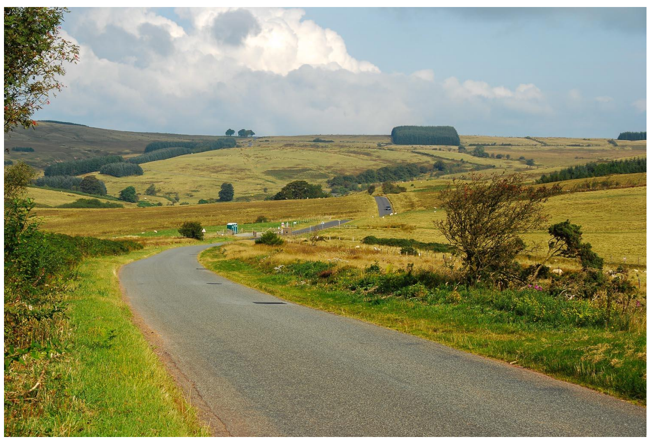
Many qualities of mid and east Wales upland areas are seen in Epynt, however military presence, limited public access, and some curiously shaped plantations distinguish Epynt.