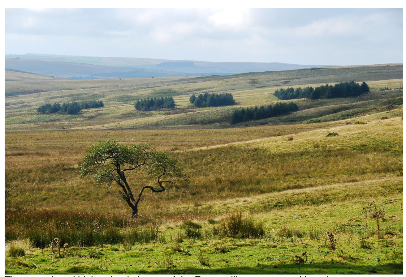
The unenclosed high upland plateau of the Epynt military ranges, with an incongruous group of small plantations, presumably for cover and shelter. There are many of these about the range.