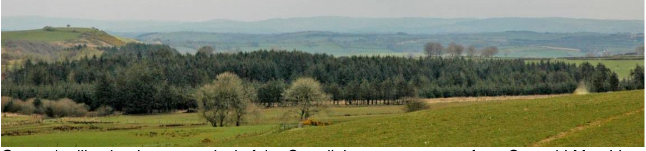
General rolling landscape, typical of the Ceredigion area, as seen from Castedd Moeddyn.

From Mynydd Bach there are extensive panoramic views, particularly from Mynydd Bach, whilst the large skies heighten awareness of the weather's ever-changing influence on landscape colour and character, between the sea to the west and the Cambrian Mountains to the east. There is a sense of tranquillity in these views, but conifer plantations, field patterns and modern settlement diminish a true sense of remoteness or 'wildness'.