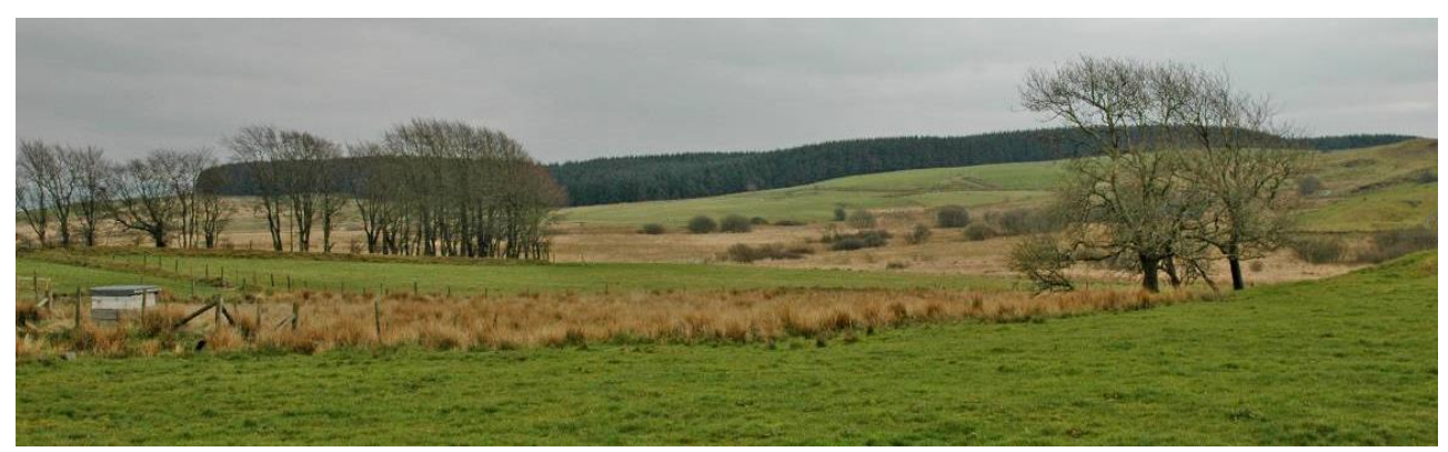
Typical improved pasture and hills oluc