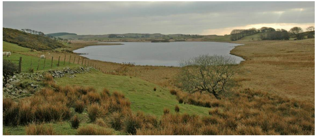
Llyn Eiddwen, a post-glacial lake at Mynydd Bach.