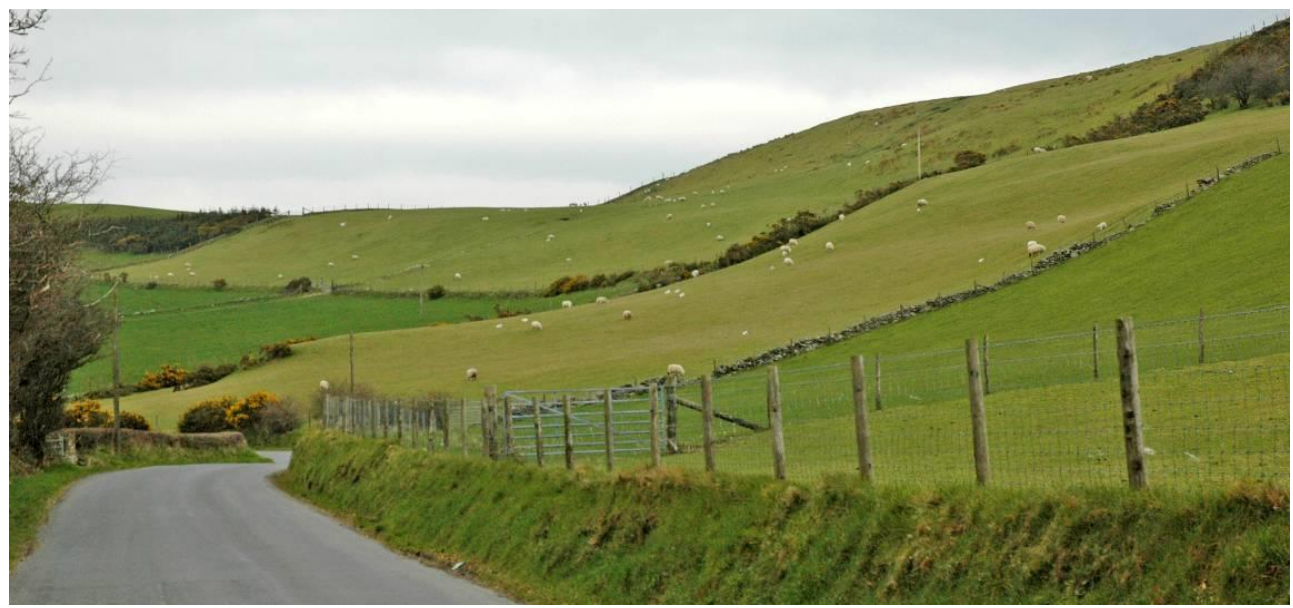
Typical open sheep grazing on the hummocky ridge of Mynydd Bach.