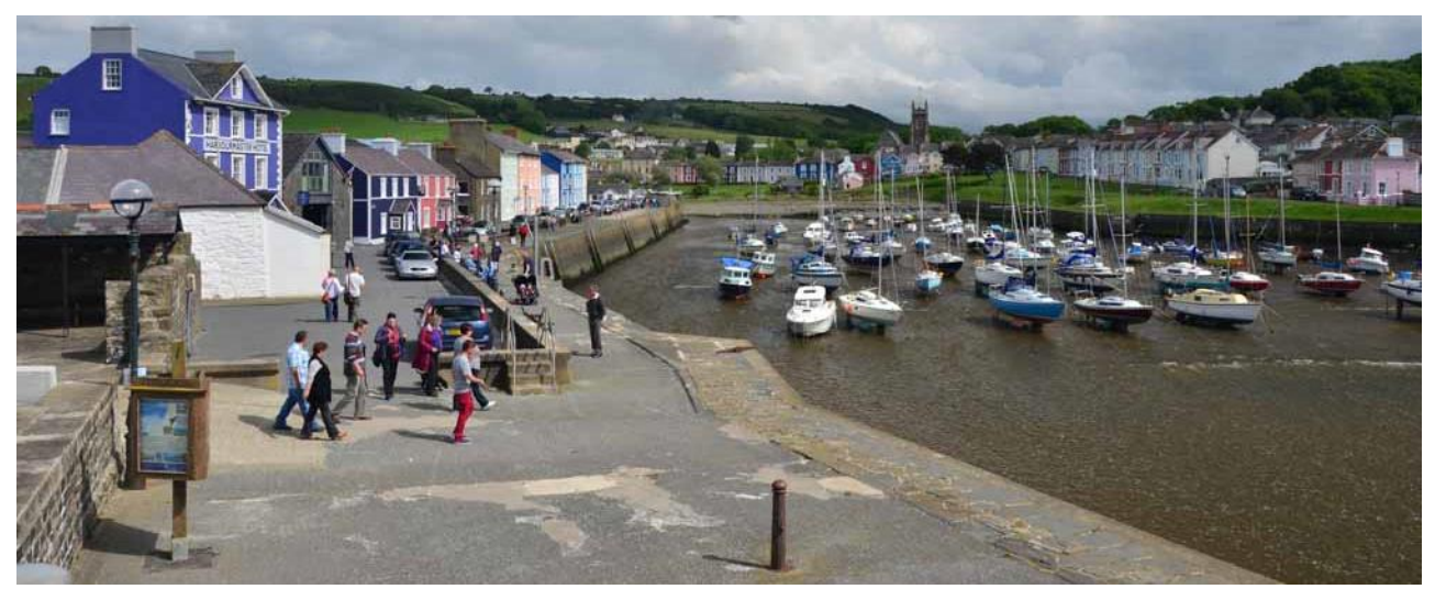
Aberaeron's colourful buildings and harbour are distinctive features.

Activity is concentrated at the former fishing villages, which are reached by tortuous routes down the coastal valleys. Newquay and Aberporth, and to a lesser extent Llangrannog, attract large numbers of visitors in summer, drawn into the area by the picture-postcard, tight-knit settlements overlooking their harbours, the sandy beaches and by the boat trips to view the well-known dolphins and seals of Cardigan Bay. The holiday caravan parks scattered along the cliffs and concentrated around Newquay, are often well contained in the wooded landscape. Their extent is most apparent from the sea where the formal lines of caravans can be seen aligned up the hillsides and along the clifftop rims, to take advantage of the sea views. Out of season these places return to a relative rural tranquillity, but with the frequent noise of the wind, sea and sea birds. The DERA base compromises this tranquillity with its prominent masts, large hangers, scattered buildings, security fences, aircraft movement and noise from weekday missile testing. The presence of this activity unsettles the senses, which is in contrast relaxed by the much calmer atmosphere of the popular village and beach of Aberporth close by.