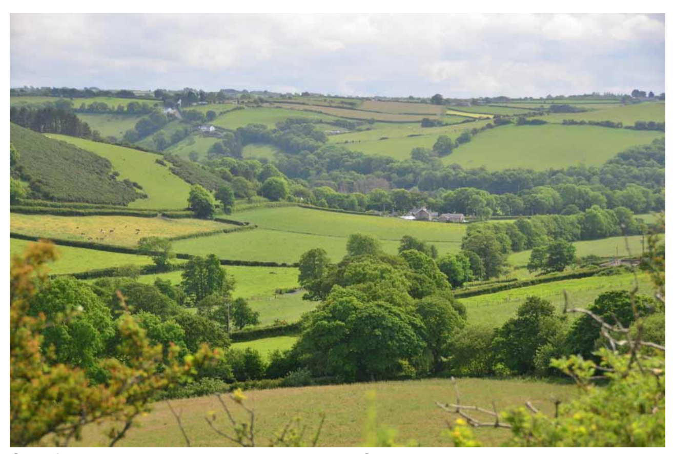
One of the small sheltered valleys, here seen at Cwm Mabus, near Llanrhystud.