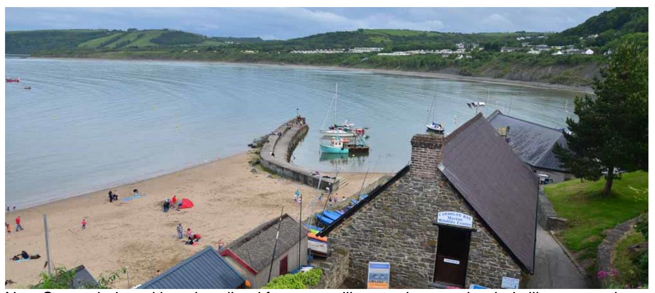
New Quay, sheltered by a headland from prevailing south westerly winds like many other coastal settlements in the area.