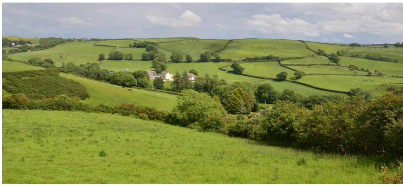
Gentle rolling farmland inland from the coast near Llanrhystud