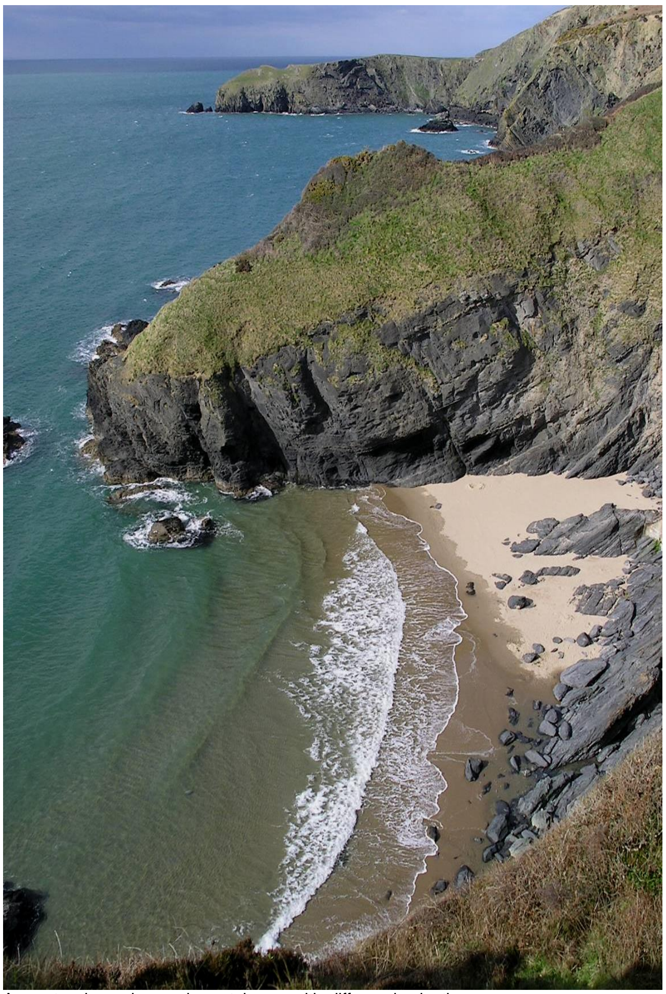
A spectacular and rugged coastal area, with cliffs predominating.