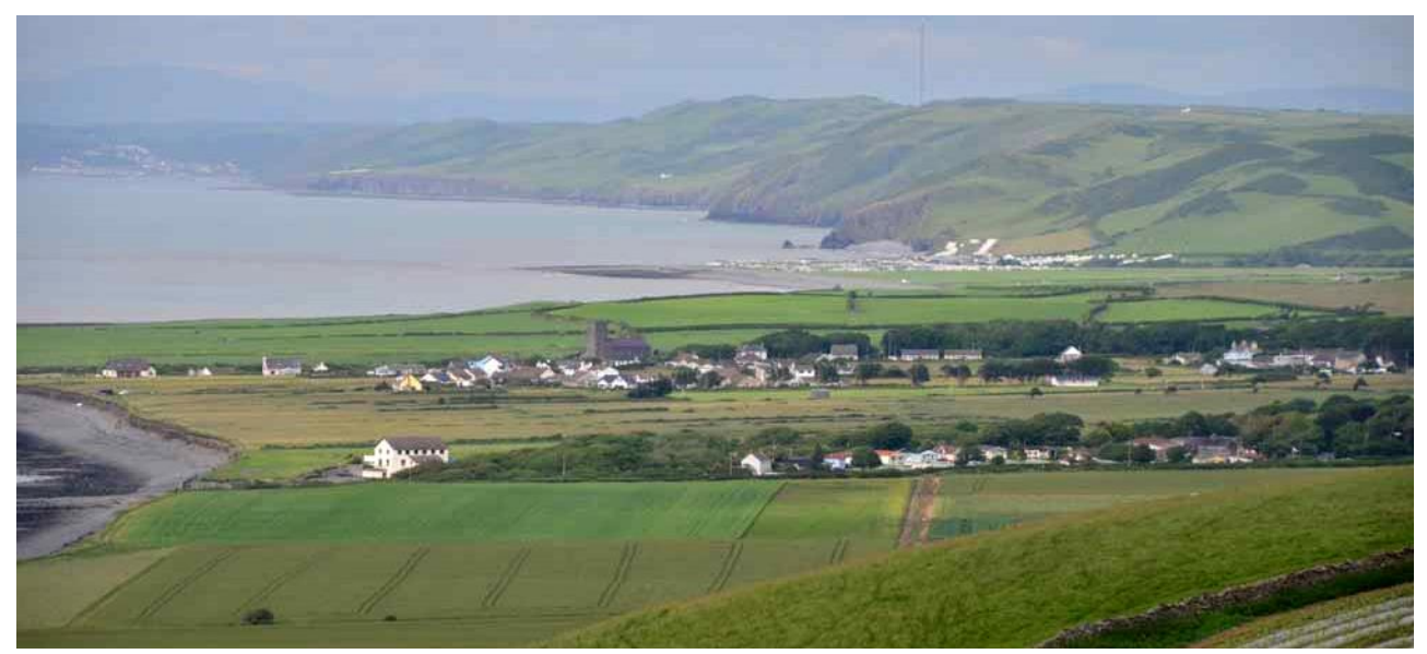
Looking north over Llansantffraed