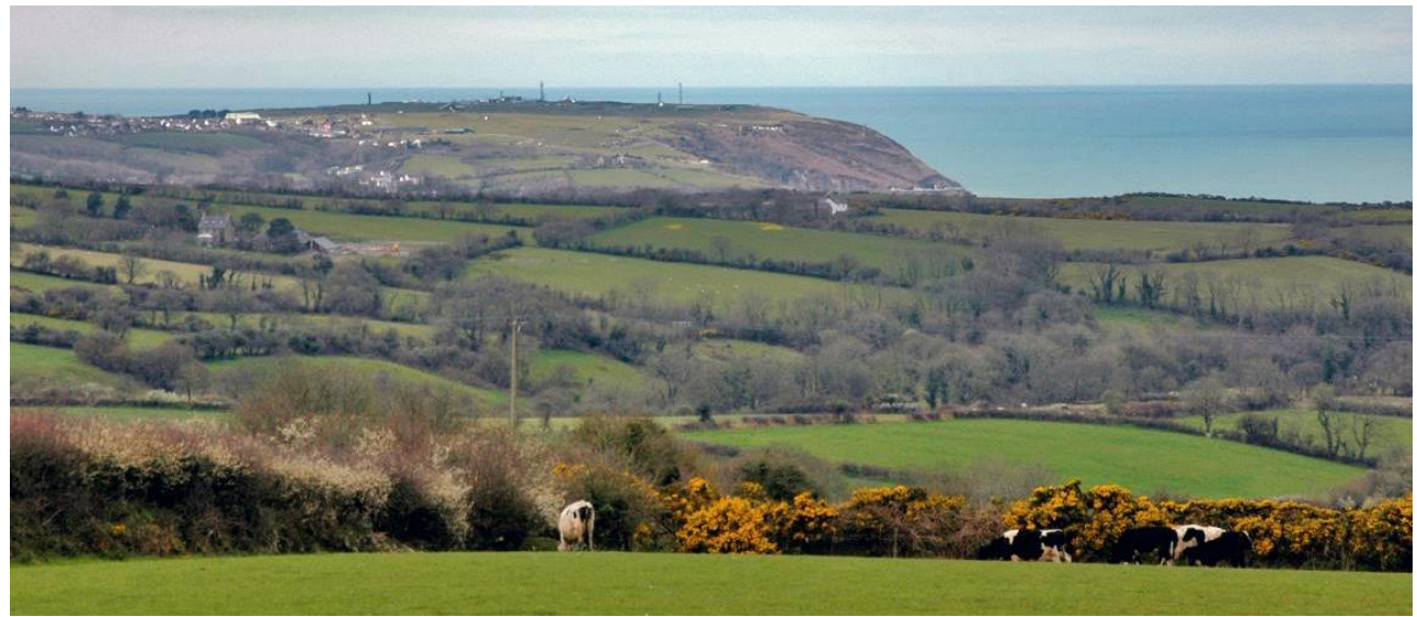
Coastal plateau near Aberporth.