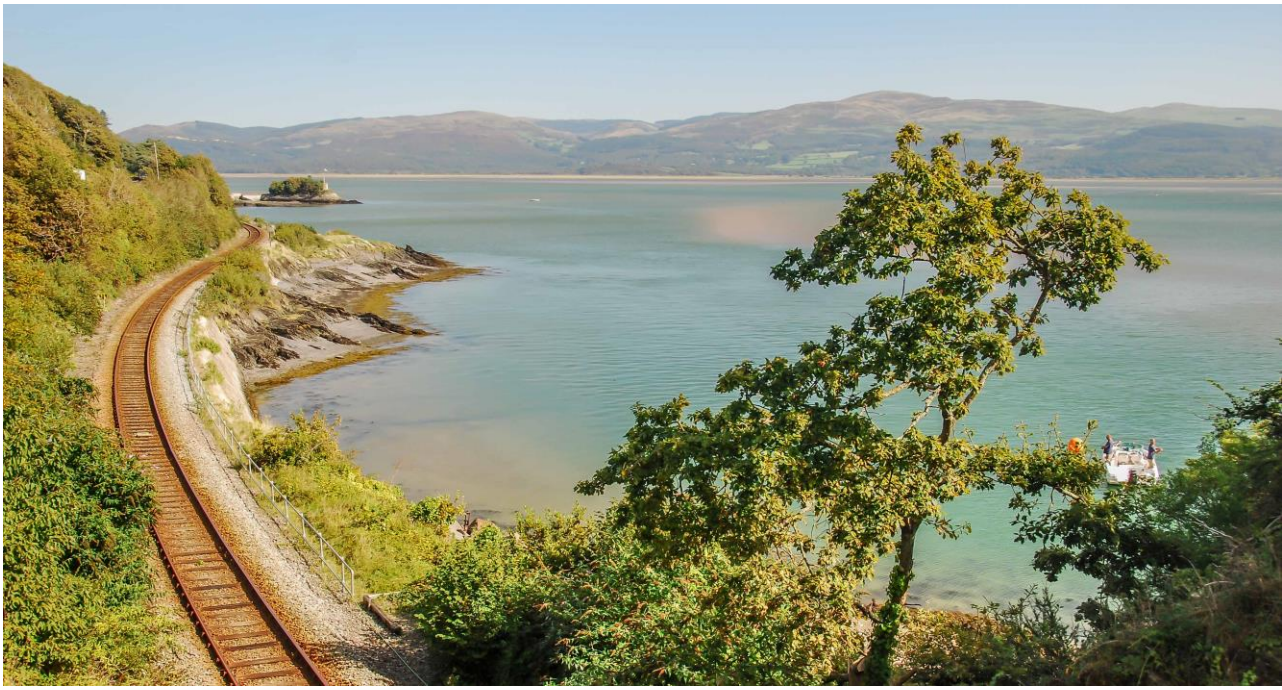
The northern side of the Dyfi estuary, where wooded hills meet the water directly.