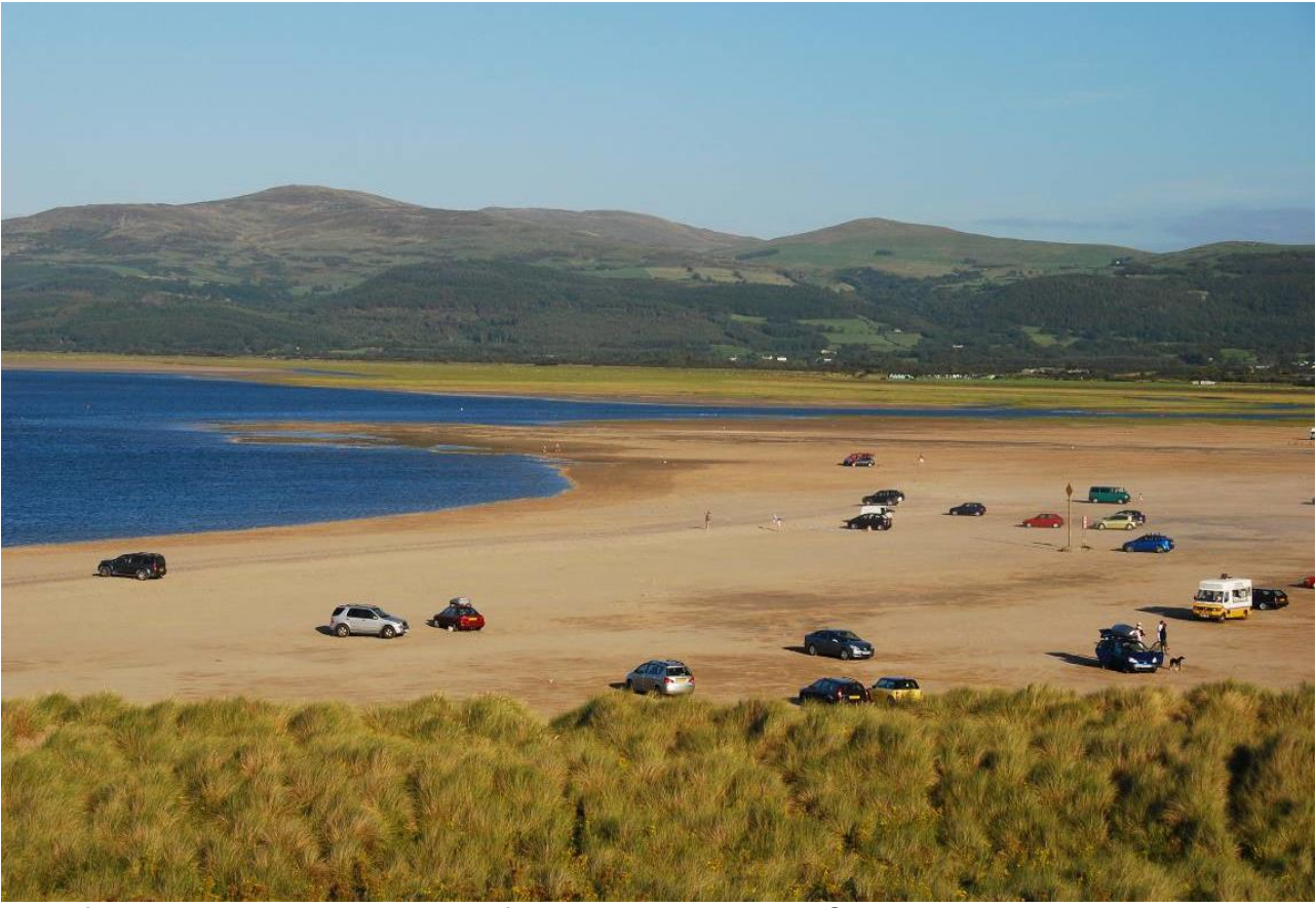
View from Ynys Las across the Dyfi estuary towards the Cambrian Mountains.