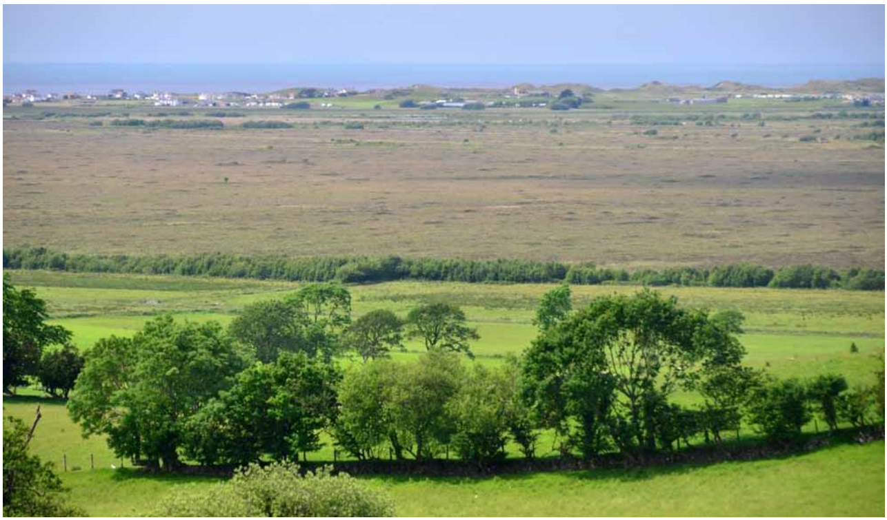
The extensive raised bog, inland from Borth.