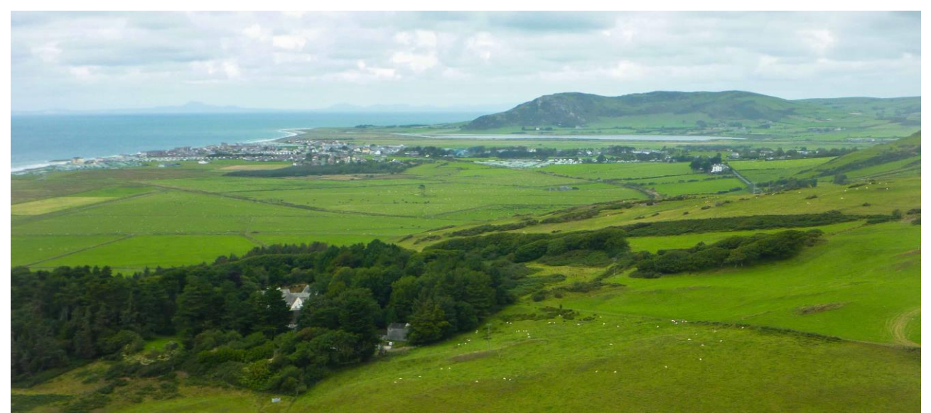
The coastal lowlands and town of Tywyn, and the smaller estuary of the Dysynni.

The enclosed farmed valley contrasts with the much wider estuary, where inter-tidal areas, a salt marsh and lowland raised bog (with heather scrub) occupy much of the flat ground. Farming, settlement and the main transport routes are confined to the edges of these areas. In particular, Aberdyfi's splash of colour contrasts with the exposed and simple character of the coastline itself, open estuary, coastal raised bog and nearby upland areas.