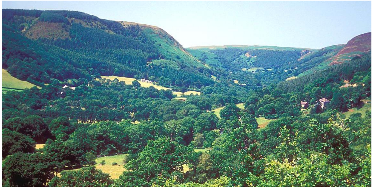
In contrast, the deeply cut upper Tywi valley near Rhandirmwyn