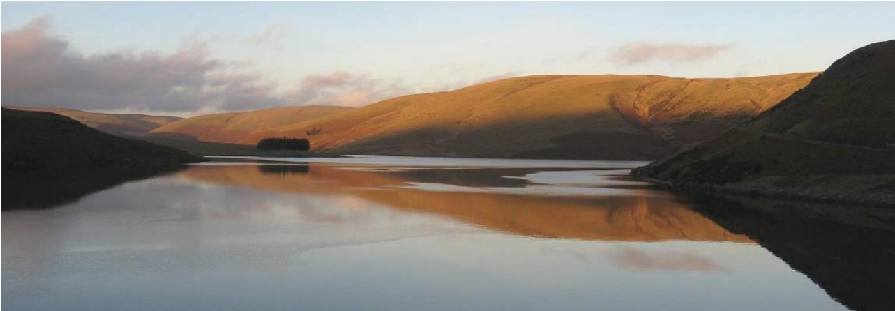
The remote, tranquil, Elan Valley reservoir and a winter's hue to the vegetation.