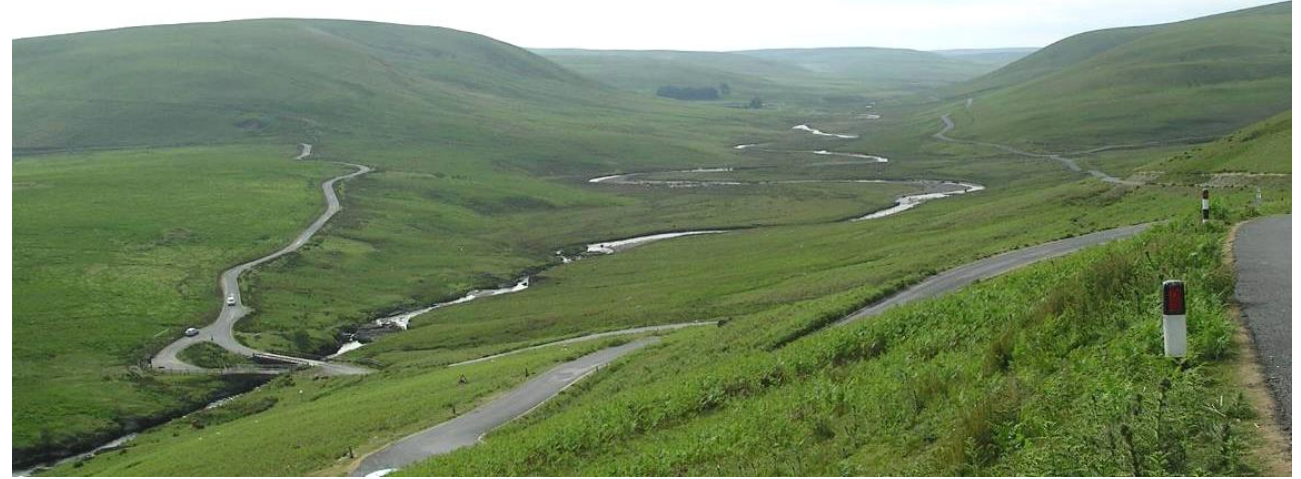
Upper Elan valley, above the reservoirs, with a fresh sward of green in summer.

The presence of car parks, forestry plantations, wind farms and reservoir infrastructure contrasts from the sense of open remoteness in places, as does the busy A44 trunk road, which crosses the mountain range and forms a vital transport link to the Aberystwyth area. Jet aircraft training excercises also have a visible and audible presence at times, but even so, this is one of the most tranquil areas in southern Britain, devoid of light pollution and with little noise. It offers a glorious solitude and represents an increasingly rare and fragile resource.