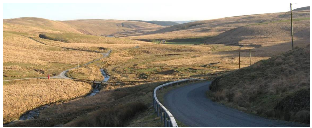
For much of the year these remote uplands are more brown than green. View near Soar-y-mynydd