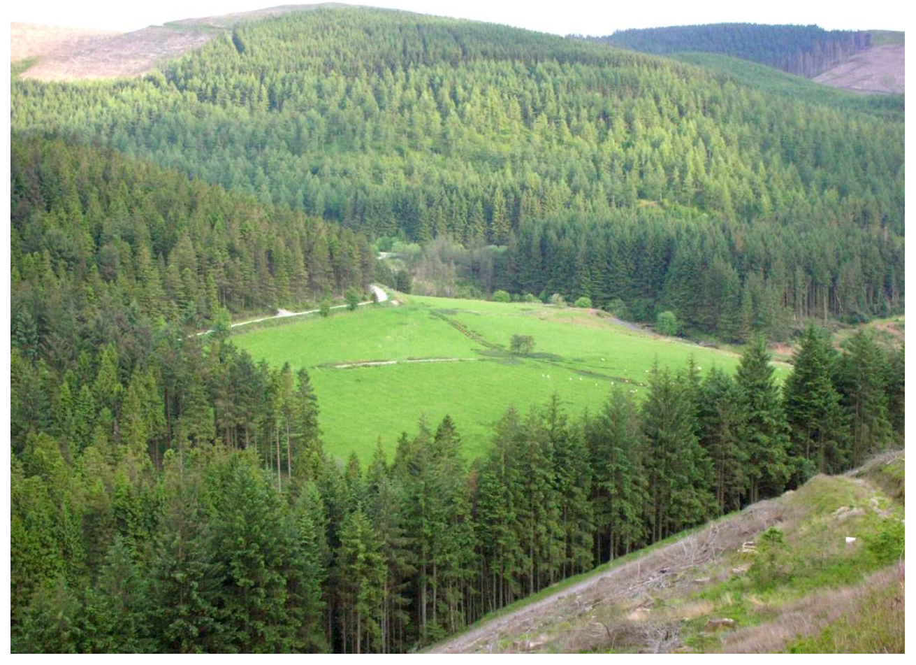
Extensive forestry near Devil's Bridge.