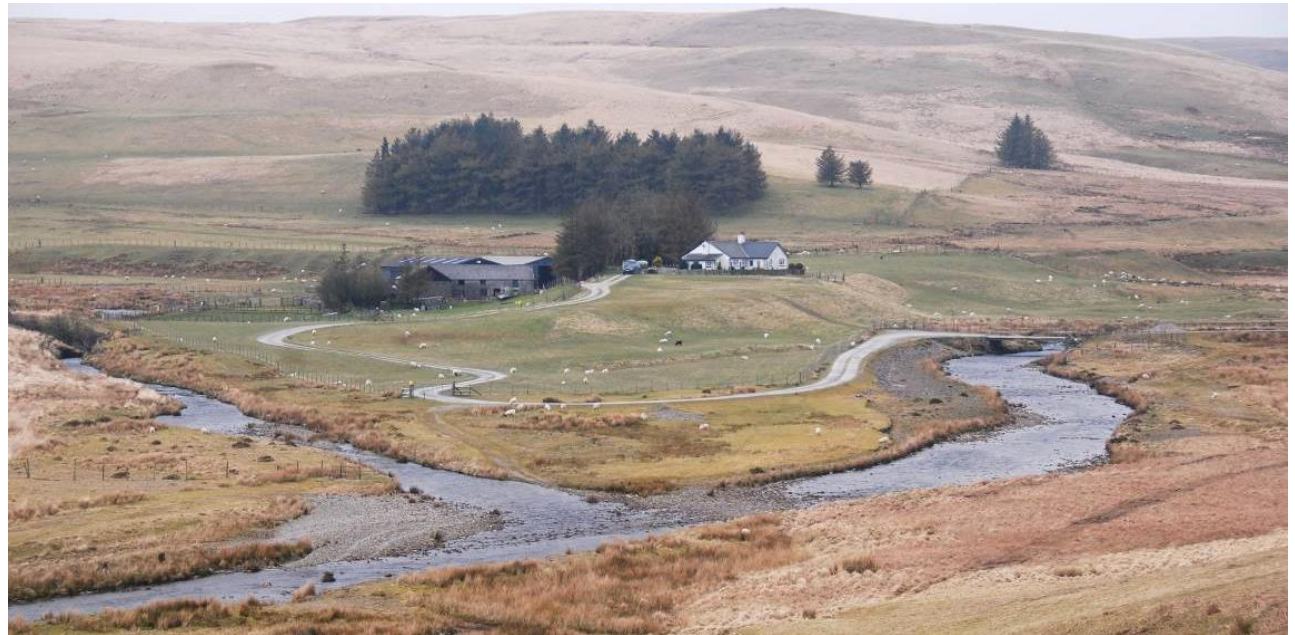
An isolated upland farm in the upper Elan valley and its associated shelter belt plantation.