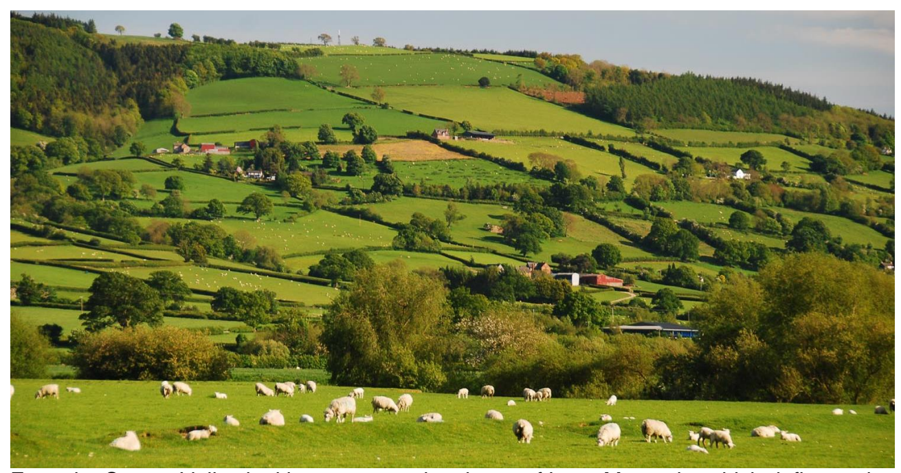
From the Severn Valley looking across to the slopes of Long Mountain, which define and enclose the area around Welshpool.