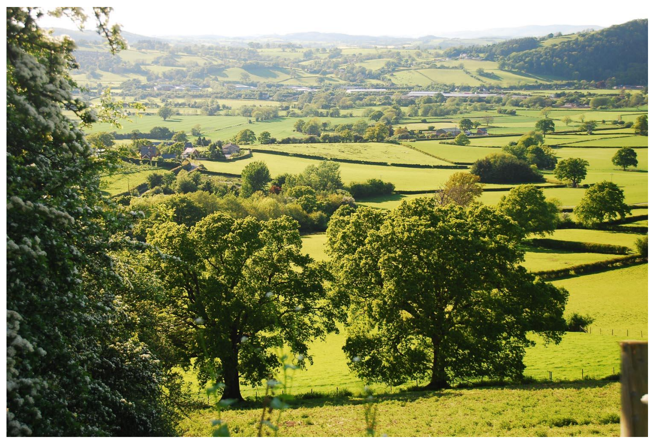
Showing new business park development on the outskirts of Welshpool, and the very mature, lush, green traditional landscape of pastures and hedgerows with trees.