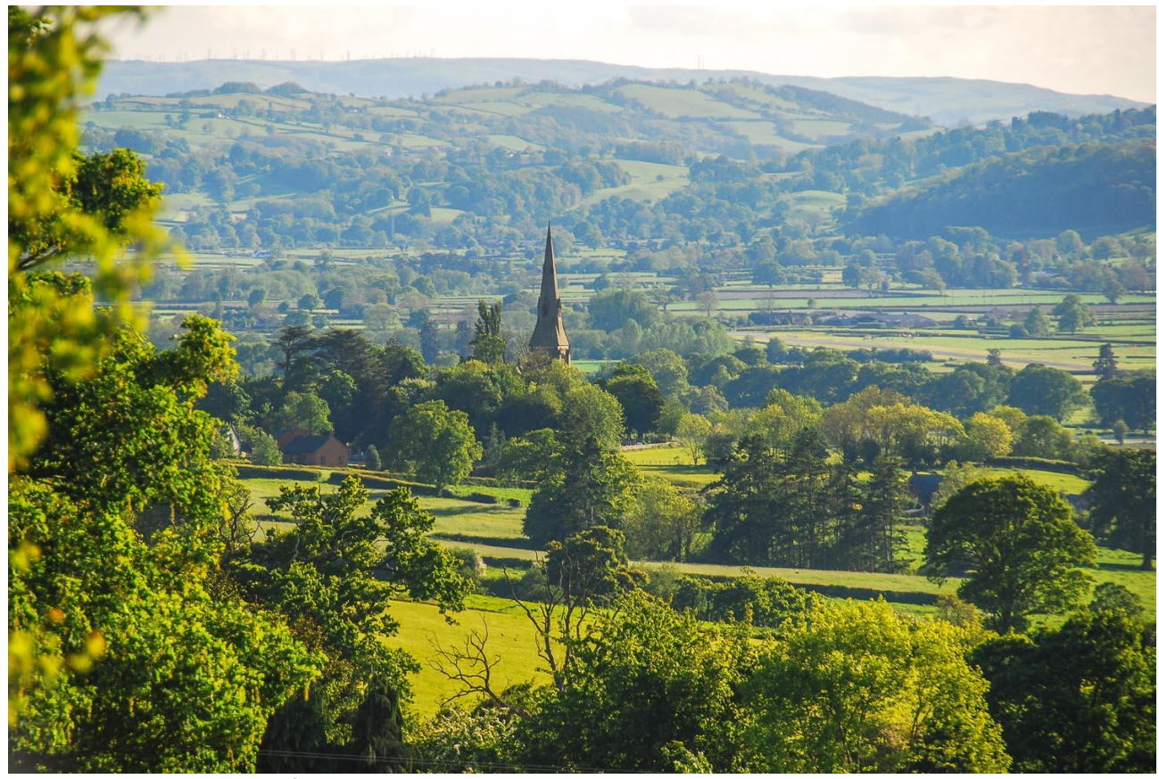
Leighton church spire forms a prominent local landmark near Welshpool