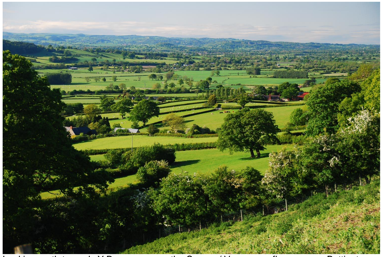
Looking north towards Y Berwyn across the Severn / Vyrnwy confluence near Buttington.