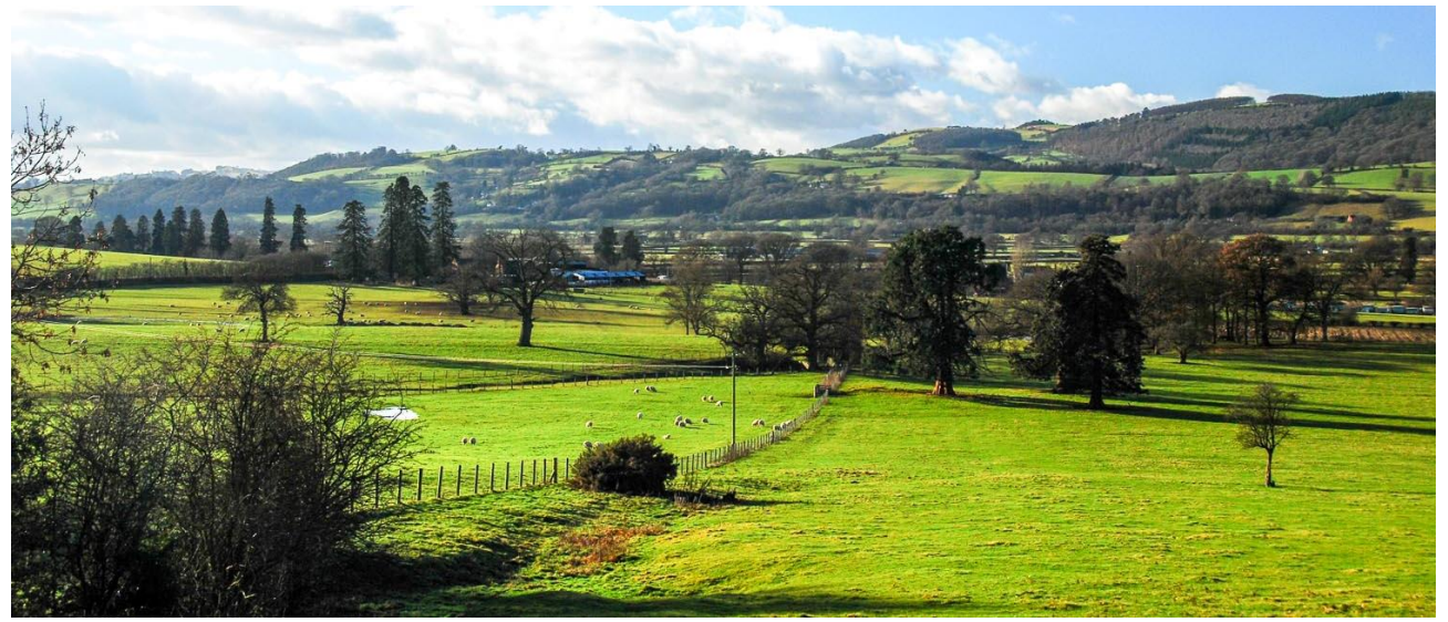
Above and below: the Severn Valley up river from Welshpool, showing the Powys Castle estate (and below the castle itself) from which key views across the area are famed.