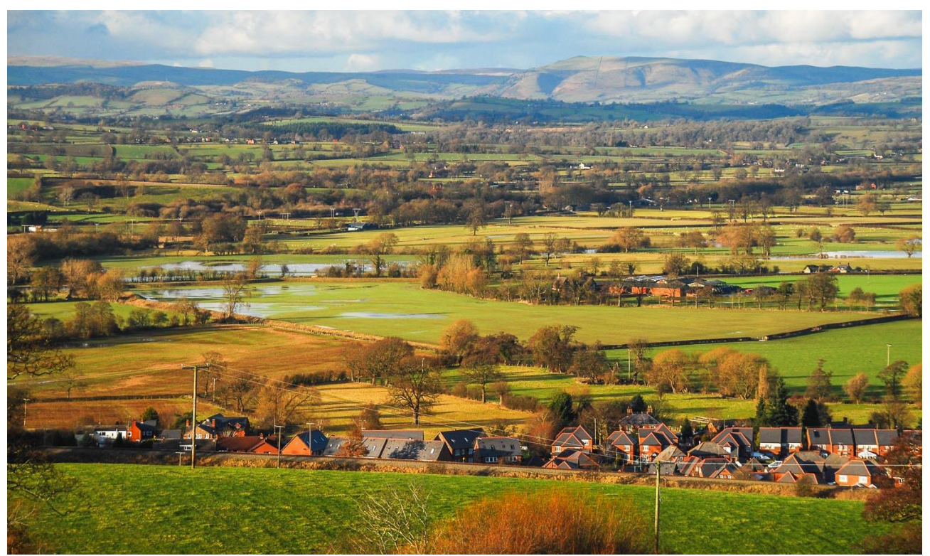
The broad Severn / Vyrnwy confluence and extensive flood plain, looking north from Garreg Bank