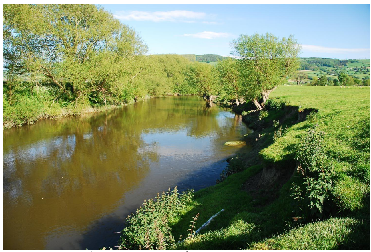
The lowland course of the meandering River Severn, near Buttington