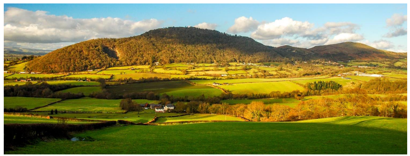
Moel y Golfa and Middletown Hill from the south.