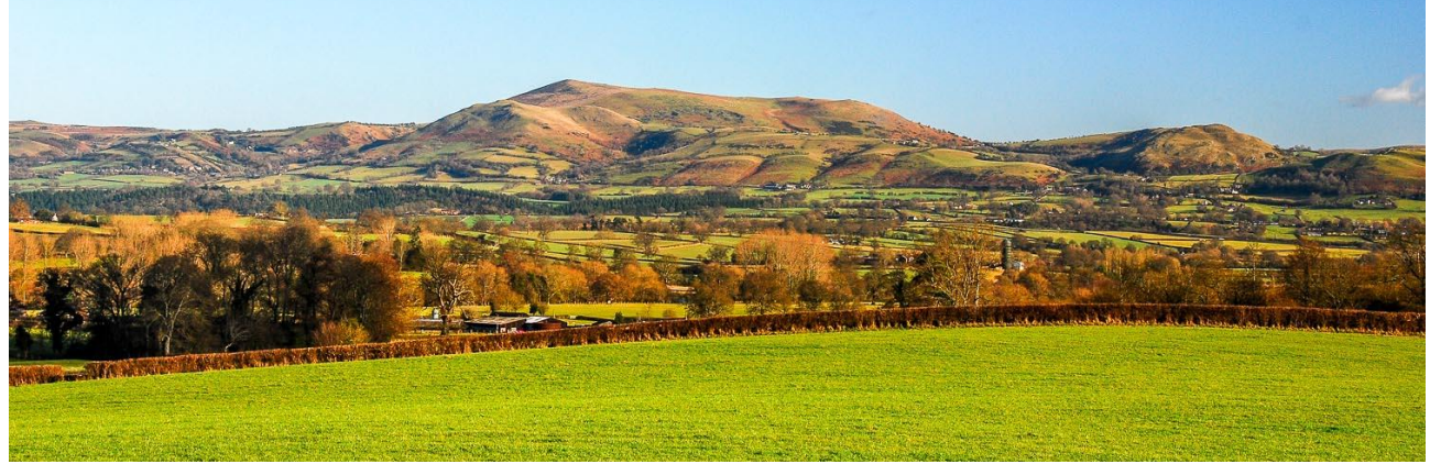
Corndon Hill and the Vale from south of Montgomery

Long Mountain (distance, right) as seen from Montgomery Castle, looking across the Vale of Montgomery