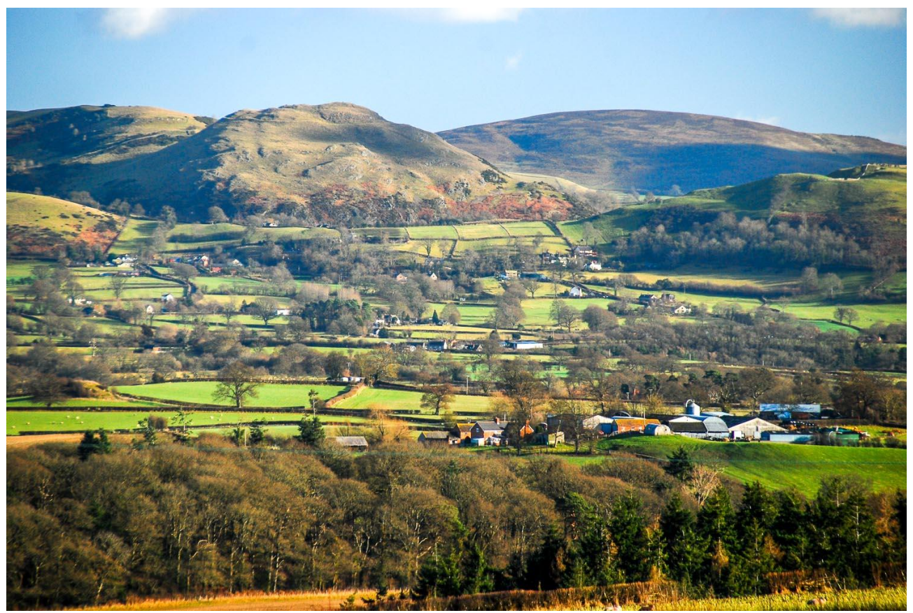
Roundton Hill with Corndon Hill to the background right.