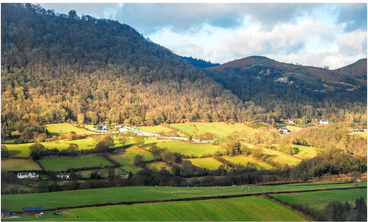
Detail showing the steep wooded sides of Moel y Golfa / Middeltown Hill near the village of Middletown.