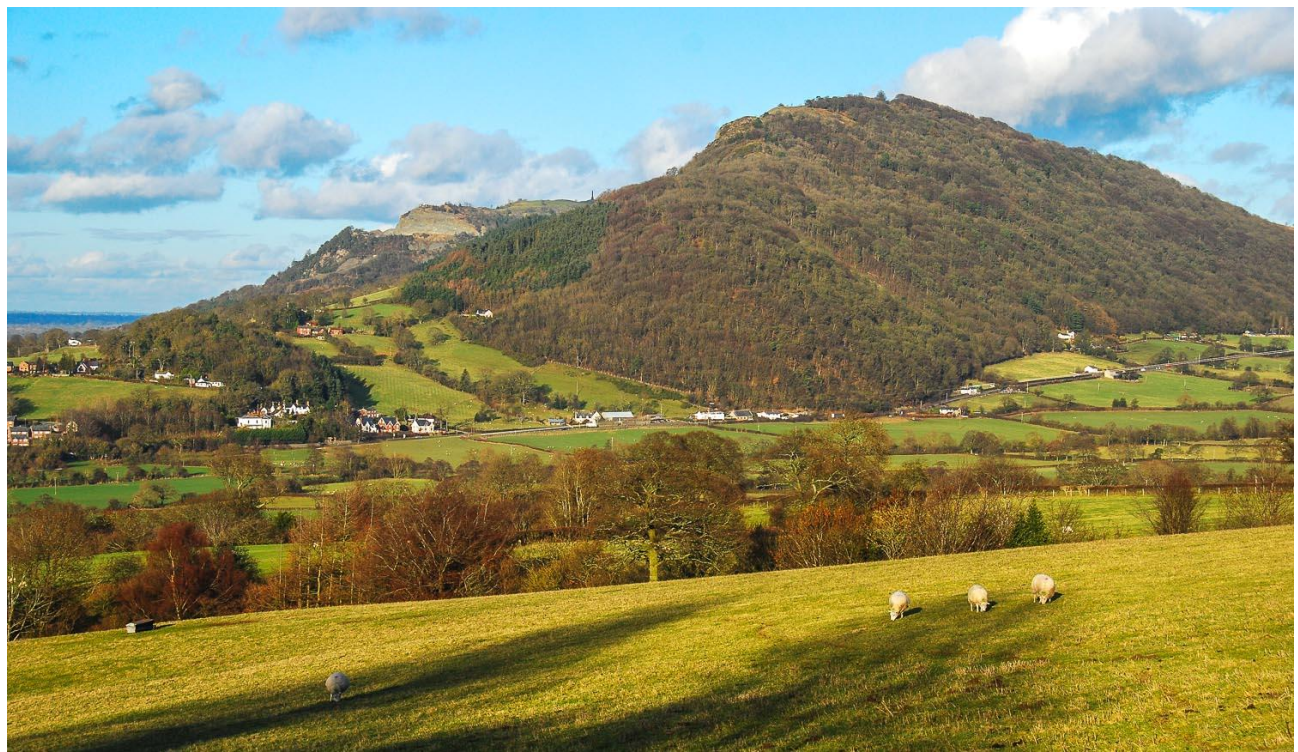
From near Trewern, showing the western end of the Moel y Golfa, with the partially quarried face of the Breidden Hills beyond.