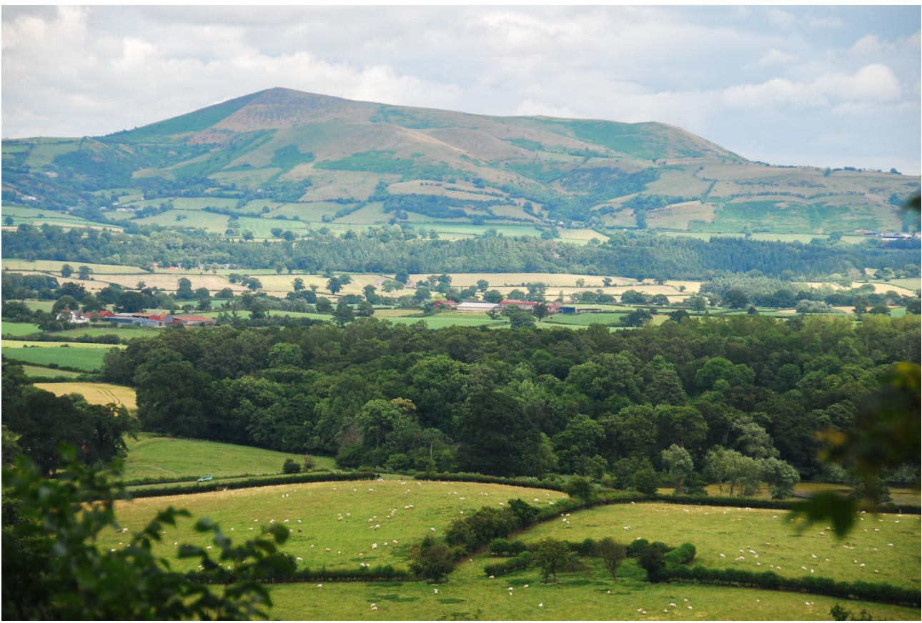
Corndon Hill from Montgomery Castle