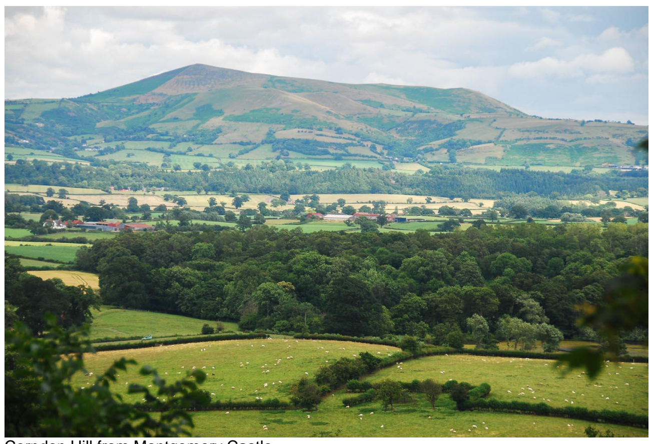
Corndon Hill from Montgomery Castle