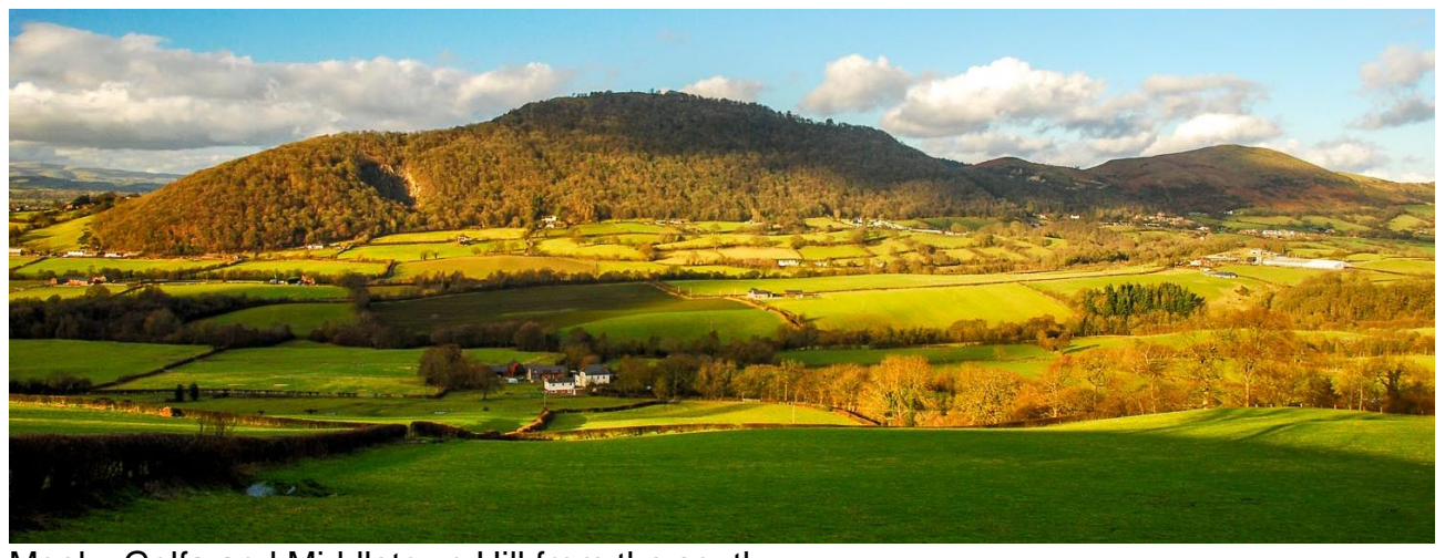
Moel y Golfa and Middletown Hill from the south.