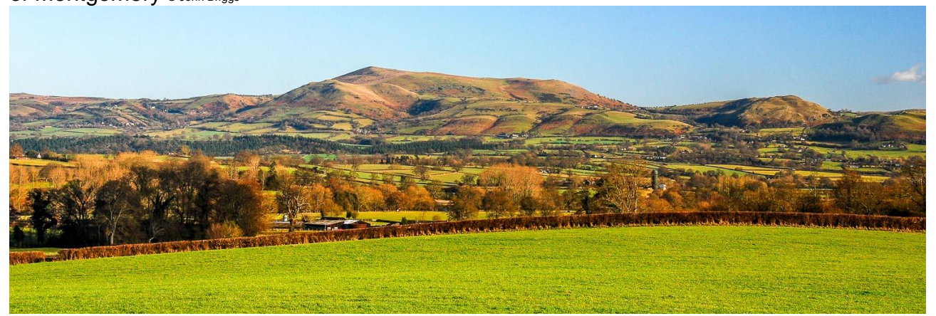
Corndon Hill and the Vale from south of Montgomery