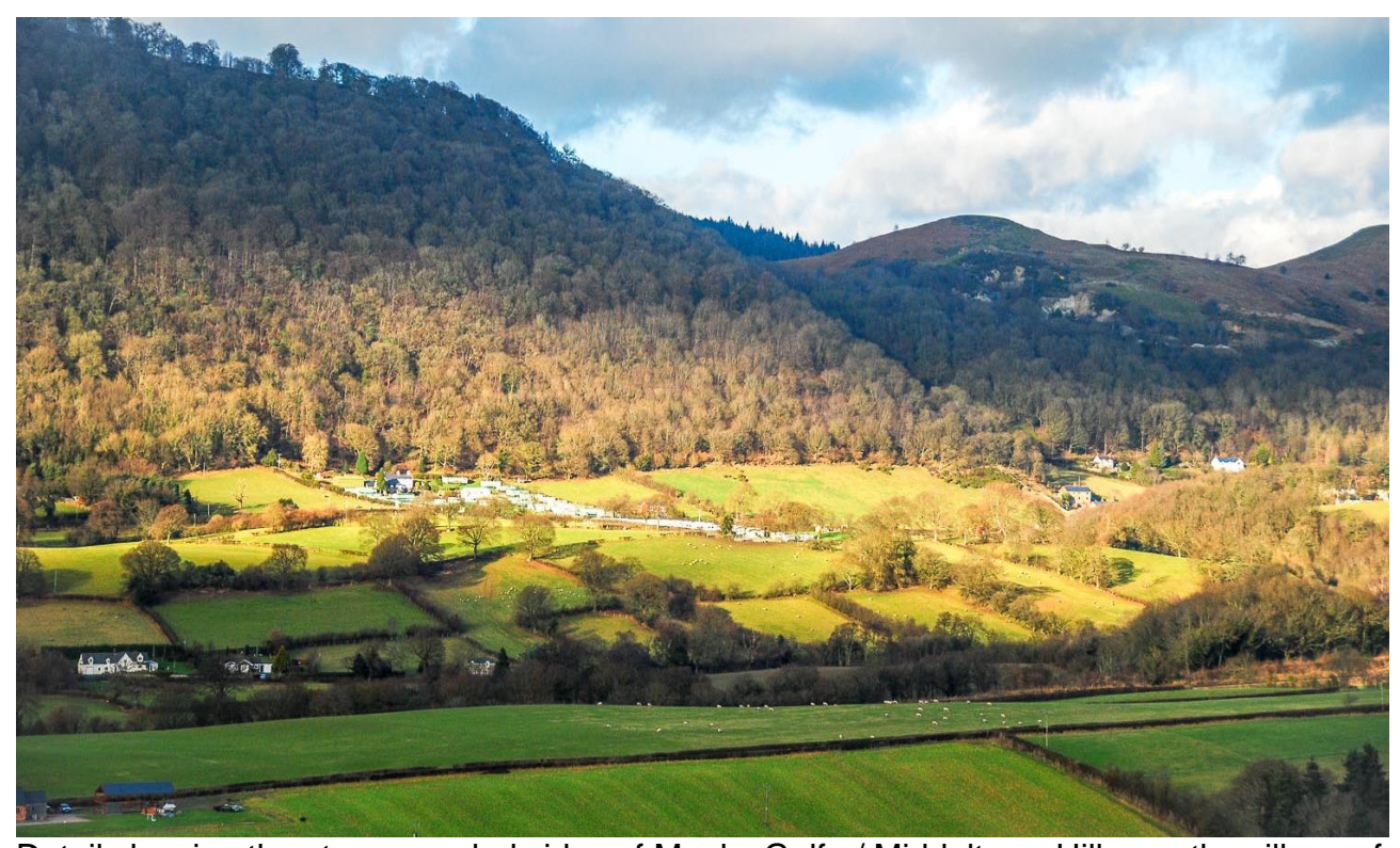
Detail showing the steep wooded sides of Moel y Golfa / Middeltown Hill near the village of Middletown.