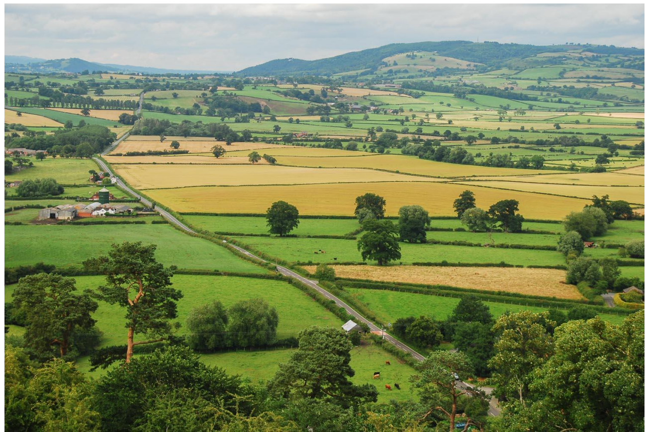
Long Mountain (distance, right) as seen from Montgomery Castle, looking across the Vale of Montgomery