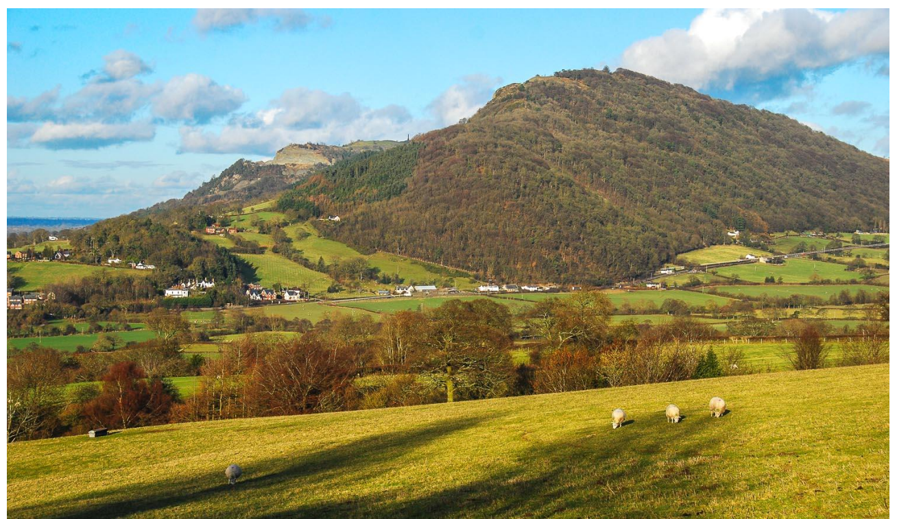
From near Trewern, showing the western end of the Moel y Golfa, with the partially quarried face of the Breidden Hills beyond.