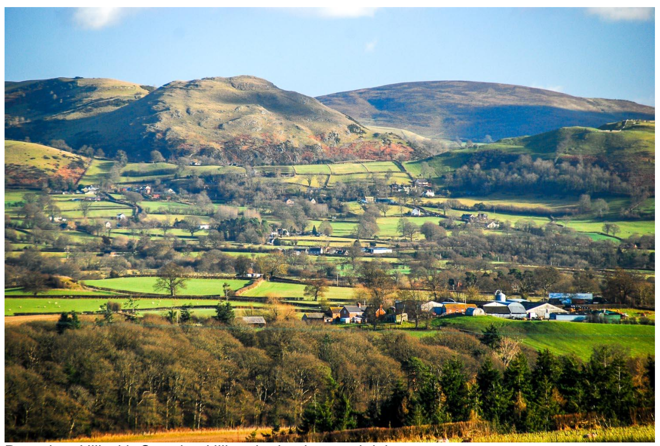
Roundton Hill with Corndon Hill to the background right.