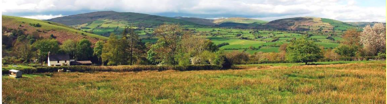
Near Penygarnedd, looking north over the Tanat valley, towards the nearby Berwyn.