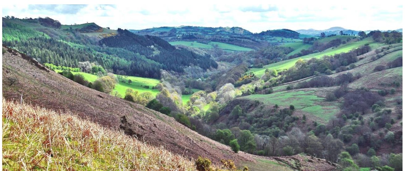
The valley of the River Vyrnwy between Dolanog and Pontrobert.