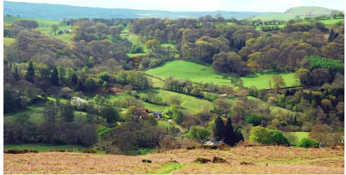
The view south from Dolanog, with Moel Bentyrch visible to the right.

views. Often there are a wide variety of scenes of interest in short succession, providing a strong sense of place, but with repeating variations continuing across a wide area.