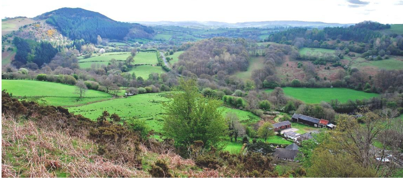
The prospect from Dolanog, south east (towards Welshpool). The wooded hill on the left is Pen y Berth.