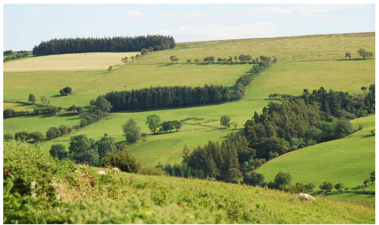
The area includes upland fringes where farmed land meets open hill, where enclosures meet open ground, and where hillsides show a transition between sheltered valley and exposed hilltop.