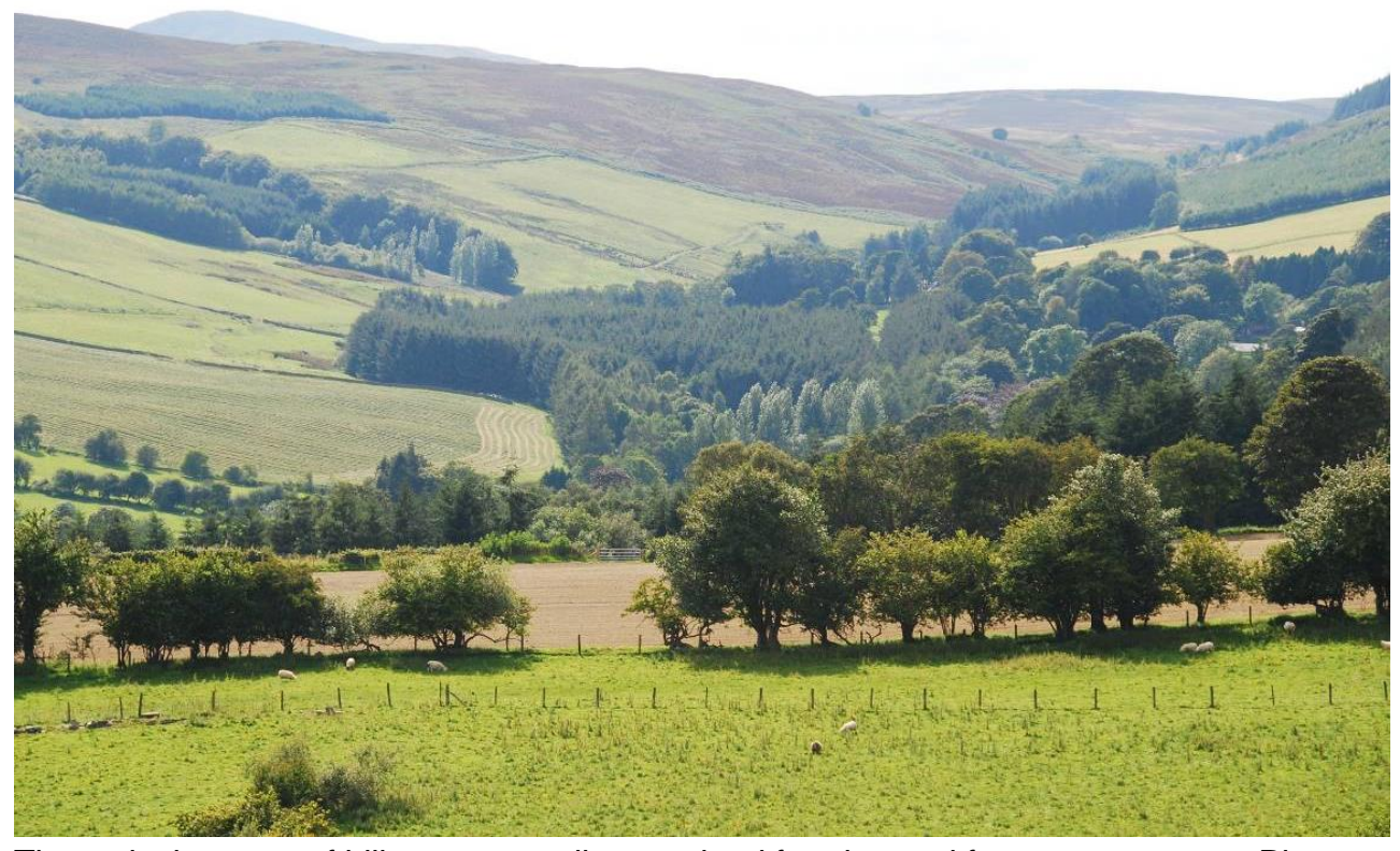
The typical pattern of hills, moors, valleys, upland farming and forestry as seen at Plas Nantyr.