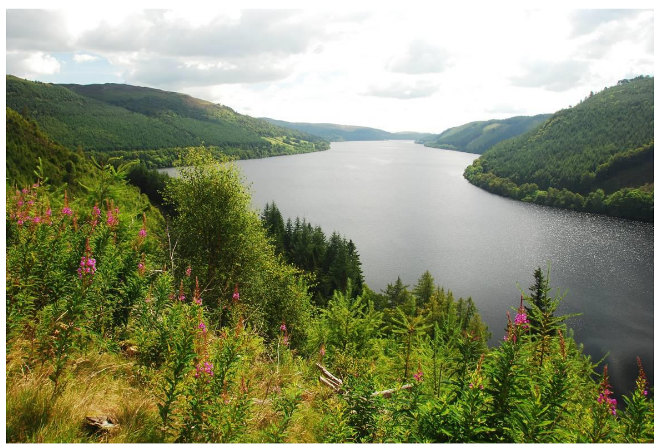
The Llyn Vyrnwy reservoir and forestry. The scale of this reservoir is impressive, filling the valley floor entirely for it's 4 mile length and creating a very different character.