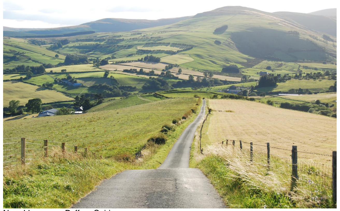
Near Llanarmon Dyffryn Ceiriog