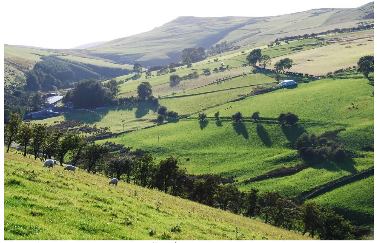
Upland fringes above Llanarmon Dyffryn Ceiriog. In some areas as here, hedges have become overgrown and gappy and supplemented by fences.