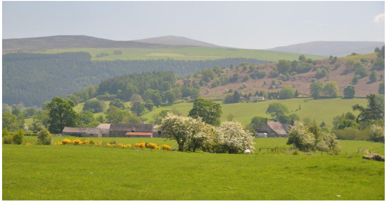
Llandrillo near Pont Cilan

Tranquillity is only lessened by the few 'B' class and minor roads that cross the area, while the few settlements that do exist, such as Llangynog, are distinctively compact in form and structure. To have such a visually varied and engrossing landscape so close to the border with the extensive lowlands of Cheshire and Shropshire to the east is notable, as are the many quiet and unfrequented areas by comparison to the adjacent Vale of Llangollen.