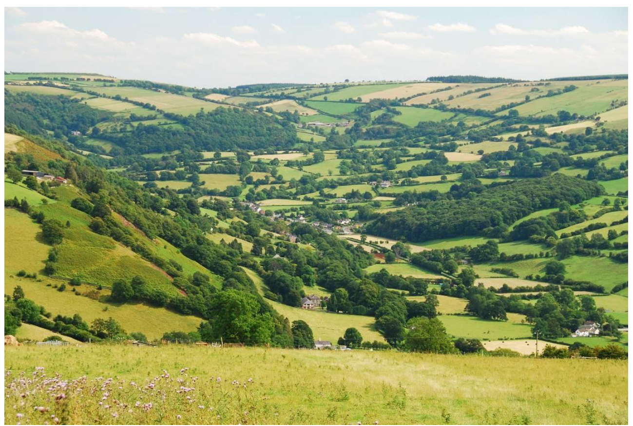
Pontfadog, on the eastern fringes of the range of hills. Here the enclosed valley pastures extend further up hillsides, giving way to larger hillside and hill top fields, some arable.