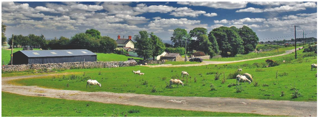
Agriculture at Halkyn Mountain, in the north-east of the area.

The area is rural and is largely upland, quiet and undeveloped, despite a number of quarries. With its relatively low population density, it contributes to a sense of quietness and tranquillity that contrasts with the busier, industrial and urbanised character of Deeside and Wrexham to the east. The Clwydian Range provides the nearest upland countryside recreation haven in Wales, for the populations of the greater Deeside, Wrexham, Chester and Merseyside areas.