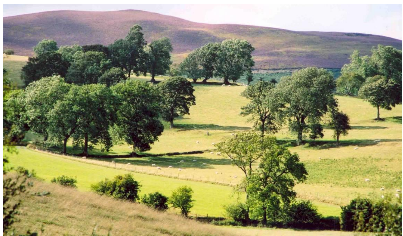
The main chain of the Clwydian Range comprises a series of smooth heather-clad hills. View towards Moel Gyw, Llanarmon-yn-iâl.

The most extensive upland areas in the Clwydian Range are centred on Moel Famau at 554m altitude and Moel y Gamelin at 577m altitude. These are areas of smooth, open, rounded, and distinctively shaped heather-clad hills. Their undulating ridge lines and skylines, together with rolling profiles, create a distinctive landscape of sinuous, organic form. High valleys and passes provide their only breaks, with the exception of occasional large-scale elements such as coniferous plantations. This creates a simple landscape, very much marked with seasonal colour contrast, with a variety of vegetation types, including heather, gorse, bracken and bilberry. The Jubilee Tower on the summit of Moel Famau, and the Moel y Parc radio transmission mast above the Vale of Clwyd are very distinctive hilltop landmarks. The northern half of the area has been designated as an AONB.