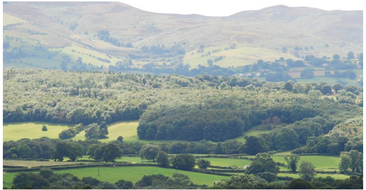
Intervening lowland between hills, with woodland and agriculture, as seen within the area near Mold. Looking towards the foothills of Moel Famau.