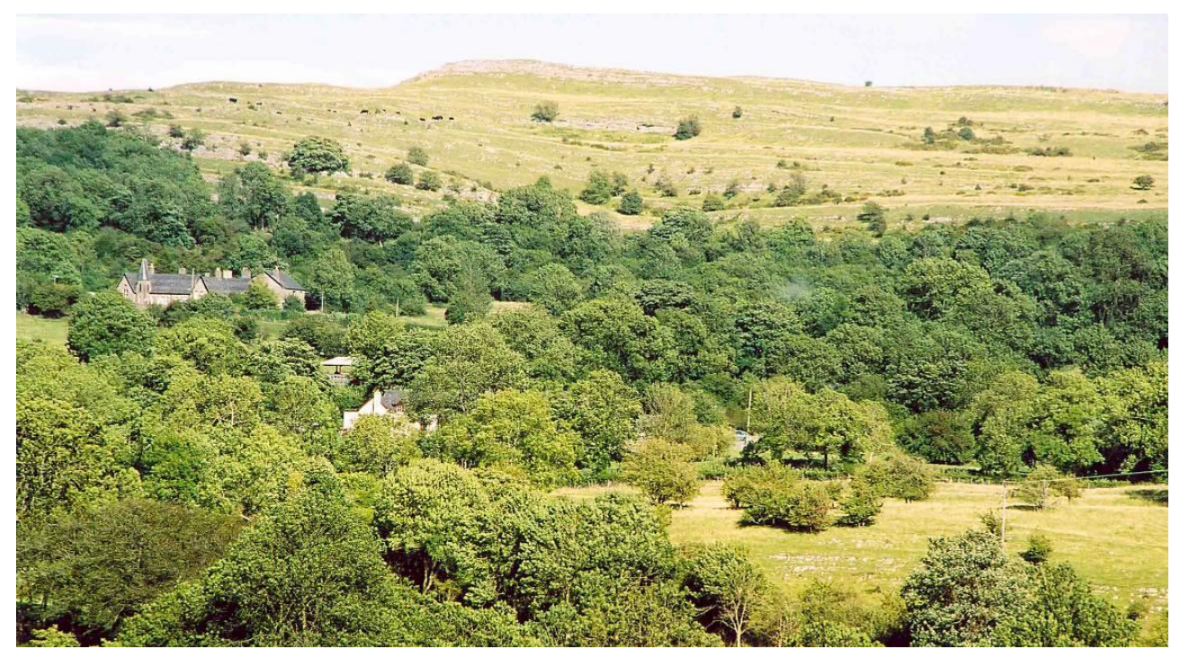
A secondary, but no less distinctive limestone landscape, as at Y Graig SSSI, seen from the west

These uplands are also noteworthy when viewed from England: Moel Famau and Mynydd Halkyn from Merseyside and the Wirral, and Ruabon Mountain and Esclusham Mountain from Shropshire and Cheshire. These two groups of hills also form strong boundaries respectively with the Vale of Clwyd to the west and the Vale of Llangollen to the south.