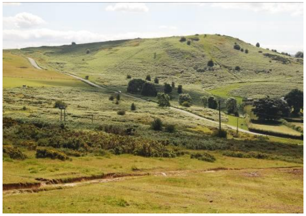
Settlement, and open heath, pock-marked with relict mining features on Halkyn Mountain.