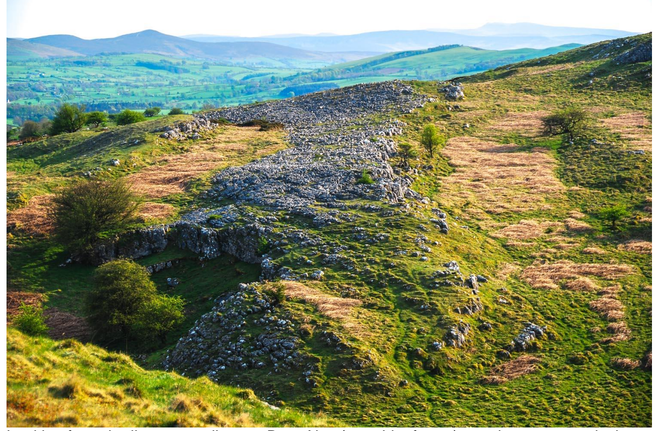
Looking from the limestone clints on Bryn Alyn (near Llanferres), south-west towards the heather-clad moors of Llantisilio Mountain, beyond which are seen the rolling plateau moors of Y Berwyn.