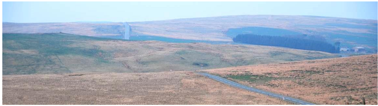
The very open, remote, exposed character of Mynydd Hiraethog and A543 road.