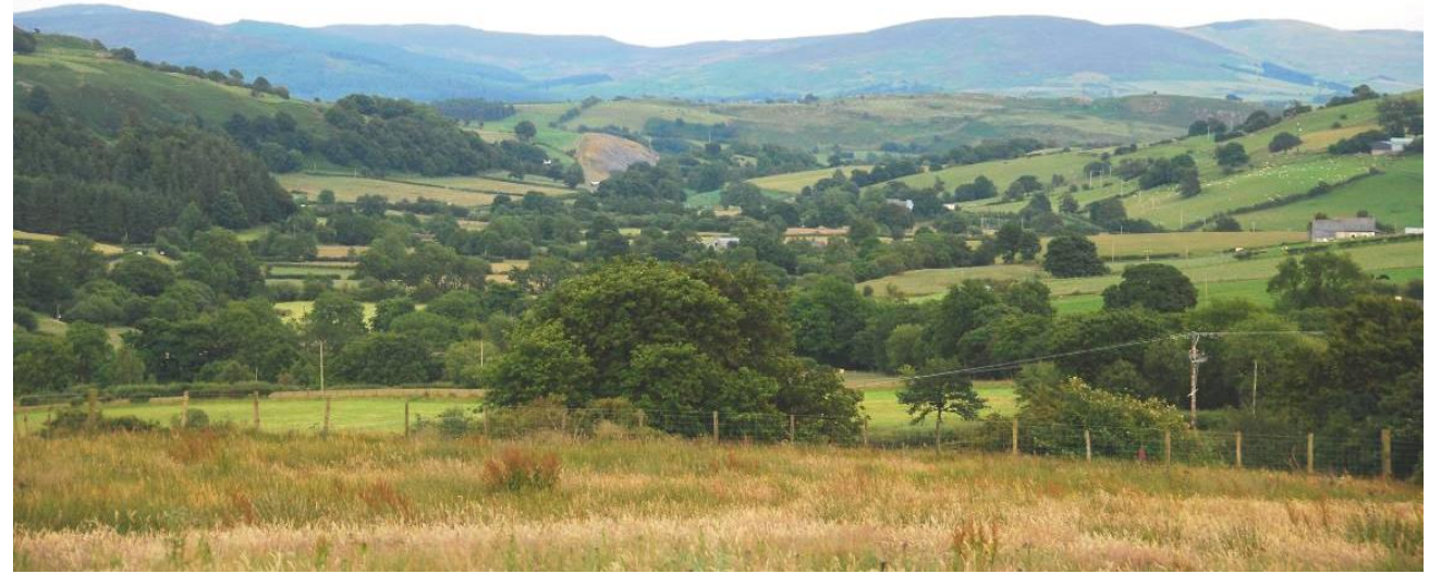
The gentle vale and historic route corridor of the A5 trunk road that divides the Clocaenog Forest and Denbigh Moors from the higher, rounded moorland to the south.