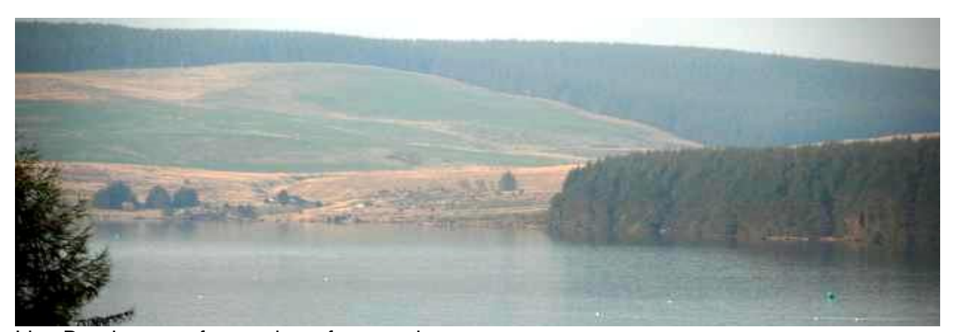
Llyn Brenig, one of a number of reservoirs.