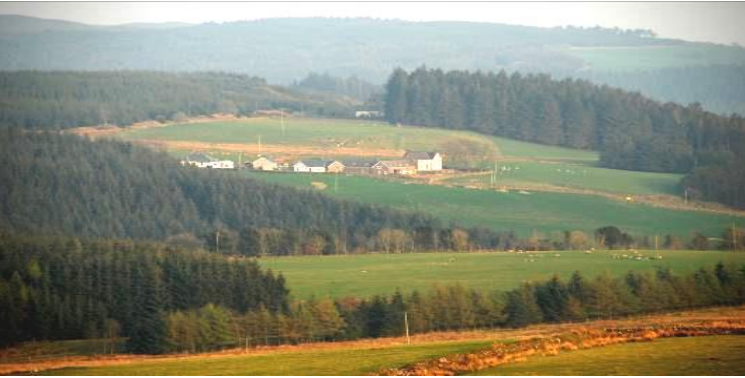
Rollin upland grazing and forestry by Clocaenog Forest.