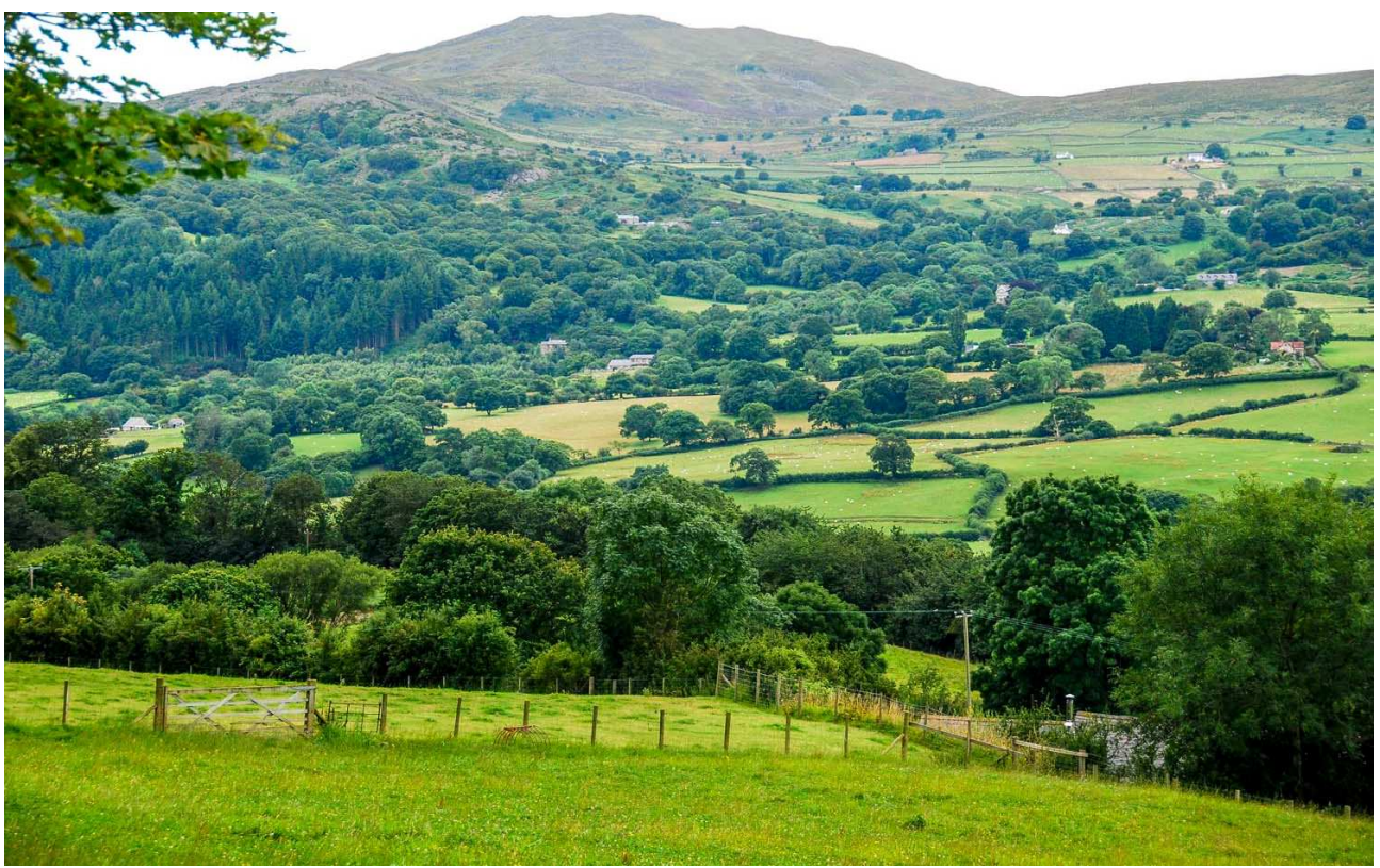
The rural character, with pastures, and woodlands on hillsides, rising up to the mountains of Snowdonia, as seen here near Rowen.