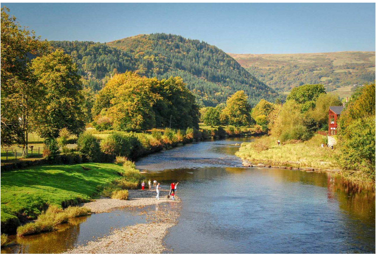
The gentle gradient of the river at Llanwrst contrasts to the dramatic, rising, adjacent wooded hillsides of Snowdonia to the west.