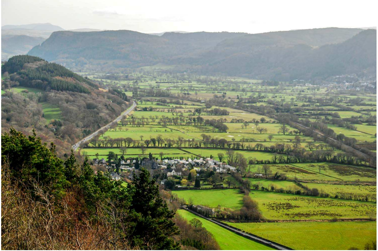
From Cadair Ifan Goch, looking up the Conwy Valley, Trefriw village is on the right. Road and rail routes are seen, but roads tend to keep to the edge of the flood plain.