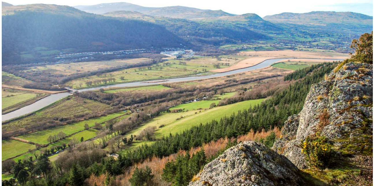
From Cadair Ifan Goch, we look across to the linear village of Dolgarrog with it's formar Aluminium works site.