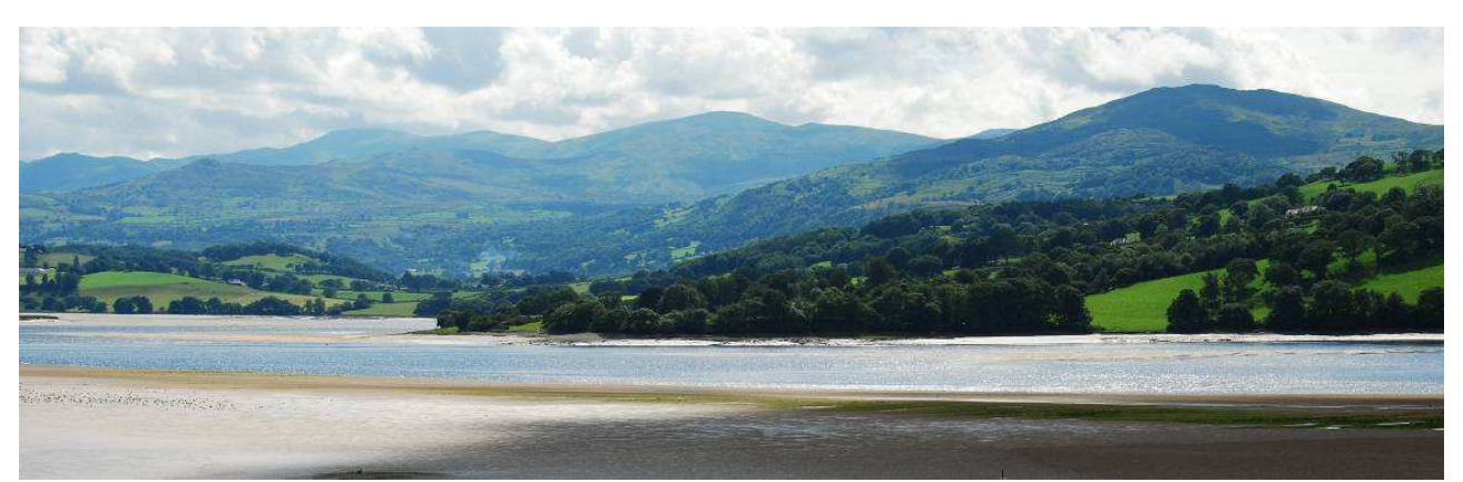
In the mid to northern sections, the River Conwy broadens into an estuary and the valley widens to include a number of rolling foothills.

As the estuary approaches it mouth, and notably at Conwy Quay and Conwy marina, boating activity and built development increases to become a dominant characteristic. Conwy, together with Llandudno Junction and Deganwy along the area's boundaries with adjacent areas, are all linked by busy roads and the Chester to Holyhead railway line and associated Llandudno and Blaenau Ffestiniog branches. Conwy harbour and marina provide foci for boating activity within the estuary. The historic walled town of Conwy is dominated by its castle, which is seen from various vantages but most notably from across the estuary with the town, and backed by a wooded hinterland and the rising mountains of Snowdonia, as one of the most popular and iconic of Welsh vistas. By contrast, development on the east bank, within the neighbouring area is more recent and suburban in character, relating more closely to the North Wales coastal resorts, with a mix of residential, retail and light industrial estates.