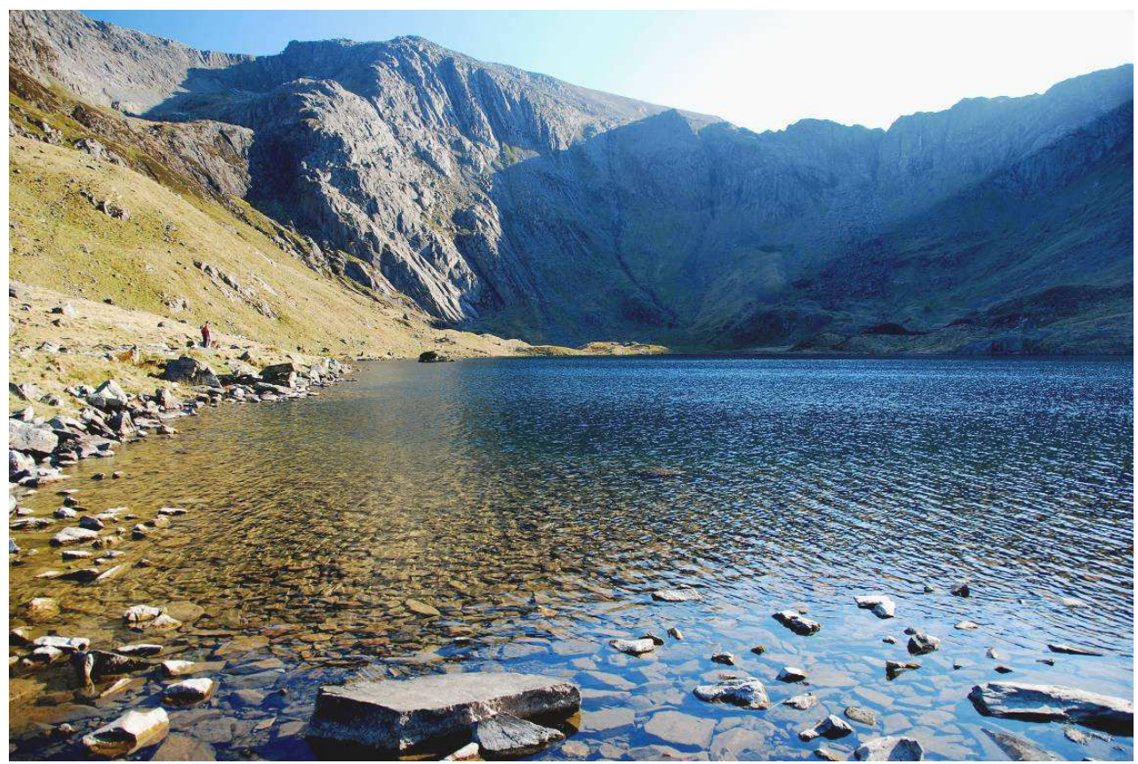
Rugged, dramatic, upland scenery and contrasts, with many lakes, rivers, mountains and valleys. Here, Cwm Idwal is just one of numerous cymoedd (corries) and lakes.