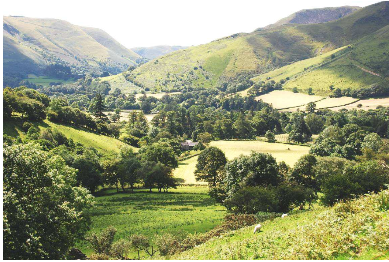
To the southern and eastern parts of the area, seen here in the upper Dyfi valley, the landscape is smoother and softer, but still steep, upland and in places rugged.