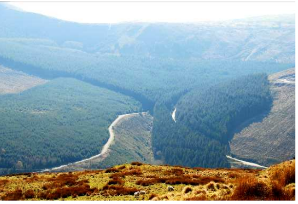
The uplands take many forms, from craggy and open, to smooth and afforested...