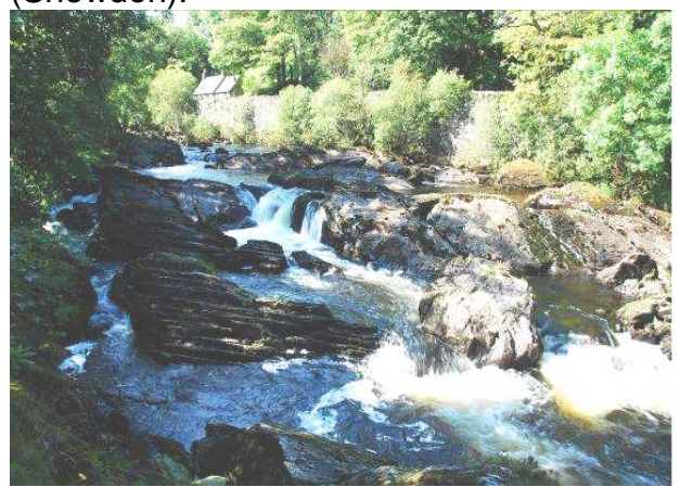
There are numerous forests and lakes, rivers and waterfalls.