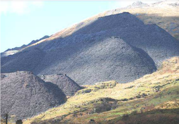
...from open marginal farmed land to heavily quarried and mined hillsides.