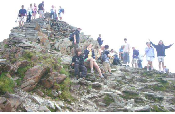
...to the busy summit of Yr Wyddfa (Snowdon).