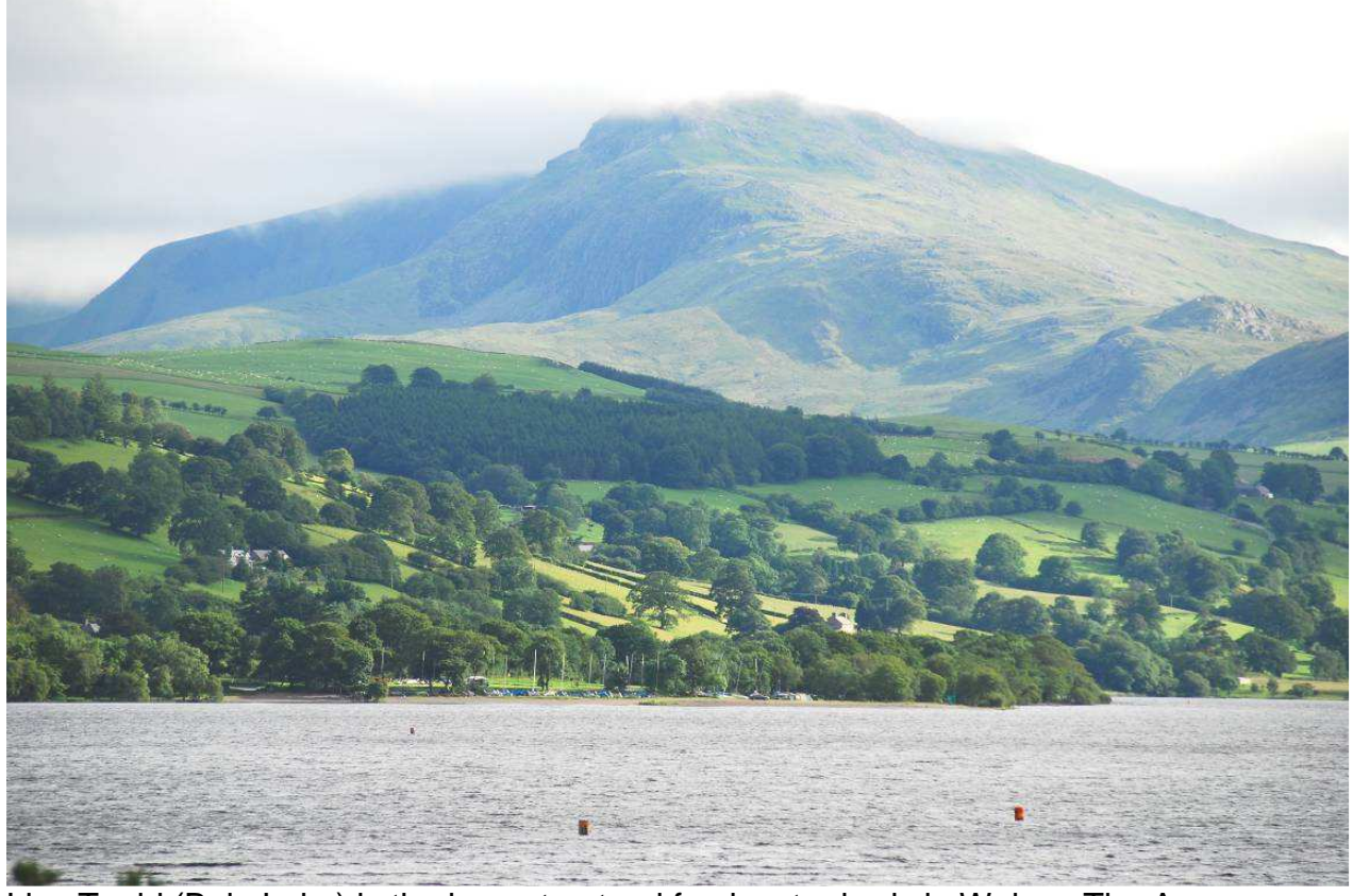
Llyn Tegid (Bala Lake) is the largest natural freshwater body in Wales. The Aran Mountains rise menacingly to the south, in contrast to the gentle 'patchwork quilt' of improved pastures, hedgerow patterns and hedgerow trees that occupy the lower land near the lake.