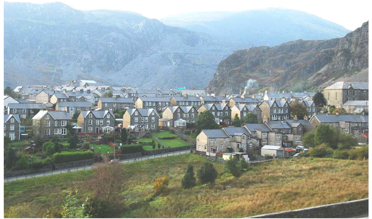
Blaenau Ffestiniog, the Victorian slate mining town set within a horseshoe of stark, grey, dramatic, rising mountainous uplands that are heavily scarred by the extensive slate quarrying workings from which the wealth of the town arose.