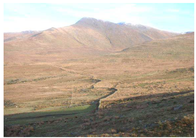
From the 'empty' Carneddau, part of the northern mountainous upland...