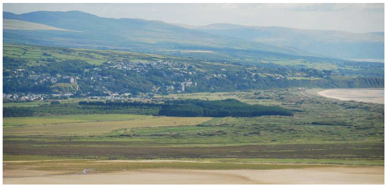
View from Moel-y-gest, looking south across the Dwyryd - Glaslyn Estuary and Morfa Harlech, towards Harlech and its castle in the distance.