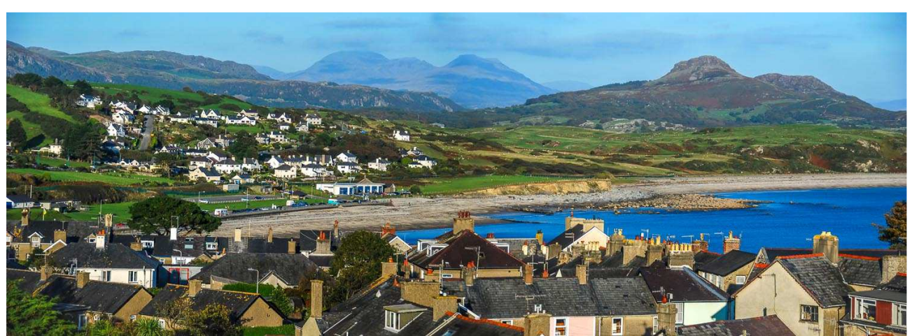
The coastal town and visitor desitnation of Criccieth, and its setting. The near mountain to the right is Moel-y-gest, which rises out from this character area but is clearly of a character that relates more closely with the nearby Snowdonia.