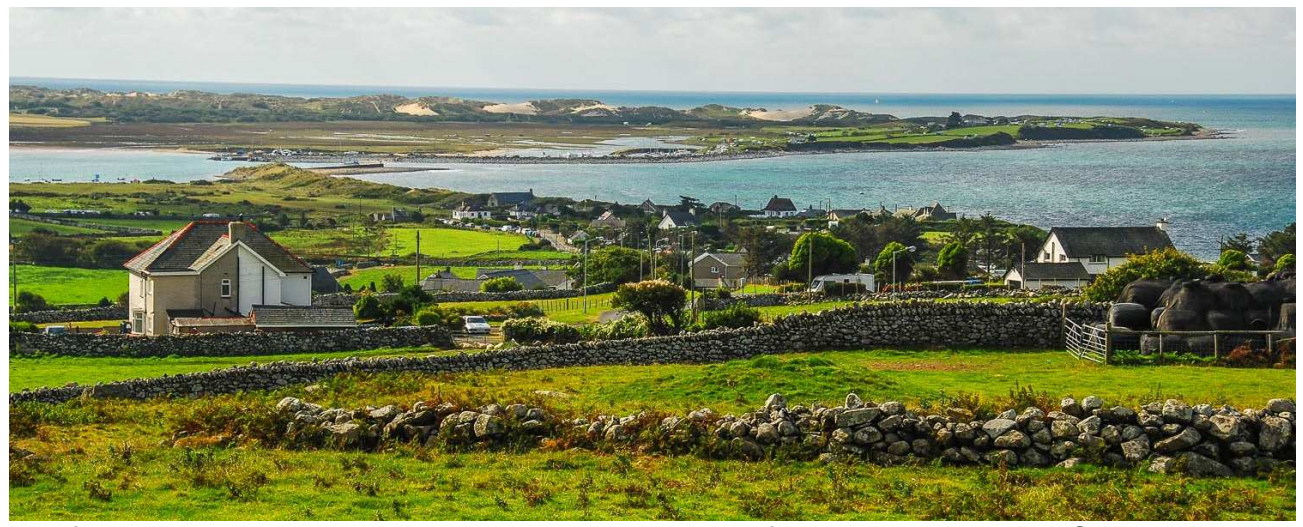
Llanfair looking towards Llandanwg. Note the walled fieldscape, the many C20th houses in it, and the extensive coastal dunes (Morfa Dyffryn) in the background.

South of the Dwyryd – Glaslyn Estuary and running down as far as the next major estuary, the Mawddach at Barmouth, there is a narrow, soft coastal plain, squeezed between the sea itself and the steadily rising Rhinogydd mountain sides. Characteristic for much of the length are wide, sandy beaches, backed by extensive and well-developed dune systems at Morfa Harlech and Morfa Dyffryn, that still retain some quiet expanses of sand despite some prominently visible caravan sites and popular visitor access points. Inland, a still rural agricultural landscape retains some of Wales's most impressive stone walls, though the expanding villages and holiday and leisure related developments are often in contrast. The elevated hillside landmark of Harlech Castle, with its adjacent historic village, commands views over much of Tremadoc Bay.