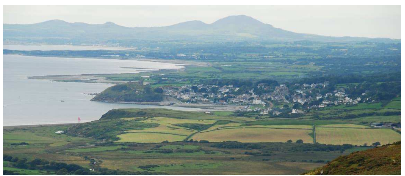
The view west from Moel-y-gest, looking across the coastal landscape of Tremadoc Bay, with Criccieth and it's castle in the foreground and the hills of Llŷn in the distance.