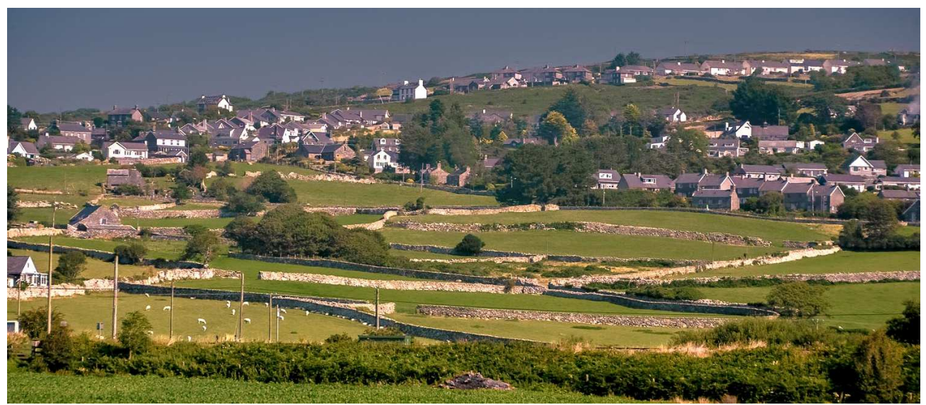
Llanfair from Llandanwg, illustrating the well conserved stone wall fieldscape but with many new C20th houses extending from the historic village core.