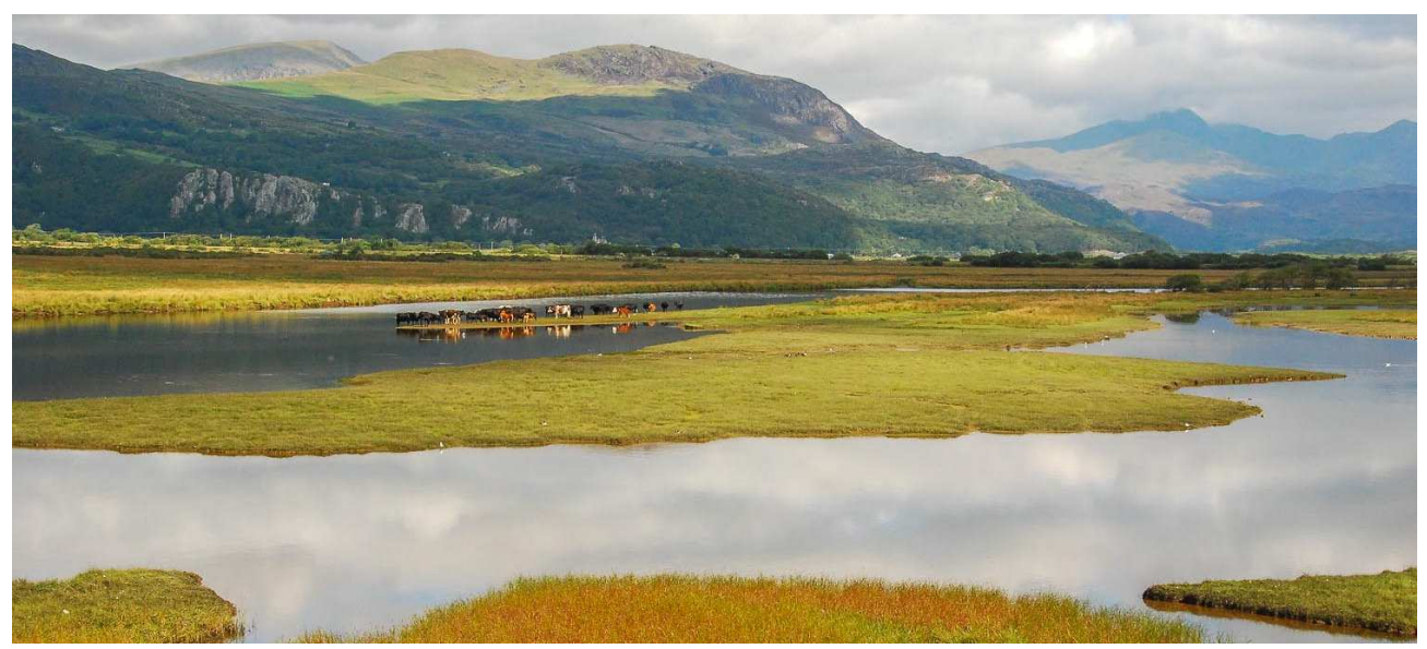
The extensive Glaslyn Estaury is still prone to occasional flooding.