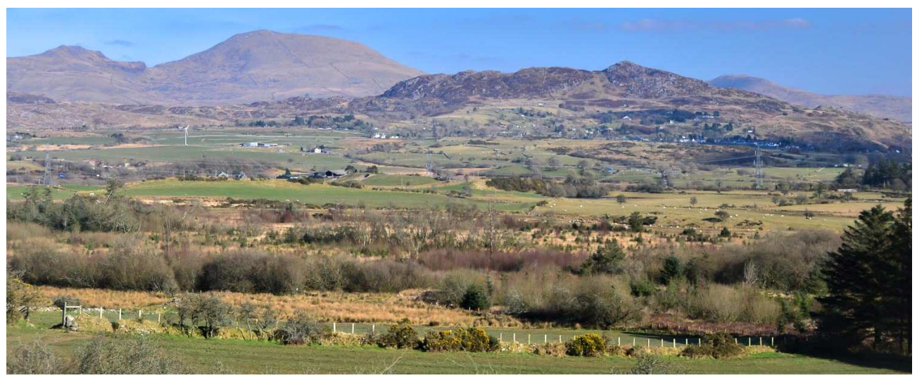
The lowland hinterland between coast and mountains, to the east of Porthmadog.