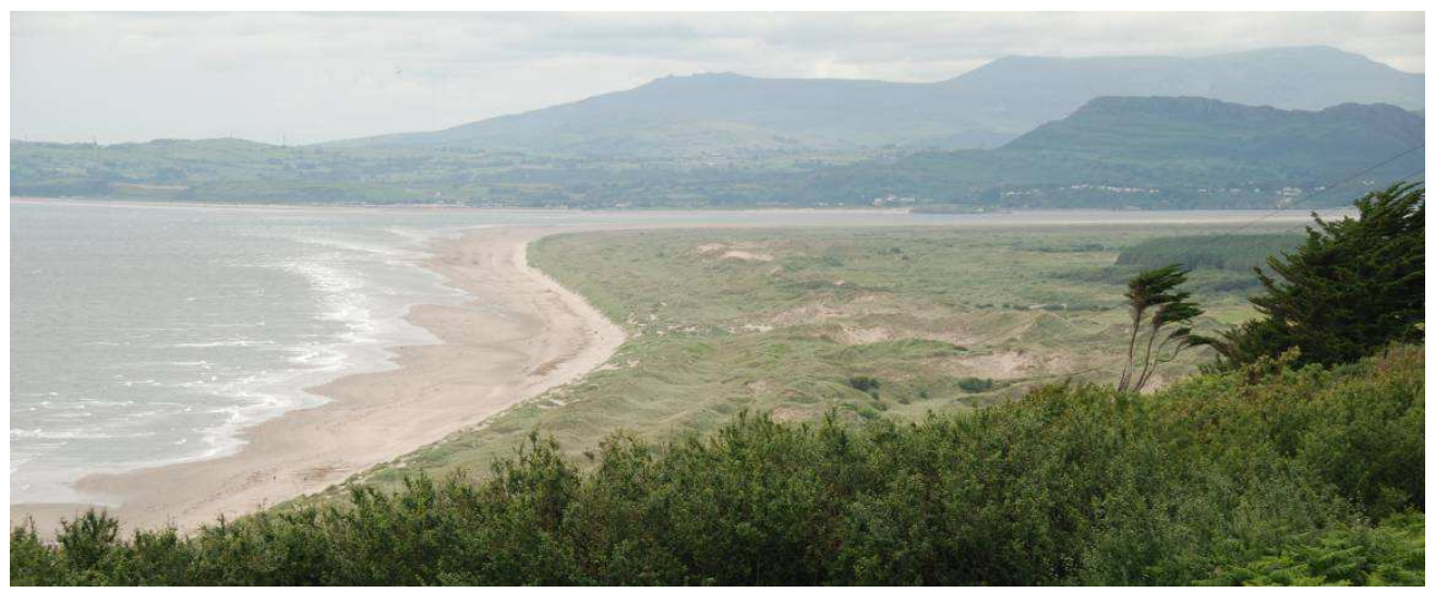
Substantial undeveloped sections of soft coastline, such as at Morfa Harlech.