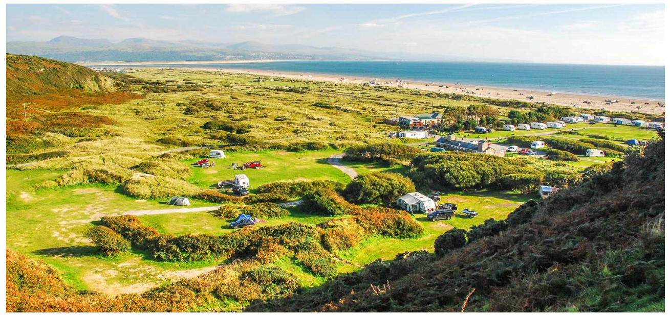
Morfa Bychan near Porthmadog, illustrating extensive dunes along a soft coast and much evidence of tourism related land use and visitor numbers.