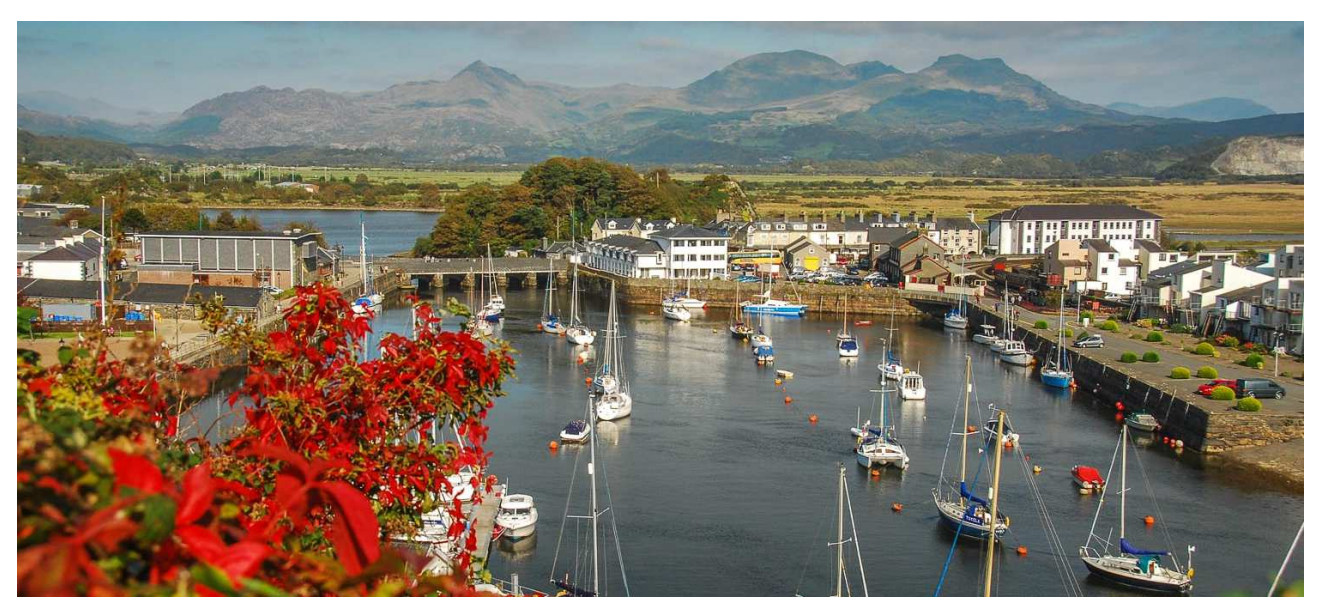
Porthmadog Harbour, with much late C20th tourism-related redevelopment, and the vast, partially reclaimed Glaslyn Estuary beyond, backed by distinctive Snowdonian mountains such as Cnicht (above the bridge), Moelwyn Mawr and Moelwyn Bach.