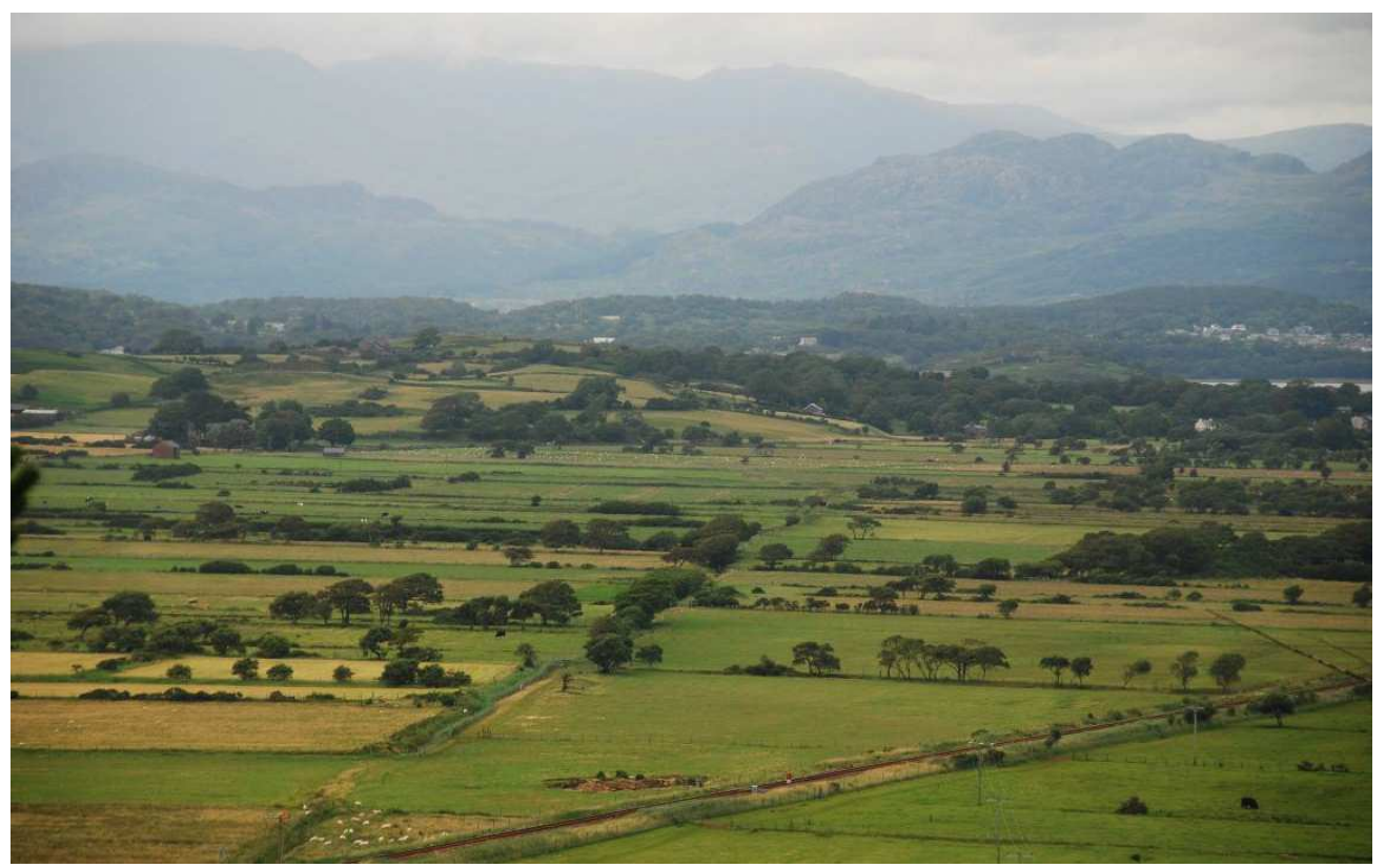
The coastal plain near Harlech, with more wooded hills bordering the Dwyryd Eestuary in the middle distance and contrasting with the spectacular, rugged mountains of Eryri beyond