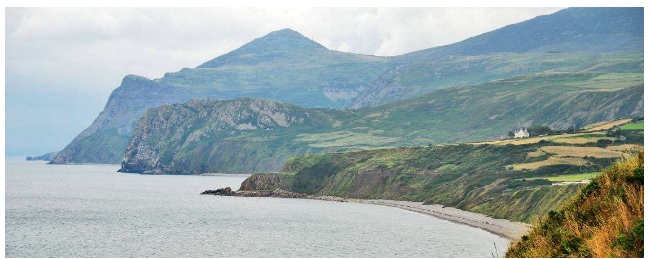
The dramatic cliffs where the northern spine of uplands plunges into the sea.