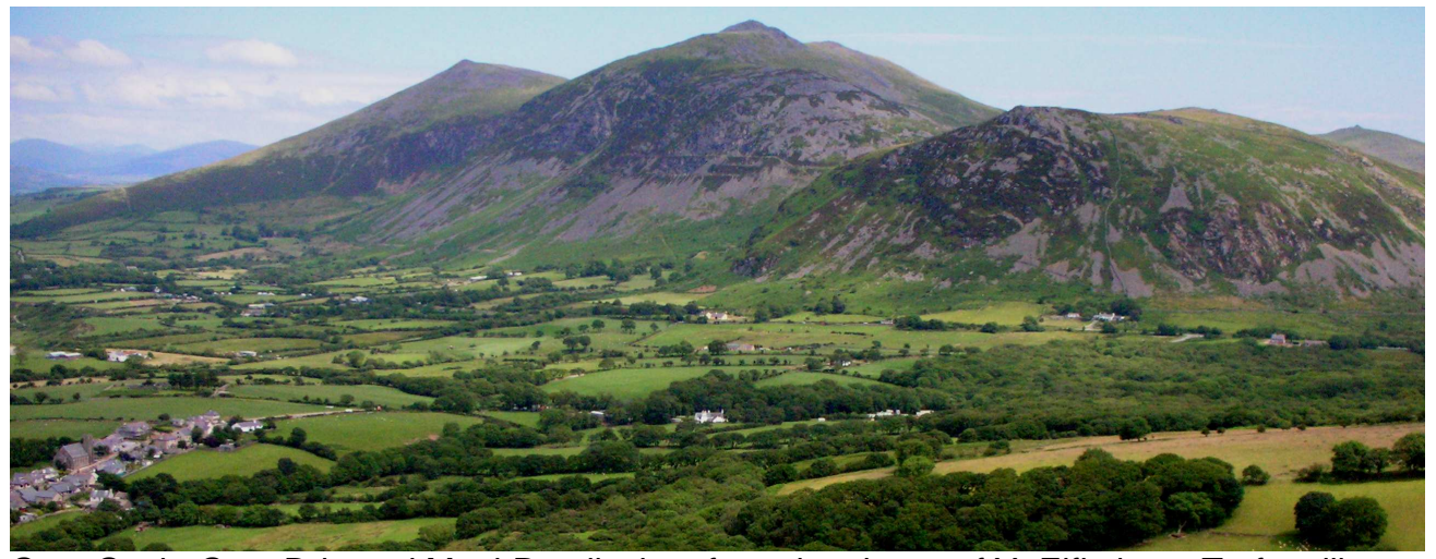
Gryn Goch, Gryn Ddu and Moel-Pen-llechog from the slopes of Yr Eifl above Trefor village.