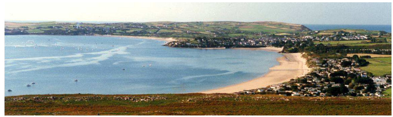
Abersoch - rock headlands forming anchor points for smoothly curved shorelines and coves.