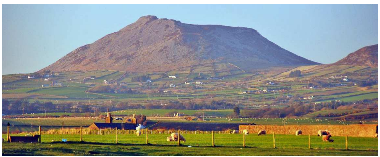
The angular skylines of steep sided rocky hills: Garn Fadrun

Llŷn is a largely tranquil, peaceful agricultural area, although the volume of summer visitors, campers and water sports in and around the larger villages along the coast at Morfa Nefyn, Abersoch and Aberdaron enliven the area and its limited amenities considerably.