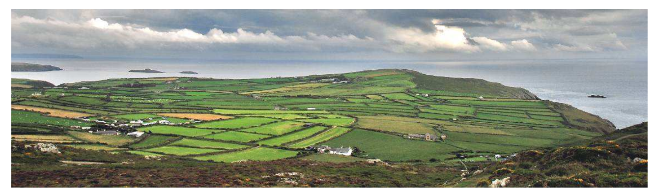
The windswept coastal fringe at Uwchmynydd: distinctive hedgerow patterns but very few trees.