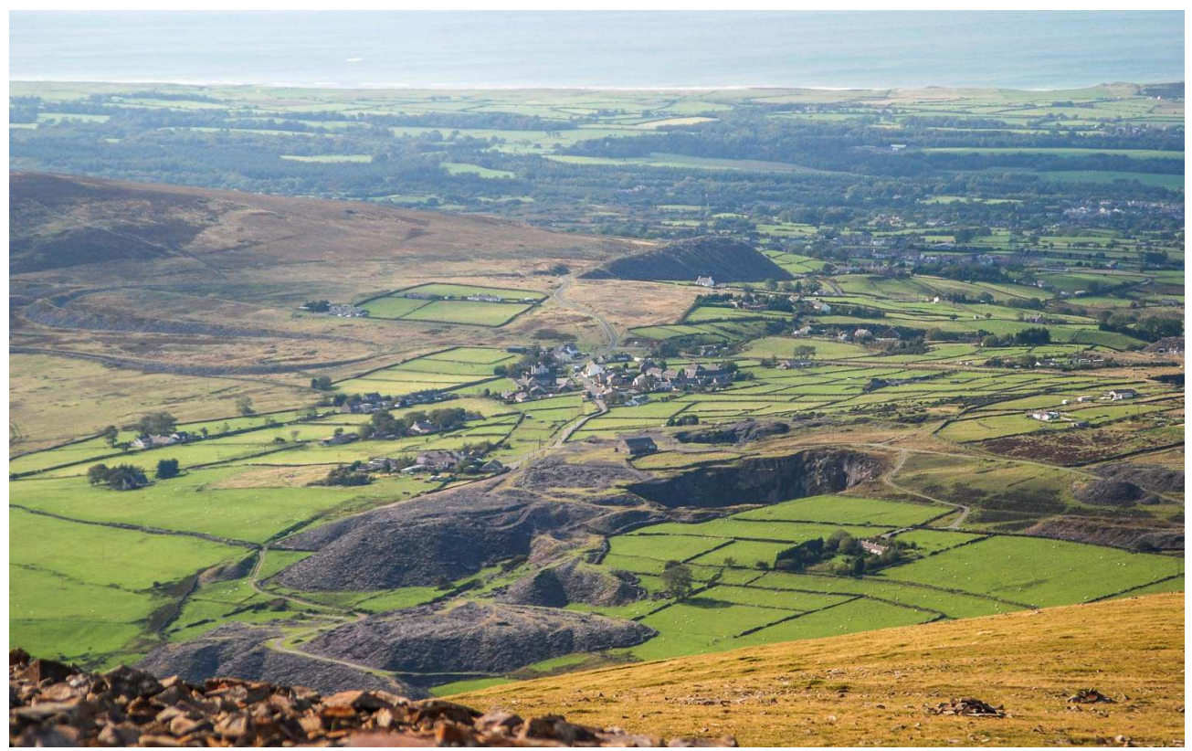
From the foothills of Snowdonia, the hamlet of Fron is set within a landscape that combines the 'gwerin' and slate quarrying. By contrast, the extensive woodland and parkland landscape at Glynllifon occupies the mid distance view, with the Caernarfon Bay coast beyond.

Since the Victorian period, Arfon has undergone a slow transformation from an economy and a culture based on agriculture and mineral extraction to a society sustained by knowledge-provision and tourism. Whilst these have appeared at times to threaten the Welsh language, it is more likely that they have supported it, by cushioning the economic impact of decline in the traditional industries and providing new employment opportunities.