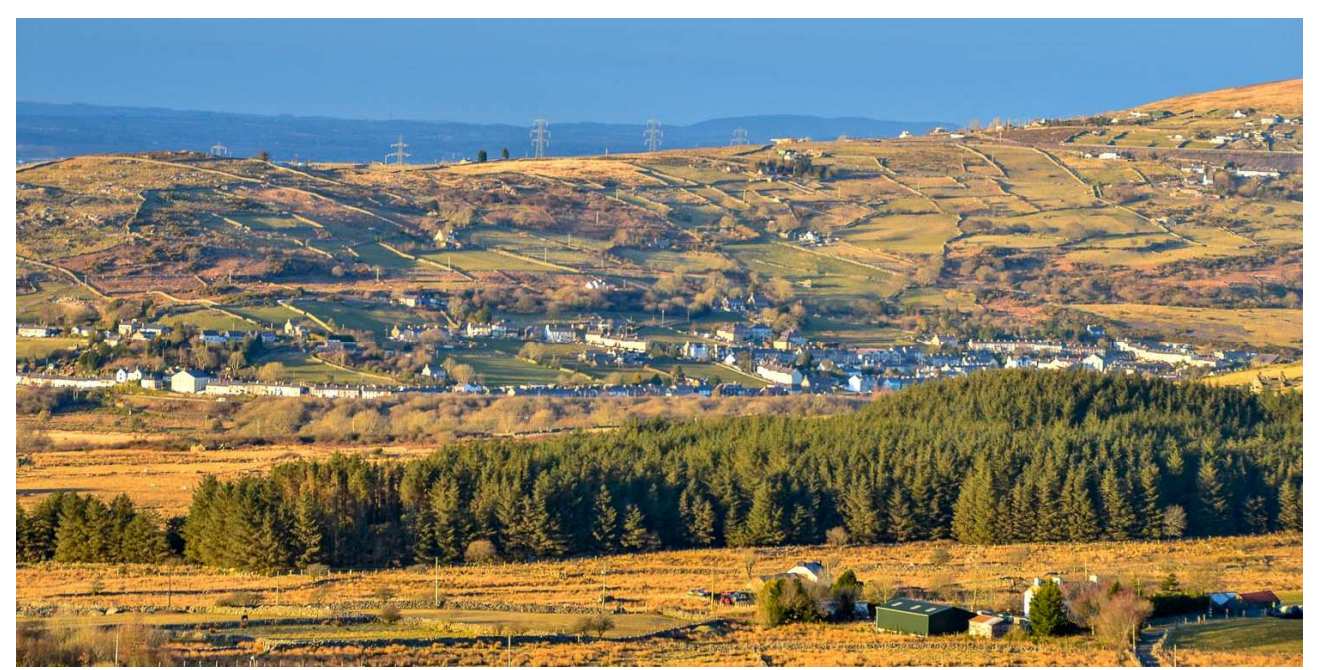
Evening sun picks out the extensive pattern of stone walls, small holdings and the terraced housing of the formar slate quarry worker's village of Talysarn.