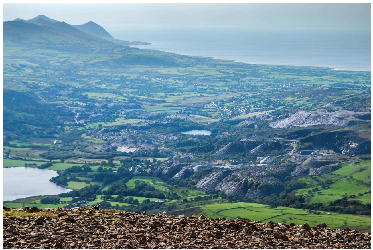
Extensive slate quarry landscapes, such as here at Nantlle, with associated settlements and small-holdings.