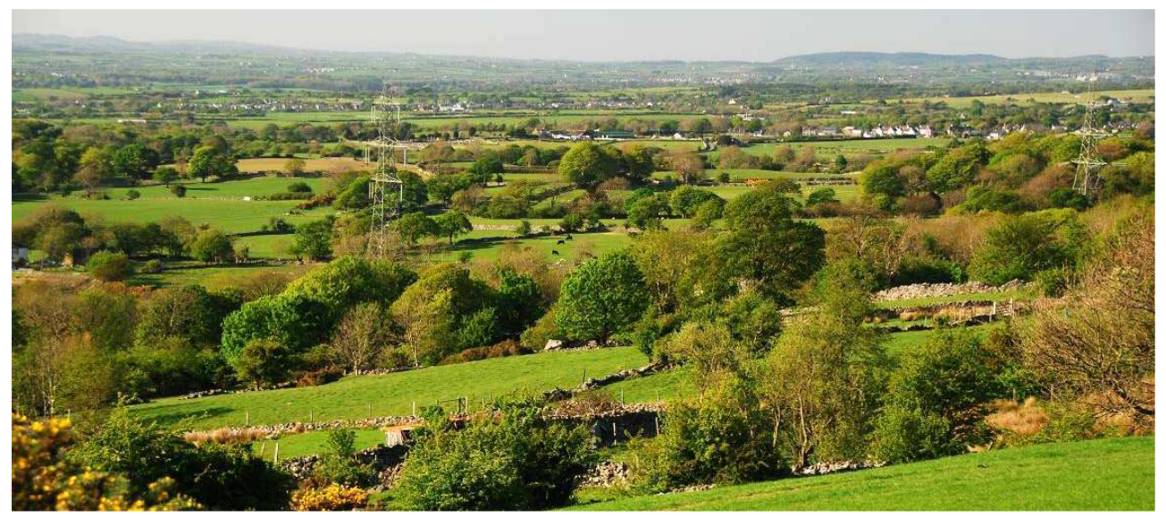
A typical scene across the Arfon plateau, seen here from Ceunant (Llanrug), at the point where the ground starts to rise into the foothills of Snowdonia. Anglesey is in the distance.

In their very different ways, Penrhyn castle, the original college building at the University of Bangor and Caernarfon castle all dominate their surrounding areas, while the 300+m (1000+ feet) high Nebo transmission mast tower is widely visible over the southern part of the area.