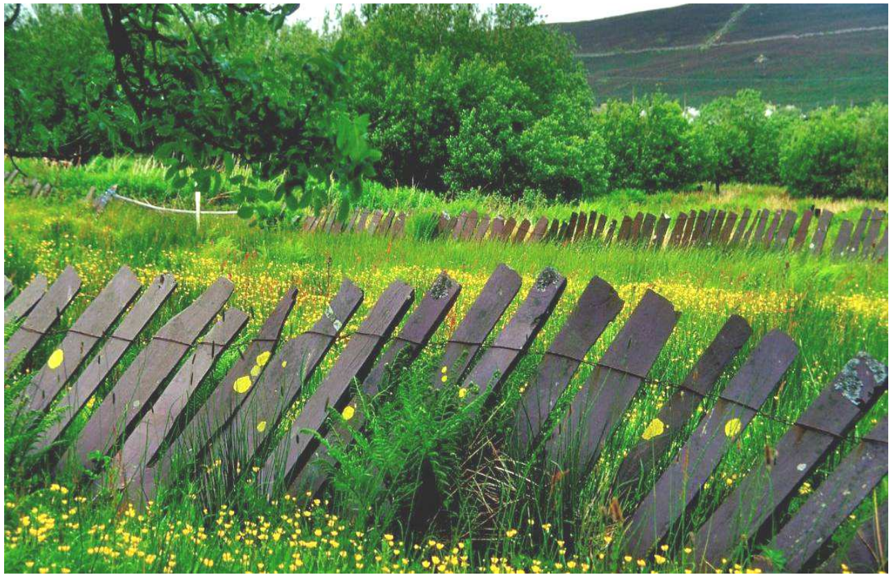
Characteristic slate post and wire fencing to small-holdings at Mynydd Llandygai, a legacy of the former Penrhyn estate and the easy access to nearby slate quarries.