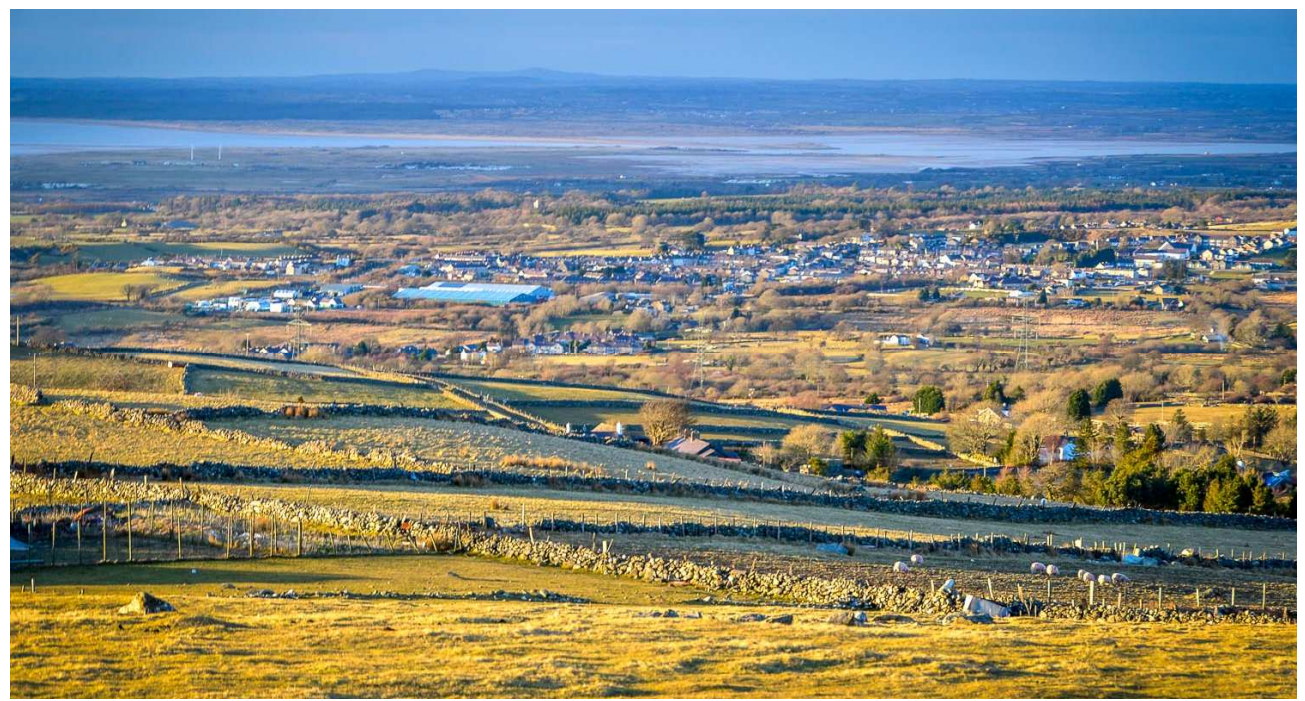
Looking over Penygroes, with the Menai Strait in the distance.