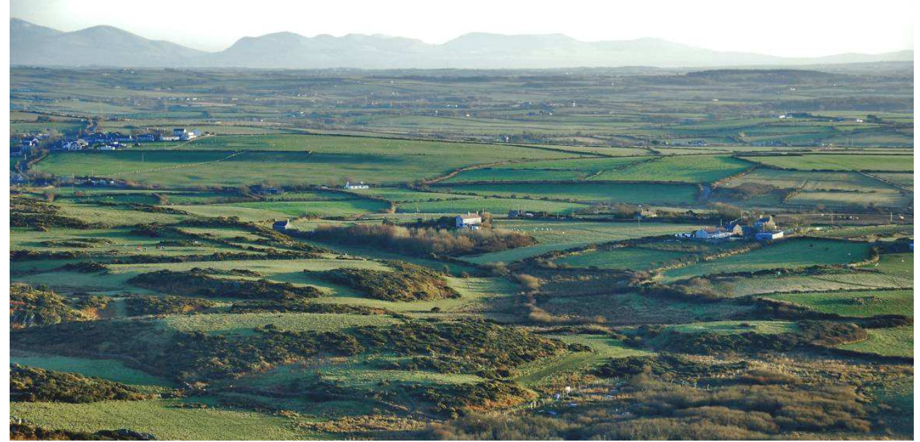
The distant outlines of the mountains of Snowdonia, from Mynydd y Garn. © John Briggs

North Anglesey – the pattern of Medieval or earlier farm buildings and field boundaries in this predominantly open and still rural landscape are punctuated by more recent features: modern housing, pylons, wind farms, and the nearby Wylfa Power Station. © John Briggs