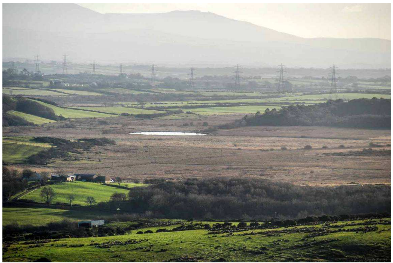
One of the larger fens, this is Cors Nant Isaf, seen from nearby Mynydd Bodafon