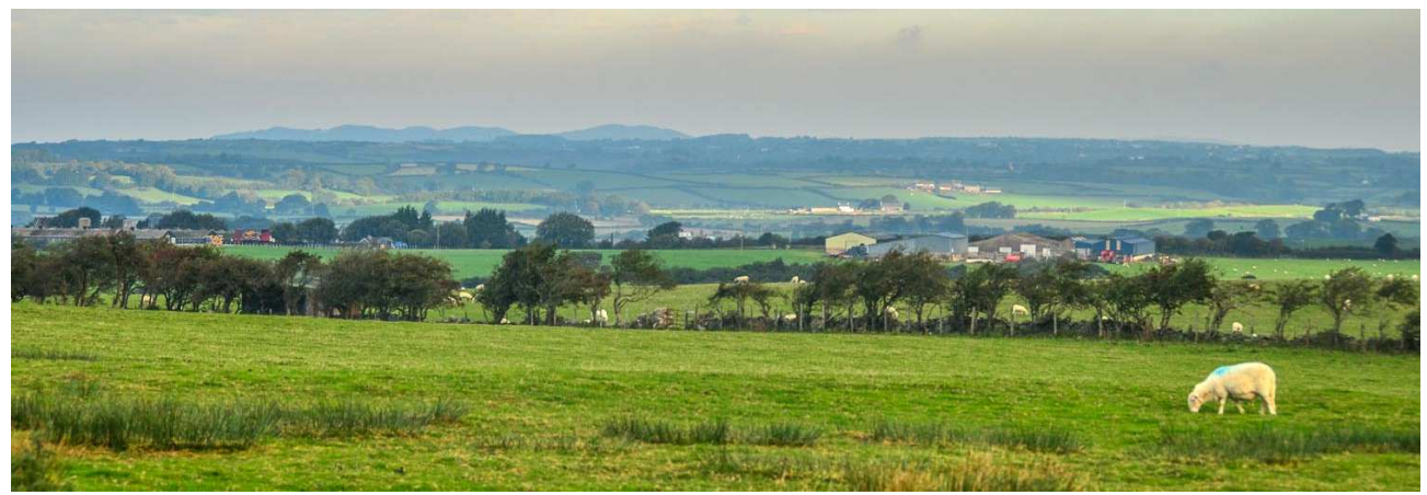
From Penmynydd looking towards the distant Parys Mountain.