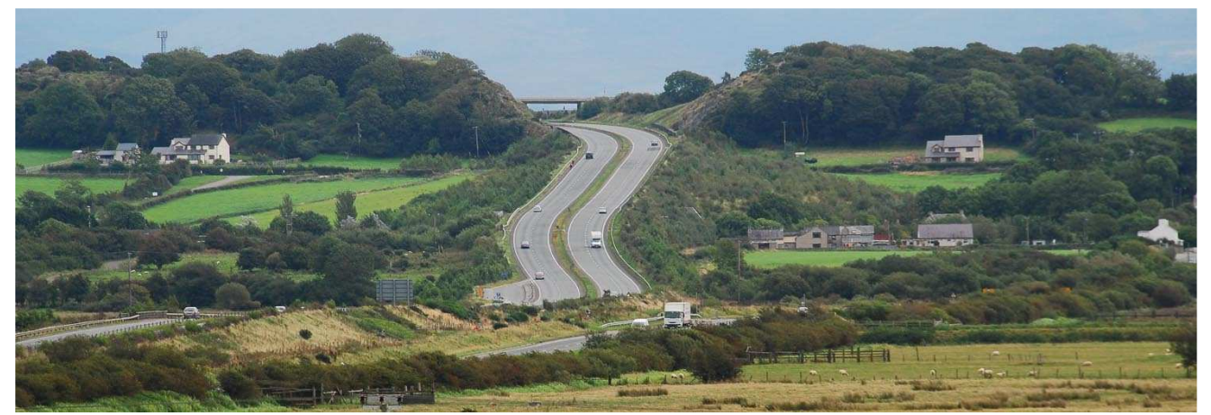
The A55 road crosses the area, here seen running over the low hill ridge SE of Malltraeth marsh, near Gaerwen.