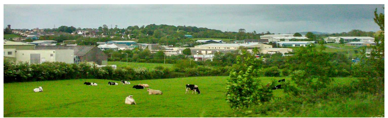
The industrial outskirts of Llangefni, in the centre of the island.