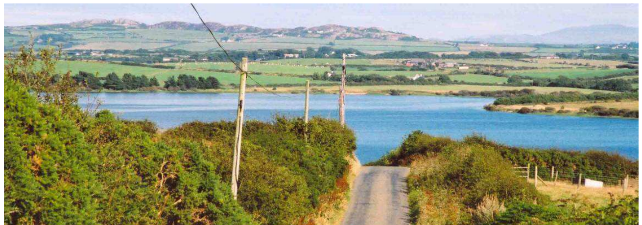
The 'lumpy' outlines of Mynydd Bodafon, in the adjacent Anglesey Coast character area, as seen across Llyn Alaw reservoir, the largest fresh water body on the island. © John Briggs

A rural landscape, characteristic with gentle rolling drumlins and open fields, with wetter fen areas between, and a backdrop of higher hills, as here at Llanerchymedd. © John Briggs