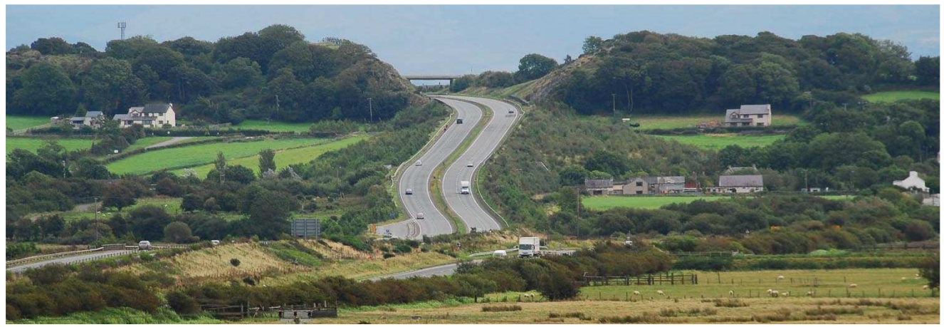
The A55 road crosses the area, here seen running over the low hill ridge SE of Malltraeth marsh, near Gaerwen.