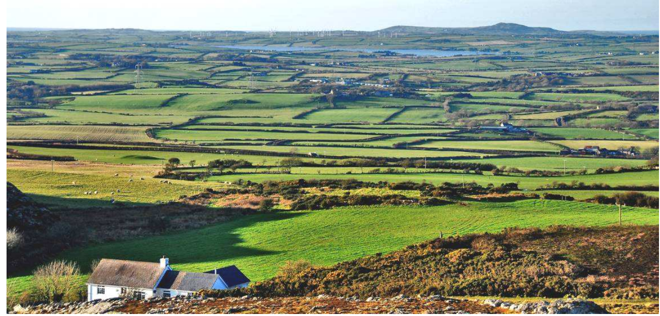
Looking across the island from nearby higher land at Mynydd Bodafon, over the open, rolling farmed landscape, to Llyn Alaw and Mynydd y Garn. Though there are many hedgerows, parts of the island, as here, have few trees or woodlands beyond localised areas.

line trains to Holyhead. Though there are two quarries near Gwalchmai, these are not widely visible.