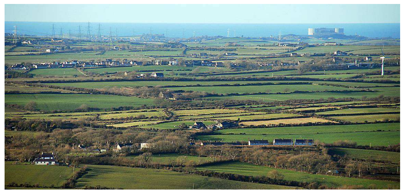
North Anglesey – the pattern of Medieval or earlier farm buildings and field boundaries in this predominantly open and still rural landscape are punctuated by more recent features: modern housing, pylons, wind farms, and the nearby Wylfa Power Station.