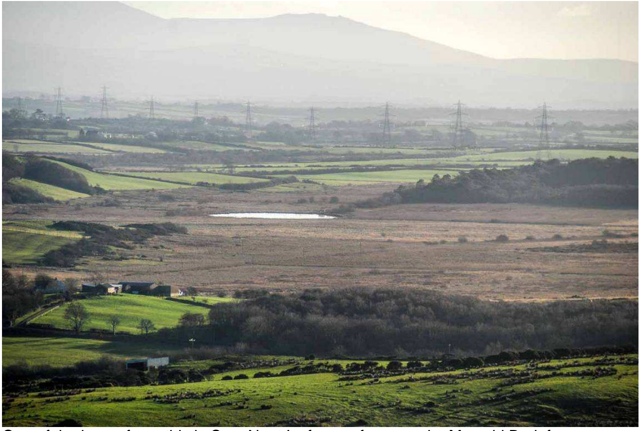
One of the larger fens, this is Cors Nant Isaf, seen from nearby Mynydd Bodafon