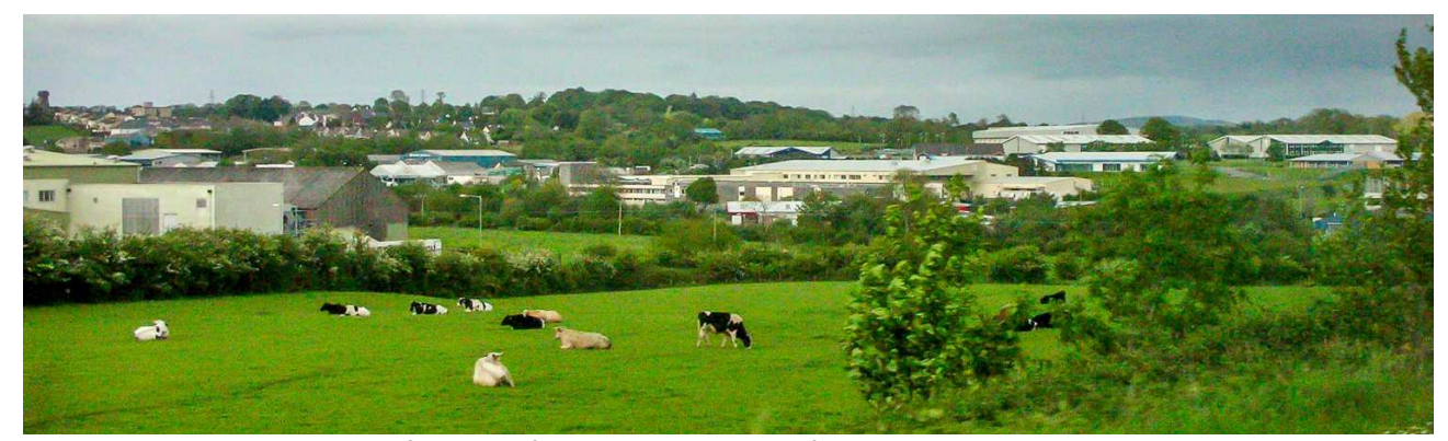
The industrial outskirts of Llangefni, in the centre of the island. © John Briggs