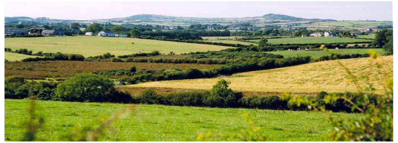
A rural landscape, characteristic with gentle rolling drumlins and open fields, with wetter fen areas between, and a backdrop of higher hills, as here at Llanerchymedd.