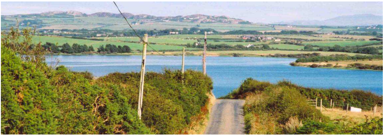
The 'lumpy' outlines of Mynydd Bodafon, in the adjacent Anglesey Coast character area, as seen across Llyn Alaw reservoir, the largest fresh water body on the island.