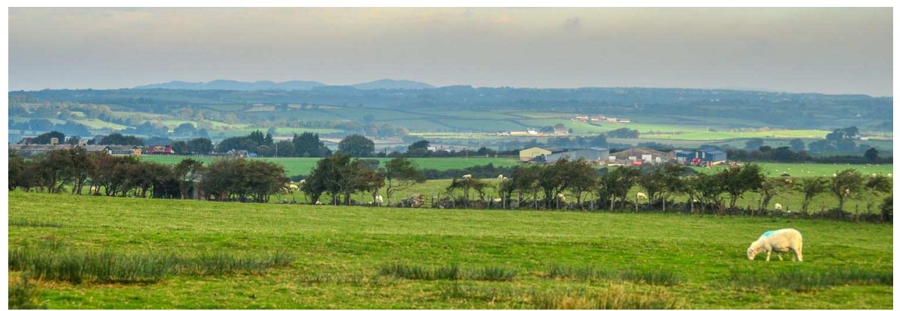
From Penmynydd looking towards the distant Parys Mountain.