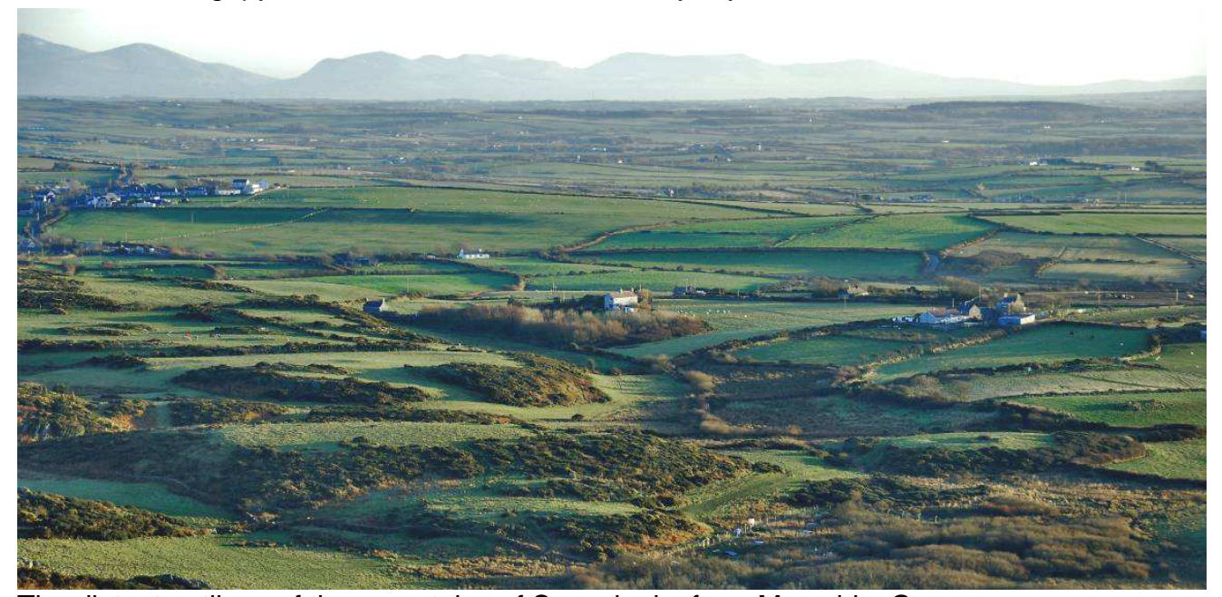
The distant outlines of the mountains of Snowdonia, from Mynydd y Garn.