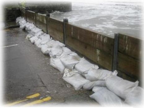
Figure 2: Temporary flood defence in action