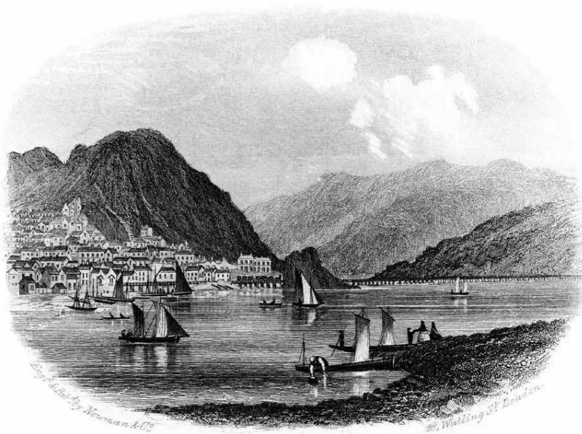
Barmouth Bridge over the Mawddach.

A steel engraving of Barmouth from c. 1860