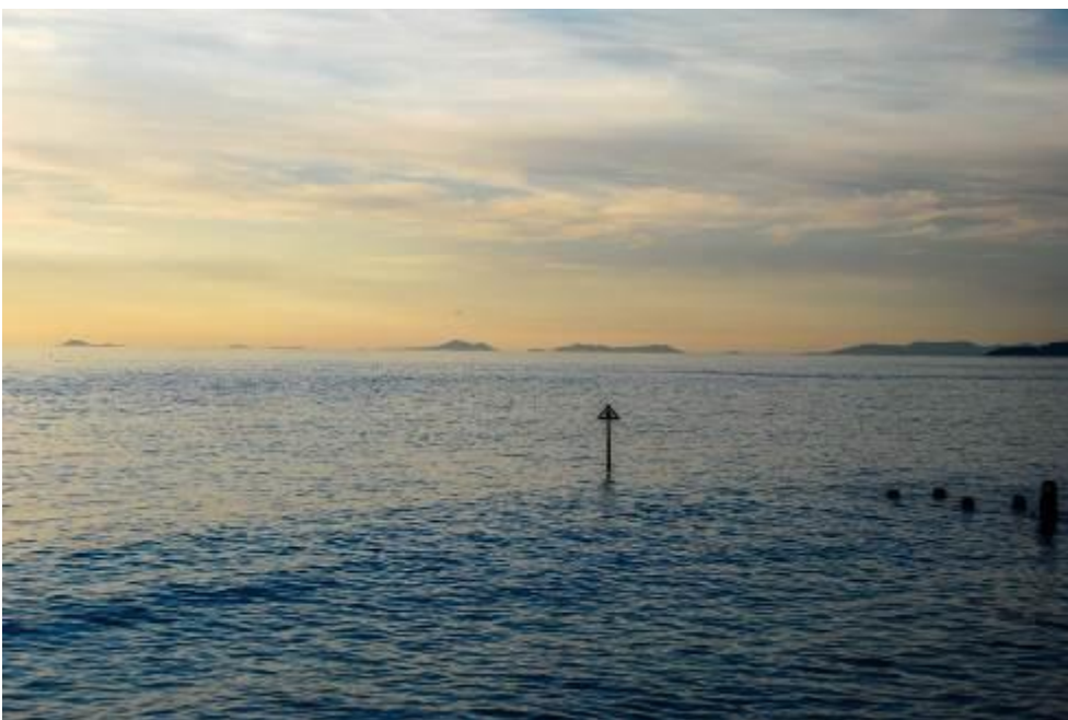
Llyn Peninsula from Aberystwyth (looking across MCA 15)

Draining into Barmouth Bay, the Mawddach Estuary is designated as SAC and SSSI, with extensive intertidal habitats and grazing marshes supporting important breeding bird populations. Further down the coast is the similarly scaled Dyfi Estuary, also fringed by extensive sand banks, mudflats, dunes, saltmarsh and 19 th century grazing marshes. Designated as SAC, Ramsar, NNR and SSSI, the estuary also falls within a wider UNESCO Biosphere Reserve. The site provides evidence for environmental changes through the Holocene epoch, and is of considerable value for wetland birds. The Dysynni Estuary and further minor watercourses drain into the bay from the mountains to the east, creeks and channels providing nursery grounds for bass and mullet. South of the Mawddach, the coastal belt consists of spectacular high cliffs composed of Aberystwyth Grits supplying sediment northwards to Borth beach. Tidal and long-shore drift processes greatly influence the swash-aligned coast of this MCA.