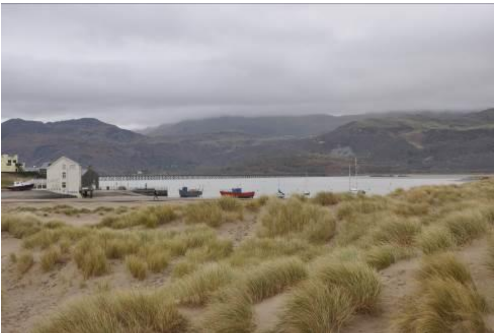
Barmouth railway viaduct and wooden trestle bridge

The medieval period saw the development of the bay's potential for maritime trade in the rich marine and mineral resources of the wider area. Aberdyfi traded in herring, slate, oak bark and lead and Barmouth was famous for its ship-building and 19 th century minerals export (including copper and gold from Snowdonia). Both ports developed around the mouths of the west-facing estuaries, benefiting from close links to the Irish Sea (and beyond), as well as their proximity to the Snowdonian valleys and hills with their rich mineral resources and farming economy. Further growth and economic prosperity was facilitated by the arrival of the railways in the 1860s – today, making the journey along the scenic Cambrian Coast railway is a popular tourist activity, affording expansive views across the bay with its spectacular mountain backdrop. The Grade II* listed Barmouth wooden trestle railway viaduct forms a distinctive local landmark on the Mawddach Estuary, including in views from the summer pedestrian ferry and miniature Fairbourne Railway.