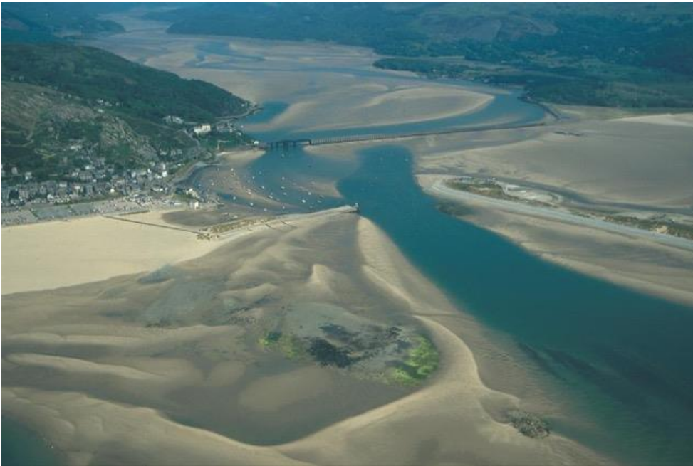
Mawddach Estuary, with Barmouth and the wooden trestle railway bridge.

The increase in maritime traffic during the 18 th and 19 th centuries is linked to a large number of documented ship wrecks within Cardigan Bay, many of which foundered on the sarnau, ending with the vessel going ashore near Barmouth or on the reef itself. A lightship was used to warn mariners of the perils of entering the northern end of Cardigan Bay from 1870s onwards. Examples of losses include the nationally designated wreck sites of the Diamond (a 19 th century American-built merchant vessel) and Bronze Bell (a 17 th century French vessel). Notable remains on the seabed associated with the Bronze Bell include the precious Carrera marble blocks she was carrying from Italy, along with her iron cannons. The environs of Sarn Badrig are the subject of ongoing investigations by Cadw because of the density of reported losses.