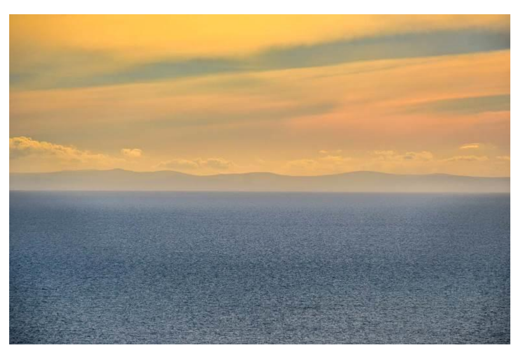
Zoomed-in sunset view from Holyhead Mountain across this MCA to the Wicklow Hills

Eastern views are framed by the distinctive form of Holyhead Mountain and the rocky, wave-exposed western facing coast of Holy Island framing MCA 09. In the southern parts of the MCA, the distant mountains of Snowdonia National Park and the conical hills of the Llŷn AONB are visible, lessening the remote, exposed feel of the open sea. Further to the north and west coastline features become less distinguishable and there is an increasing sense of remoteness, although the Isle of Man can be seen on the horizon in clear conditions.