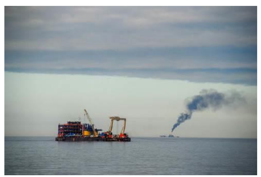
Douglas Oil Platform flare and wind farm construction vessel

with a hub height of 98 metres. There is strong intervisibility between the moving turbines and those of adjacent Rhyl Flats wind farm in MCA 02 to the south. Submerged power cables associated with the offshore wind farms cross the sea floor to make landfall and grid connection along the coastline to the south.