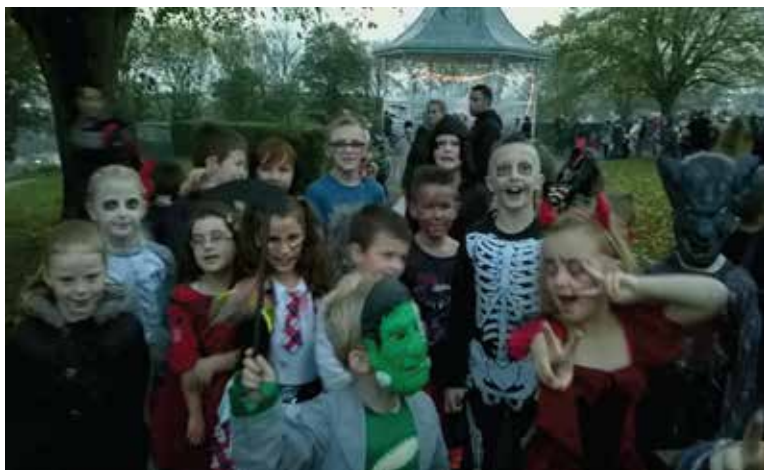
The zombie run that drew 90 eager children outdoors (as well as 15

Outside! these groups rediscovered green spaces in their community that they hadn't visited since they were children themselves. They added that because they now know the safe places to take their children, they would use them more often.