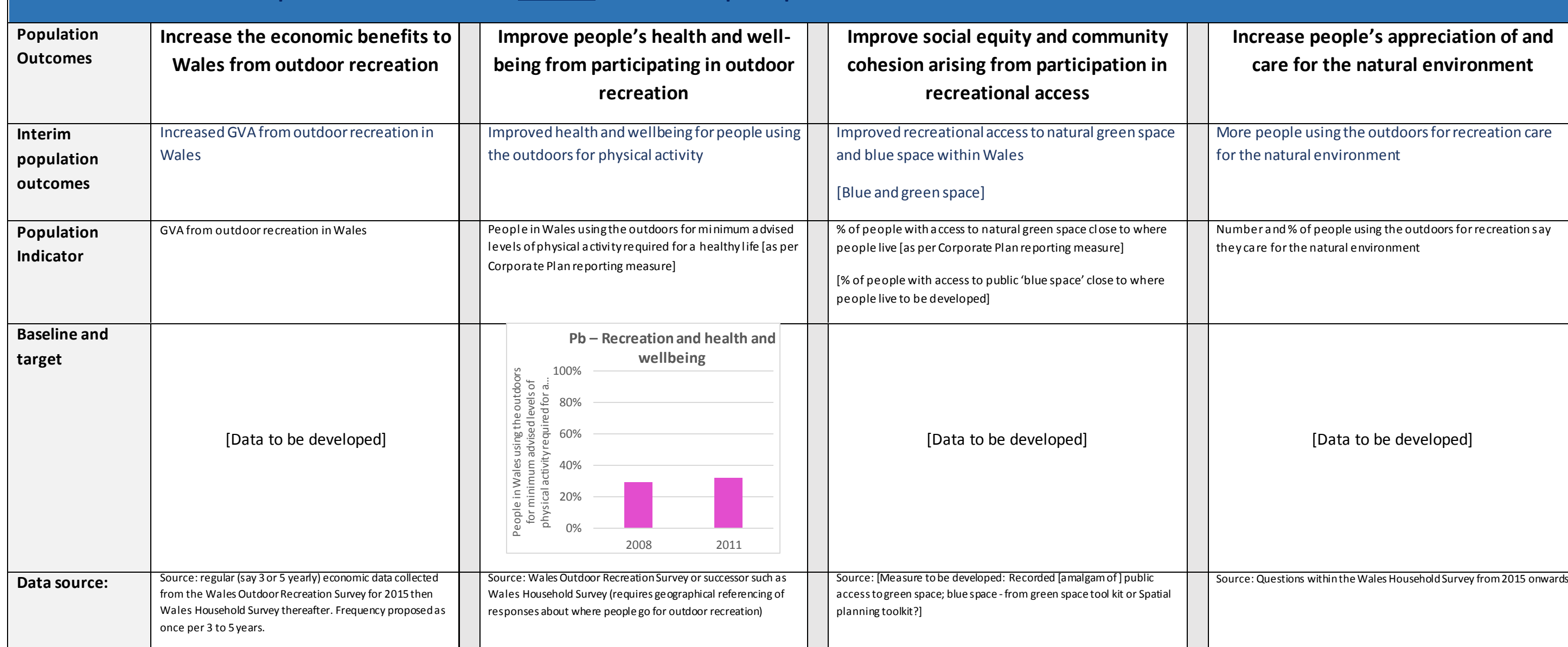
Table 3: What is the Wales picture in relation to the benefits of increased participation in outdoor recreation?