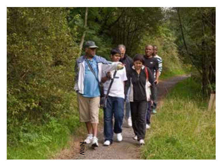
OGN 45, April 2017 Page 7 of 65

There has been a patchy response to the Equality Act 2010 from some organisations. Facilities and services are often promoted more effectively to people with some protected characteristics than to others. For example, promotional materials often show families with young people enjoying the outdoors, and fail to portray diversity in terms of ethnicity for example.