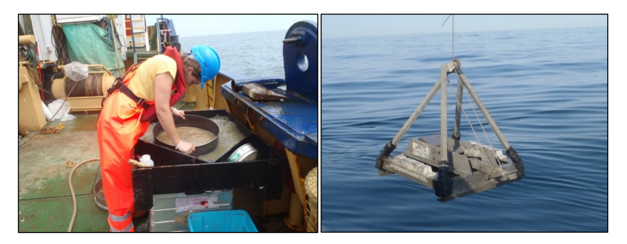
Figure 2. Sieving a grab sample on board (left); deploying a Hamon grab (right).

If chemical analyses are required, a stainless-steel grab must be used, with sub-samples collected for different chemical analyses. Sample containers will generally be supplied by the analysing laboratory. A plastic scoop should be used to remove samples for metal analysis samples, while a stainless steel or aluminium scoop should be used to remove samples for analysis of organic compounds. The analysing laboratory can advise on the amount of sediment required based on the analyses to be conducted.