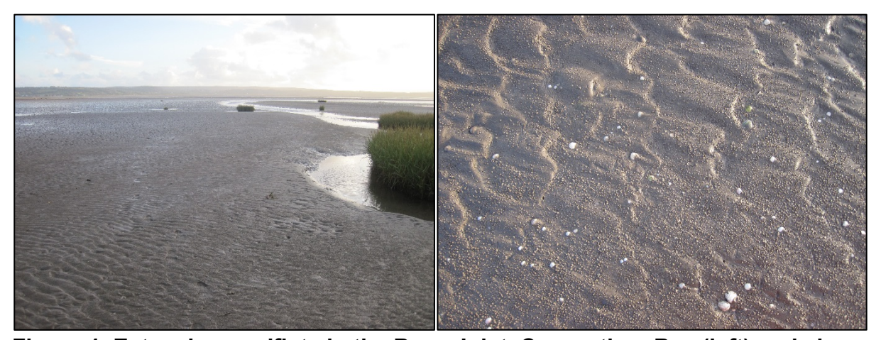
Figure 1. Extensive mudflats in the Burry Inlet, Carmarthen Bay (left) and close-up of muddy sand habitat with Corophium sp. holes (right).

There are numerous littoral sediment habitats to be considered when designing benthic habitat characterisation and monitoring surveys. However, any monitoring programmes required for marine developments or activities will generally be focussed on habitats or biotopes of conservation importance and/or those that have a high sensitivity to particular anthropogenic pressures (see sections 2.4 to 2.6).