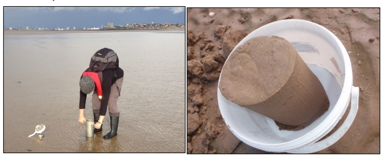
Figure 3. Deploying a hand corer (left) and a sediment core after collection (right)

If chemical analyses are required, subsamples should be collected, usually taken using a scoop from the sediment surface. Separate samples should be collected for the different analyses required. Sample containers will generally be supplied by the analysing laboratory. A plastic scoop should be used to remove samples for metal analysis samples, while a stainless steel or aluminium scoop would be used to remove samples for organic matter analysis.