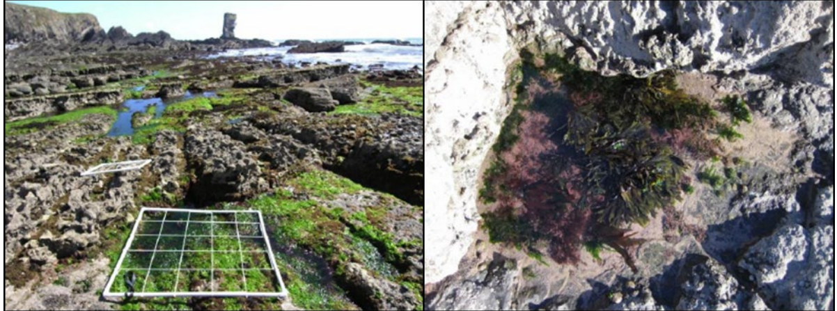
Figure 3. Quadrat sampling of a rockpool dominated by Ulva sp. (left) and a shallow rockpool with abundant Corallina spp. (right). Photographer Francis Bunker (Bunker, 2010). Images © NRW