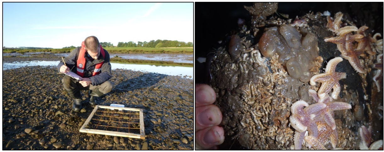
Figure 4. Quadrat sampling (left) and under-boulder sampling (right). Images \ensuremath{\mathbb{C}} APEM Ltd.