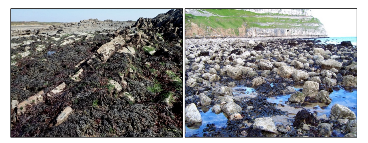
Figure 1. Intertidal bedrock on a section of coast at West Angle Bay, Pembrokeshire, partially sheltered from wave action (mid energy littoral rock), photographer Francis Bunker (left); intertidal boulder habitat at Llandudno, north Wales, exposed to wave action (high energy littoral rock) photographer Krysia Mazik (right). Images © NRW